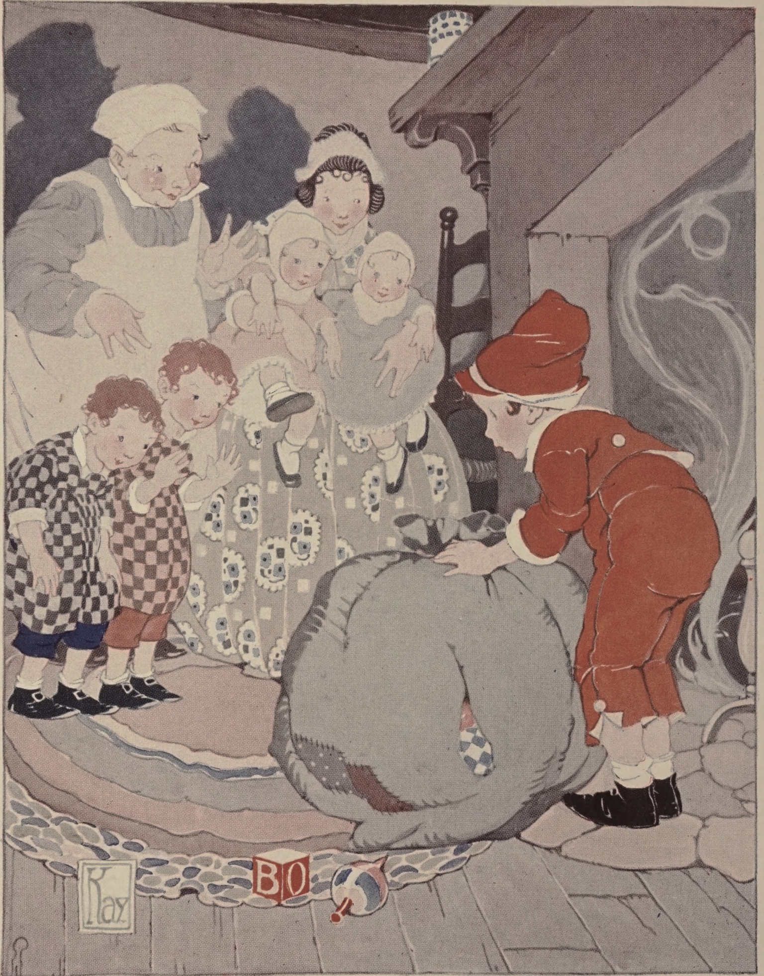
'I have toys for my little brothers,' cried Santa