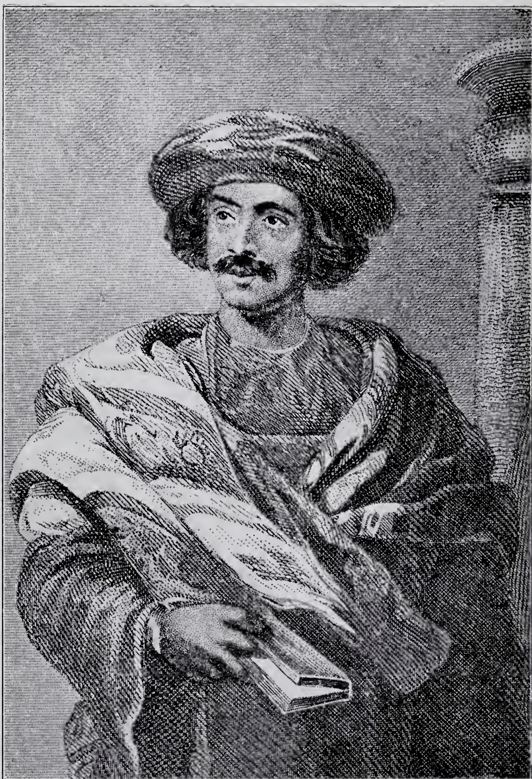
RAM MOHAN ROY