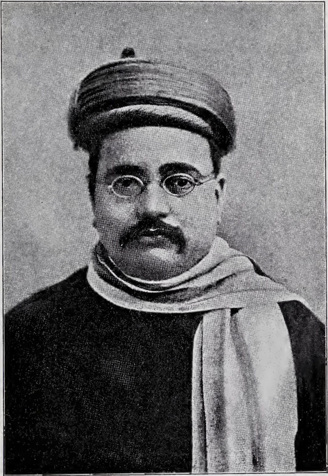
G. K. GOKHALE