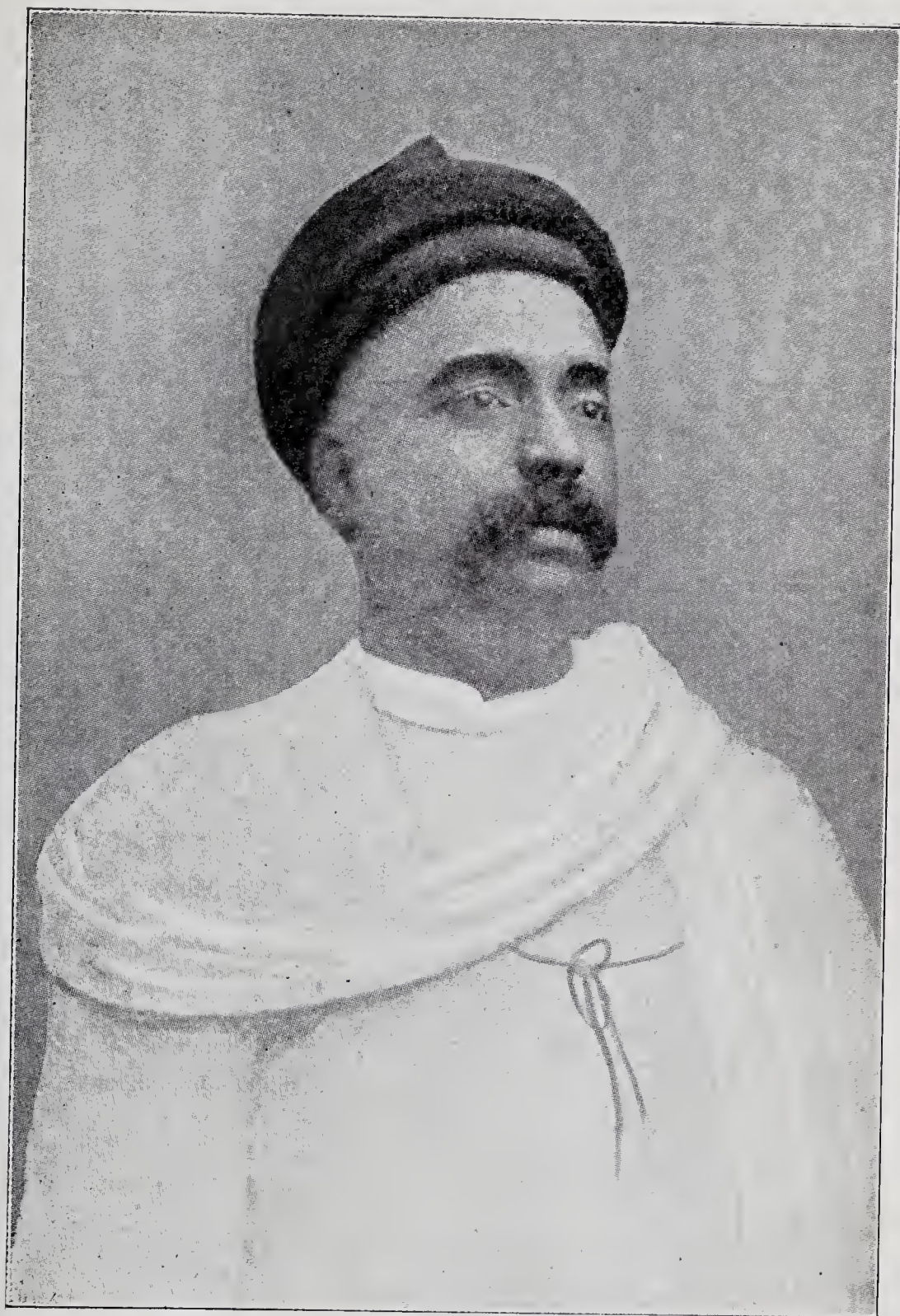
BAL GANGA DHAR TILAK