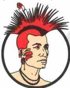
LONG ISLAND SACHEMS

Today many months, many miles and many dollars later Meierdiercks and Wallace push forward with their vision.