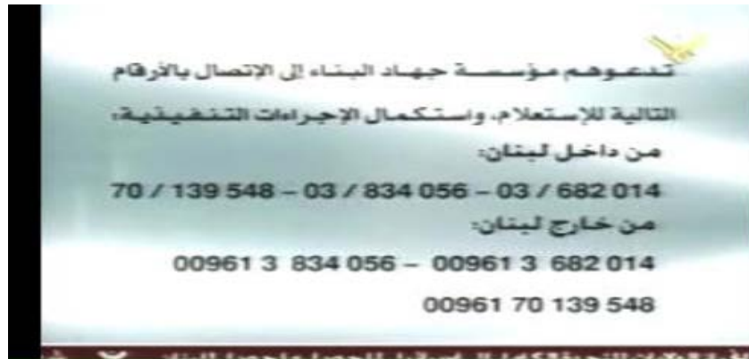
Figure 9. Jihad al-Bina' advertisement run on Al-Manar television in 2006 asking for volunteers and donations with call-in phone numbers 275