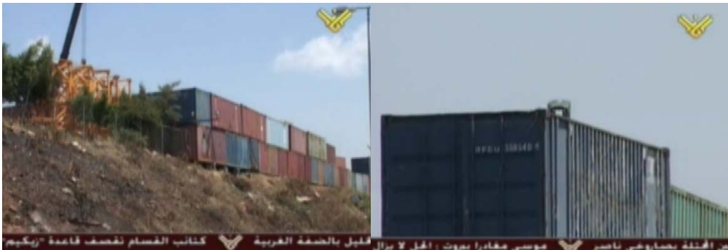
Figure 13. Al-Manar TV news broadcast screen shots of Jihad al-Bina ’ containers with cameras overlooking Rafiq al-Hariri International Airport in Beirut 321

The government also accused Jihad al-Bina ’ of setting up and operating a camera system for Hezbollah utilized to monitor traffic to and from Beirut’s international airport and flights on one of its runways. Members of the Lebanese army on patrol around the airport discovered the cameras and monitoring equipment affixed to shipping containers owned by Jihad al-Bina ’ (Figure 13). Walid Jumblatt called for removing the cameras and for banning Iranian airlines from landing in Beirut because they likely smuggle in weapons and cash into the country, circumventing sanctions. 320