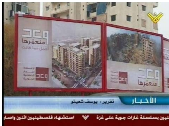
Figure 10. Screen shot of Al-Manar report on launch of Wa'ad project in Beirut's southern suburbs aired on May 17, 2007 276