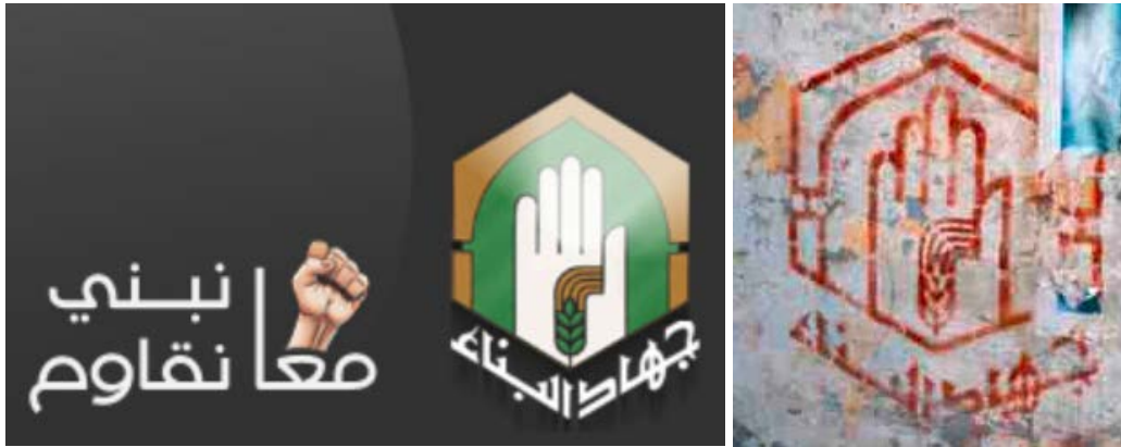
Figure 1. Jihad al-Bina’ logo 100

The strand of wheat is also found on Hezbollah’s flag, signifying growth and social services provided by the organization. 99 As Jihad al-Bina’ is one of these social services that specializes in agricultural projects, among others, it is appropriate that wheat is a central characteristic of Jihad al-Bina’ ’s logo (see Figure 1).