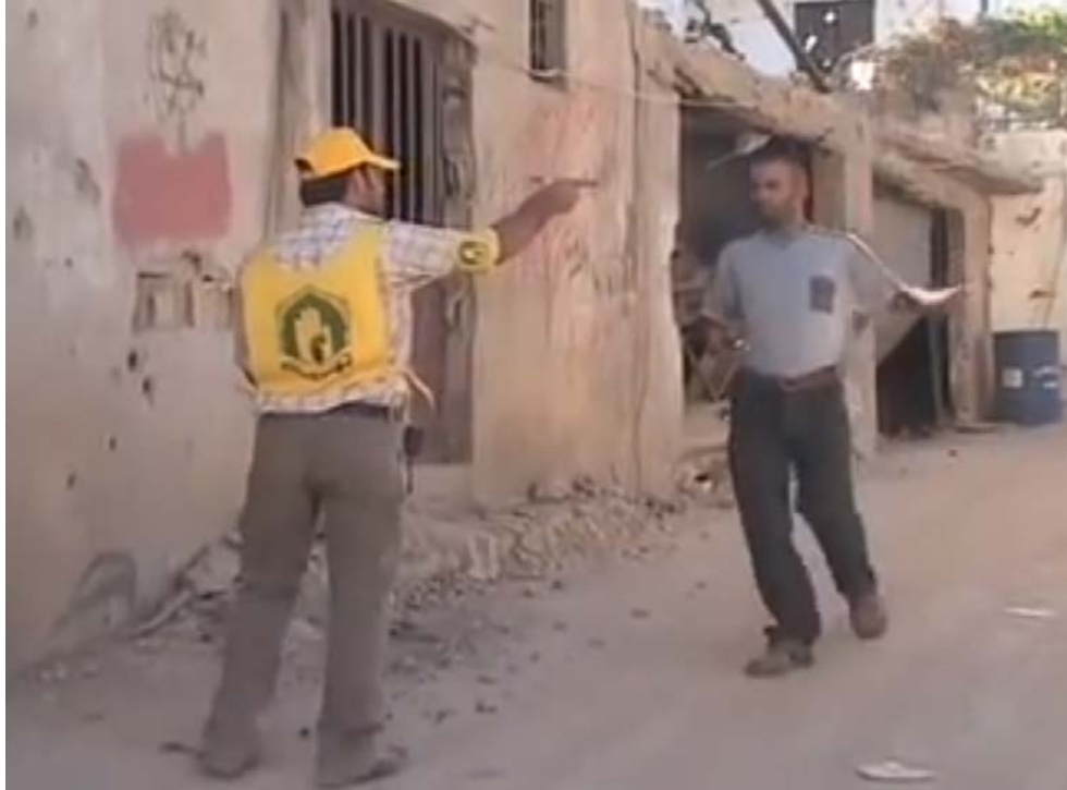
Figure 12. The yellow uniformed Jihad al-Bina' inspector conducts initial postwar damage assessments in the border town of 'Aita al-Cha'b in southern Lebanon 2006 294

Once turned in, the local Jihad al-Bina' representative determined how much compensation would be necessary for the resident to rebuild their home or repair the damage. If houses needed to be rebuilt, Jihad al-Bina' reassured residents that they would take on all aspects of the reconstruction process. 295 As was done in the southern dahiyya , Jihad al-Bina' promised residents to pay for temporary housing for one year. 296