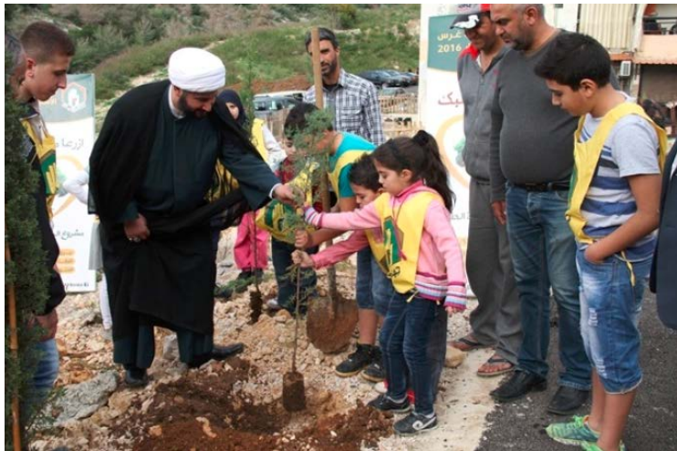
Figure 17. A local religious figure plants a tree with school children wearing Jihad al-Bina 's volunteer garb in a school in 2016 349