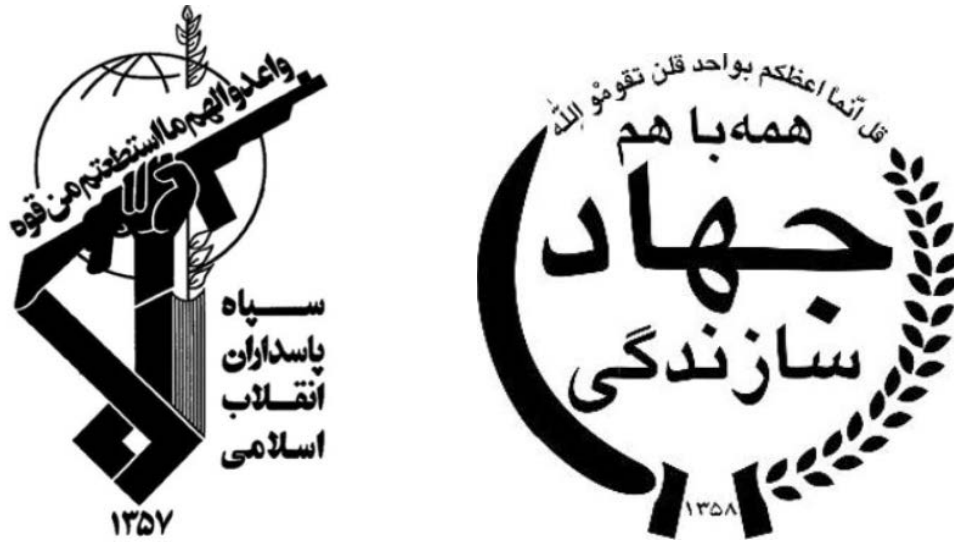
Figure 3. IRGC logo and the seal of Iran's Jihad-e Sazandegi

Both Hezbollah and Jihad al-Bina' borrowed the strand of wheat from their Iranian progenitors—the IRGC and Jihad-e Sazandegi , respectively (see Figures 2 and 3).