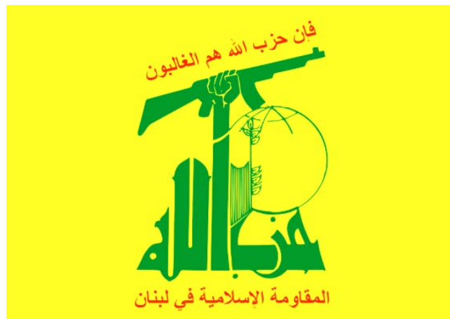
Figure 2. Hezbollah flag