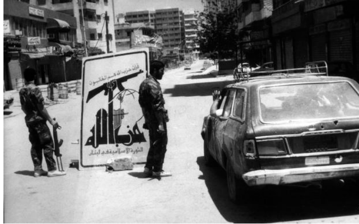
Figure 5. Hezbollah checkpoint in Beirut in 1988 111

mechanisms by which warlords vied for popular support was through social service organizations. 110