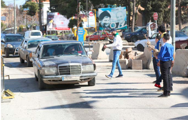
Figure 16. Imam Mahdi Scouts hand out saplings to drivers on the streets of Baalbek in 2018 348