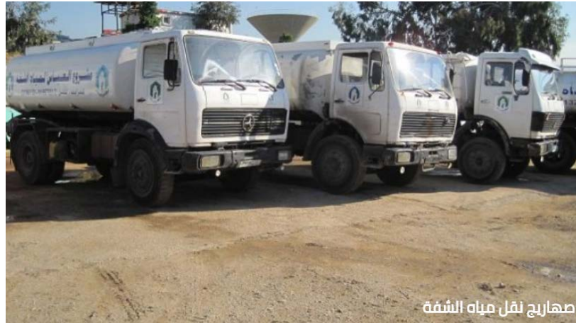
Figure 6. Jihad al-Bina' water trucks 115