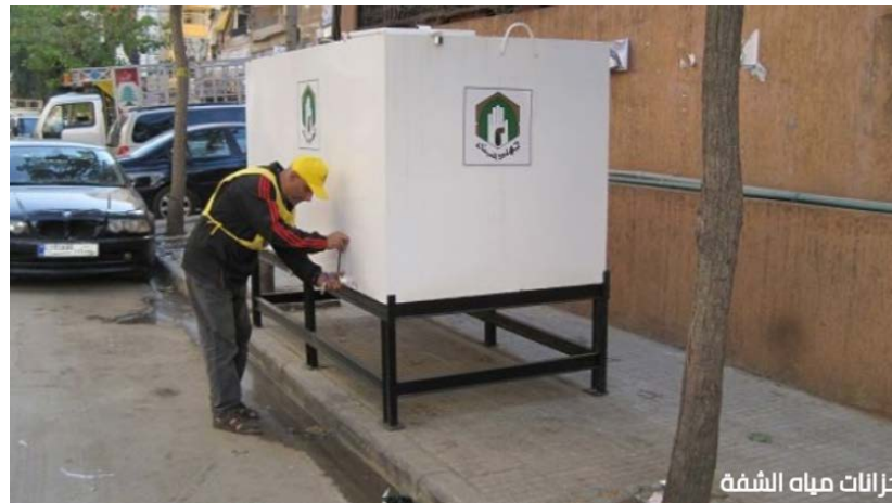
Figure 7. Jihad al-Bina' water tanks similar to those used to demarcate territory 116

Jihad al-Bina' 's performance in these times of crisis brought normalcy to afflicted residents and elevated Hezbollah's status in the eyes of its constituents and in contrast to the government and Amal's perceived ambivalence. In truth, Amal didn't have the resources to focus on the dahhiya . After the death of Mostafa Chamran in 1981, Amal lost its primary source of Iranian patronage. After Islamic Amal split from Amal in 1982, most