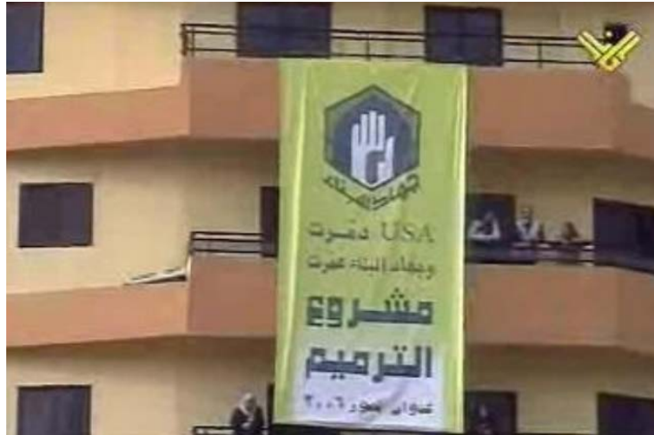
Figure 11. Al-Manar News screenshot of Jihad al-Bina' banner hung on completed building in the dahhiya reads, "USA destroyed and Jihad al-Bina' built. Restoration Project. July 2006 Aggression." 277

Jihad al-Bina' also placed over 300 posters across the southern dahhiya in the days following cessation of hostilities to reassure residents and remind them of Hezbollah's pledge. 278