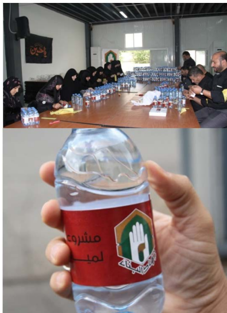
Figure 15. Jihad al-Bina’ volunteers affix logos and Shia slogans to bottles of water to be distributed to Ashura commemoration mourners 345

Jihad al-Bina’ also utilizes its water campaign to reinforce its Shia sectarian identity. Starting in 2014, the organization launched the “Labayk” water campaign. Foundation volunteers pasted Jihad al-Bina’ logos with “Labayk ya Husayn” printed on thousands of bottles of water to be handed out to the thousands of funeral procession marchers during the commemoration of Ashura held in the dahhiya (Figure 15). The organization announced it would carry on the tradition into future years. 344