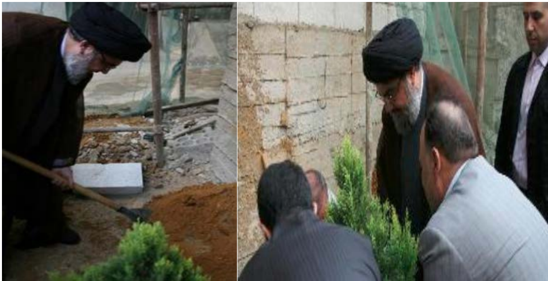
Figure 14. Hezbollah Secretary General Sayyed Hasan Nasrallah, Lebanese Minister of Agriculture Dr. Hussein Hajj Hassan, and MP Ali Ammar plant the 1 millionth tree of 2010 near Nasrallah’s residence in Haret Hreik under Jihad al-Bina’s “Good Tree” project 331

included awareness courses to help farmers overcome “fear of adopting [unfamiliar] activity such as the cultivation of alternative crops,” according Adil al-Haj Hassan, Jihad al-Bina’s media officer in 2008. In October 2010, Hasan Nasrallah with the Lebanese Minister of Agriculture and a Hezbollah member of parliament (MP) planted the 1 millionth tree that year near his residence in the Haret Hreik (Figure 14). Together, Hezbollah and the Lebanese government publicly commemorated the simultaneous benchmark accomplishments of Jihad al-Bina’s reconstruction and developmental efforts. 330