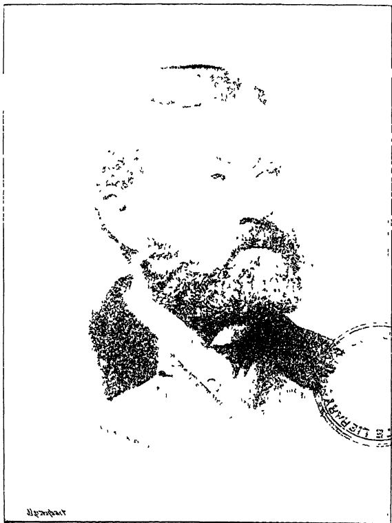
G. R. SIMS