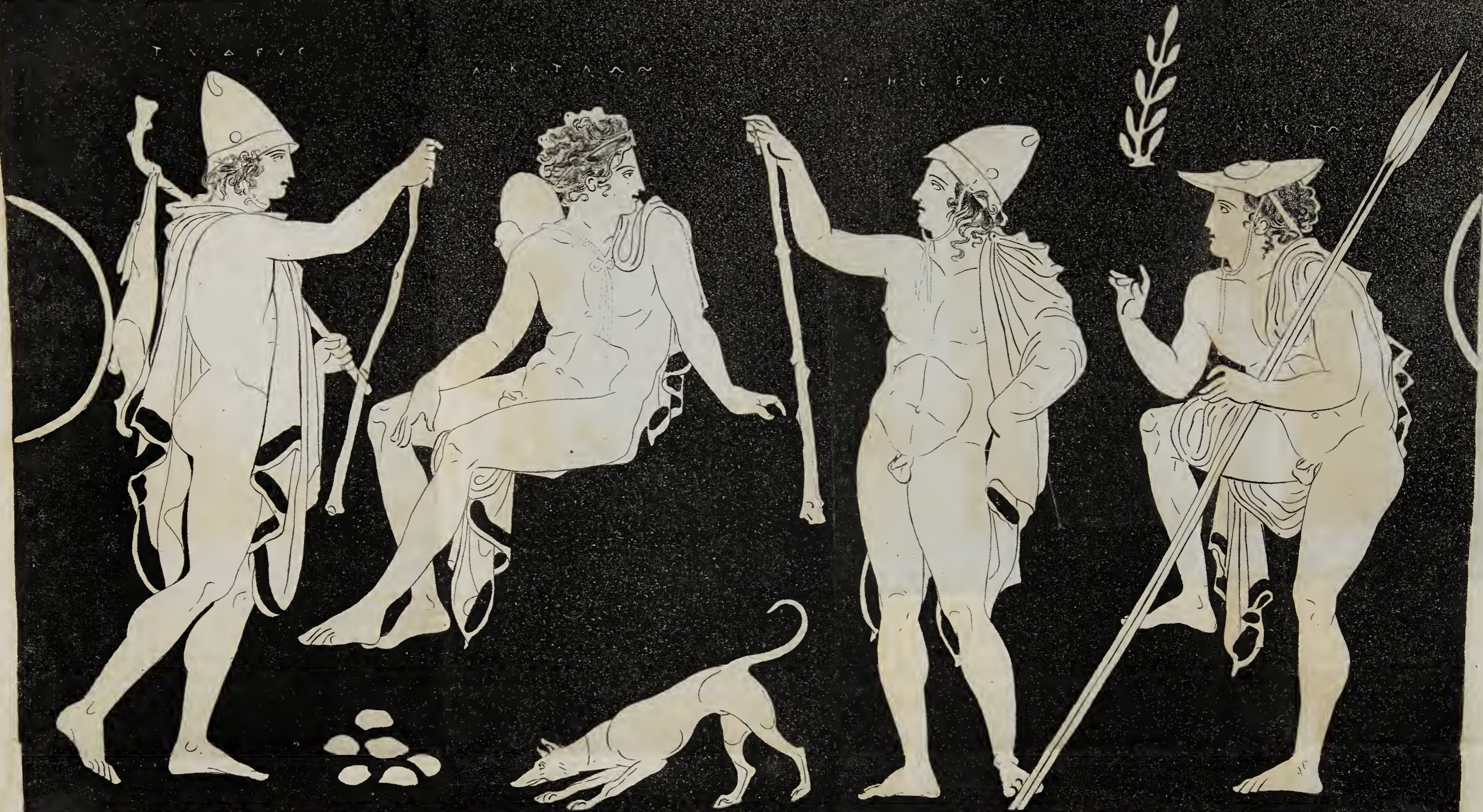
Vas fictile, tam picturae elegantia quam litterarum antiqua formâ insignè; Regii musæi Neapoli olim ΚΕΛΜΗΛΙΟΝ;