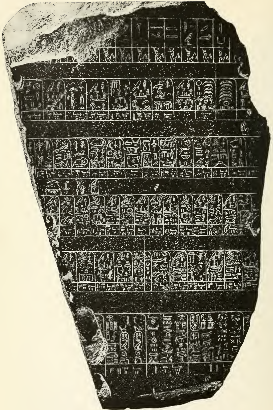
THE PALERMO STONE (See page 55)