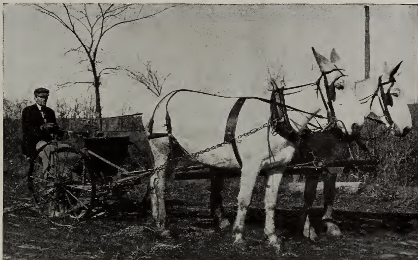
Peach Seed Planter in Operation, Planting 30 to 40 Bushels, 3 to 4 Acres, per Day.