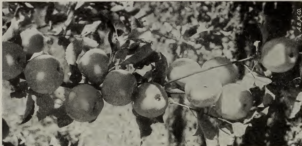
Yellow Transparent Apples.