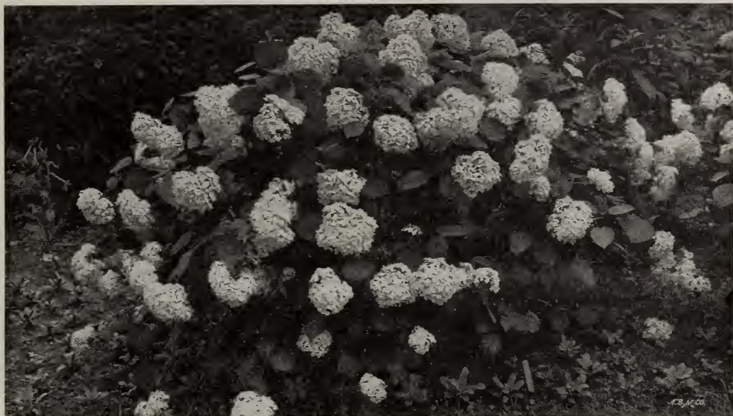
Hydrangea (See price list, page 12)