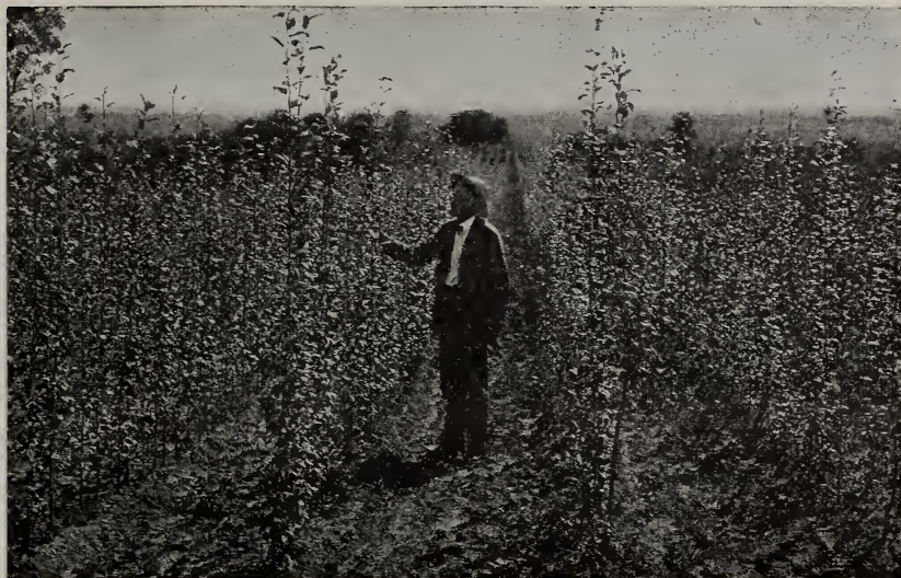
Block of One-Year Pear, New Haven Nurseries.