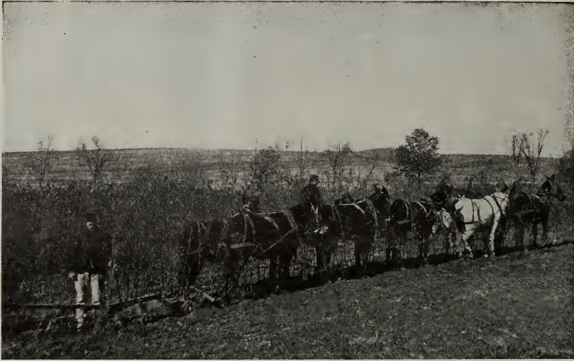
Showing Tree Digger in Operation, Digging 25,000 Trees per Day