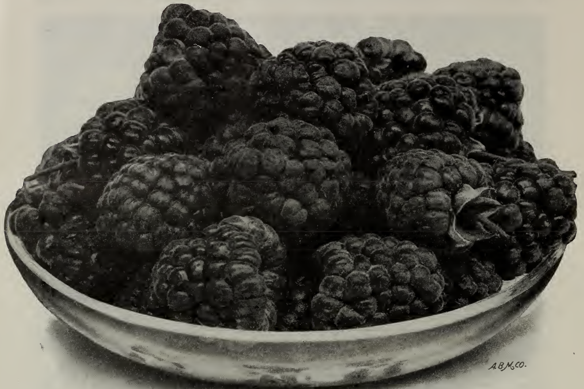
A Fine Dish of Cumberland Raspberries (See Price List, page 12).

Cumberland. The business Blackcap. It is of wonderful productiveness, producing regularly and uniformly very large crops. In size the fruit is simply enormous, far surpassing any other variety. The berries run seven-eighths and fifteen-sixteenths of an inch in diameter. In quality it is similar and fully equal to the Gregg. It is unusually firm and is well adapted for long shipments. It is an unusually strong grower, throwing up stout, stocky canes, well adapted for supporting their loads of large fruit.