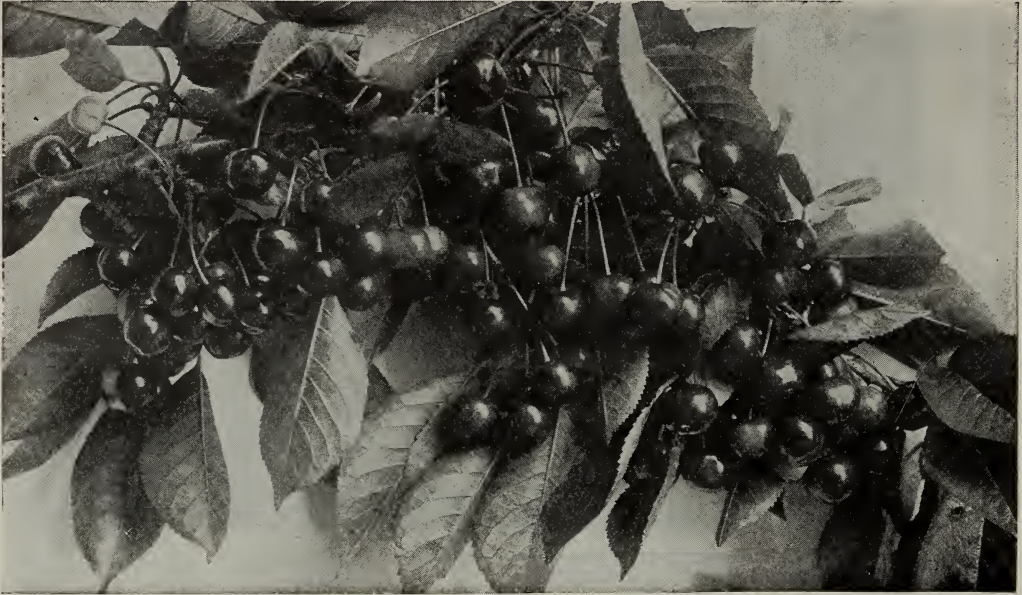
Early Richmond Sour Cherries.