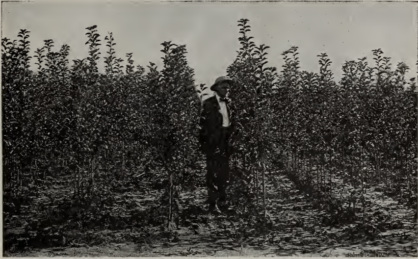
Block of Two-Year Apple, New Haven Nurseries.