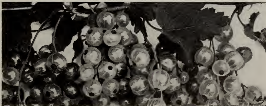
A Cluster of White Dutch Currants (See page 12).