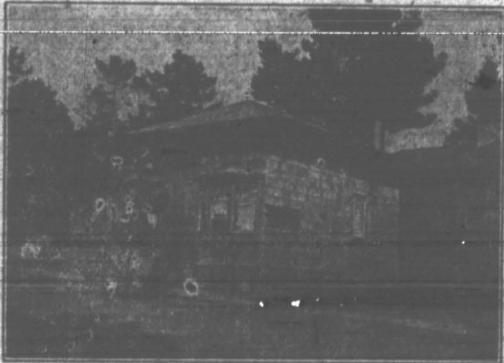
Library Building as it Appeared Before Addition was Built

The library Board is anxious to extend the usefulness of the library in several ways. Not only shall it be a mere collection of books, but it shall be a headquarters and an authority for information concerning the town, such as the principal points of interest, rides,