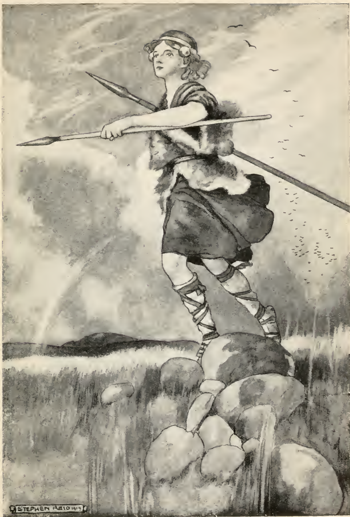
Cuchulain sets out for Emain Macha