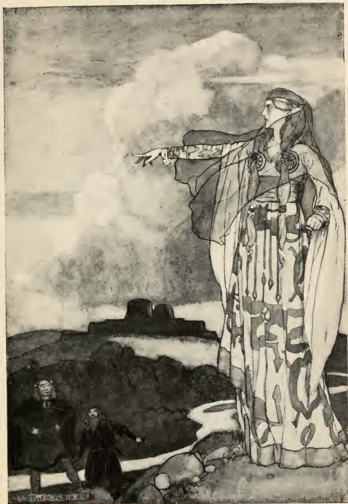
Macha curses the Men of Ulster