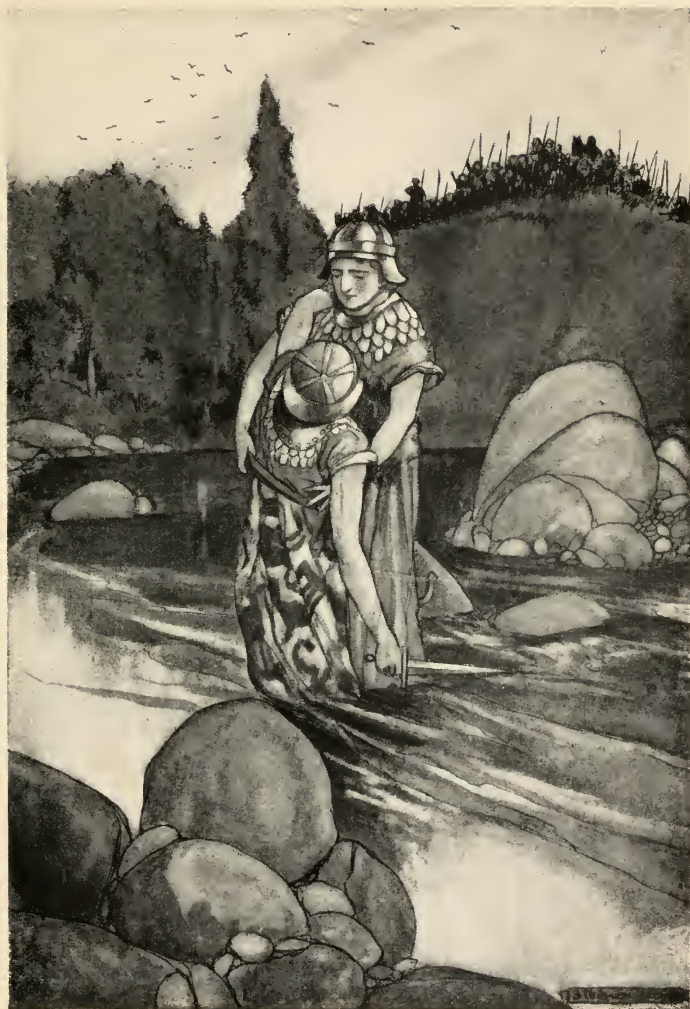
Ferdia falls by the Hand of Cuchulain