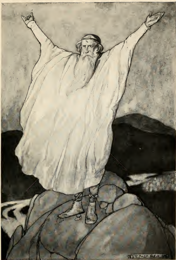
“ The moment of good-luck is come ”