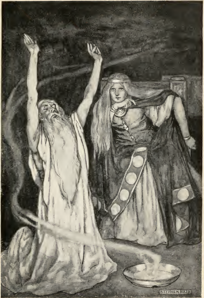
Queen Meave and the Druid