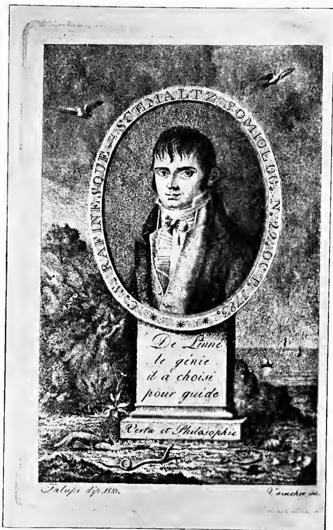
CONSTANTINE SAMUEL RAFINESQUE