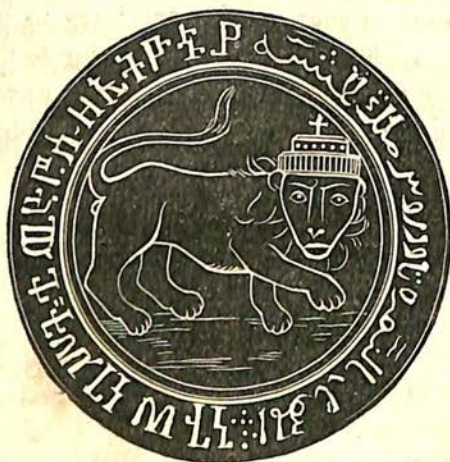
Second Letter from the Emperor Theodore to Dr. Beke.

Written at Zagye, in the 7358th year since the Creation of the World, and the 1858th year since the Birth of Christ.