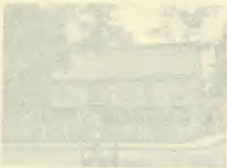
THE OLD WITCH HOUSE, SALEM, IN 1839.