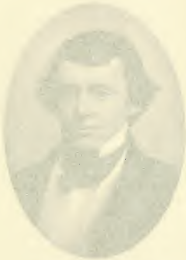
JOSEPH HODGES CHOATE AT THE AGE OF TWENTY.

This picture was taken with his class at graduation in 1852. The original daguerreotype is in the Harvard Library at Cambridge.