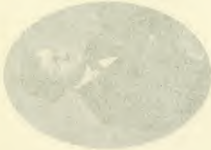
JOSEPH HODGES CHOATE.