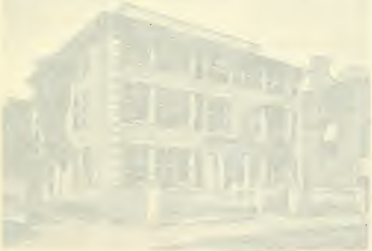
HODGES HOUSE ON ESSEX STREET, SALEM.