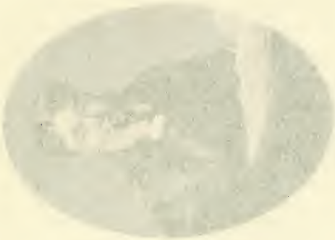
CAROLINE STERLING CHOATE.

These photographs were taken in 1863—two years after their marriage, October 16, 1861. Their married life lasted over fifty-five years.