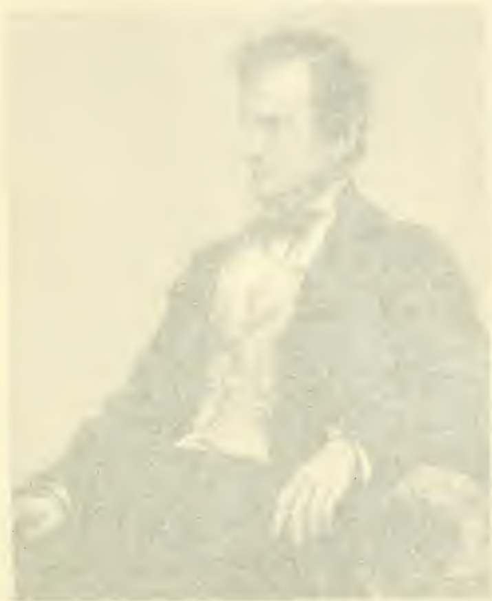
WILLIAM M. EVARTS.