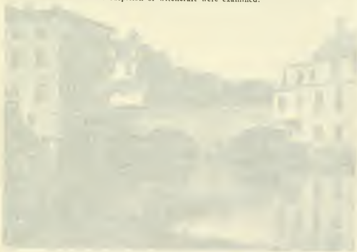
THE CHOATE BRIDGE—IPSWICH, MASSACHUSETTS.