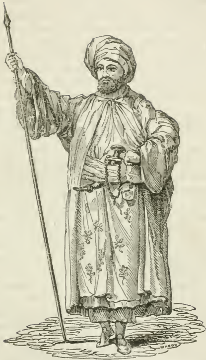
An Arab of Rank in the Costume of Yemen.