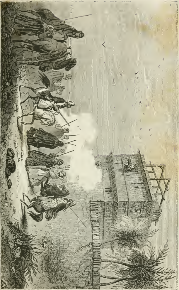
Convent of El Bourg near Tof.