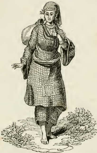
A Young Female of the Coffee Mountains.