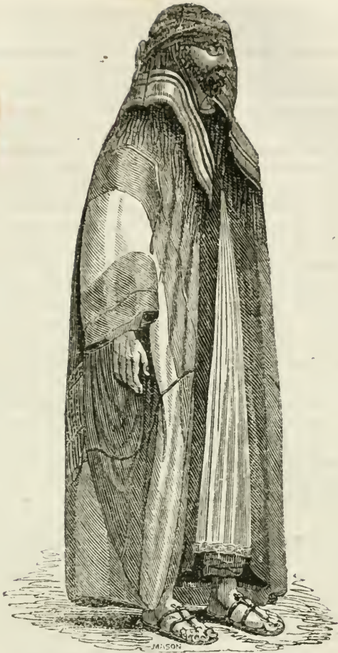
Abdallah bin Saud, Chief of the Wahabees.