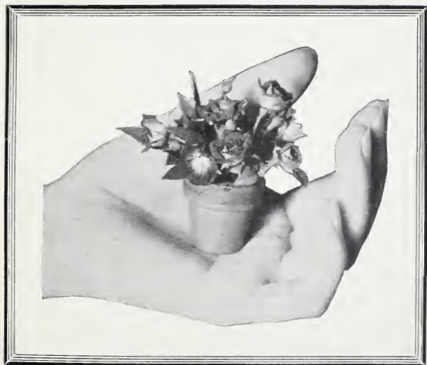
TOM THUMB, SMALLEST RED ROSE IN WORLD Introduced in America by The Conard-Pyle Co.