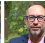
Jimmy Wales Trustee