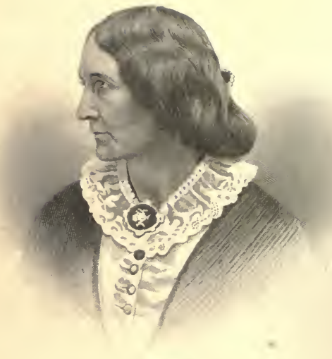
IA S We as D