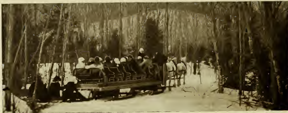
ON THE WAY TO THE PICNIC

AFTER THE WINTER EXAMINATIONS THE SENIORS GO WITH THE PRINCIPAL FOR A FEW DAYS OF WINTER SPORTS IN THE WHITE MOUNTAINS, AT INTERVALE, NEW HAMPSHIRE