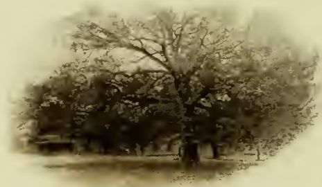
THE OLD OAK