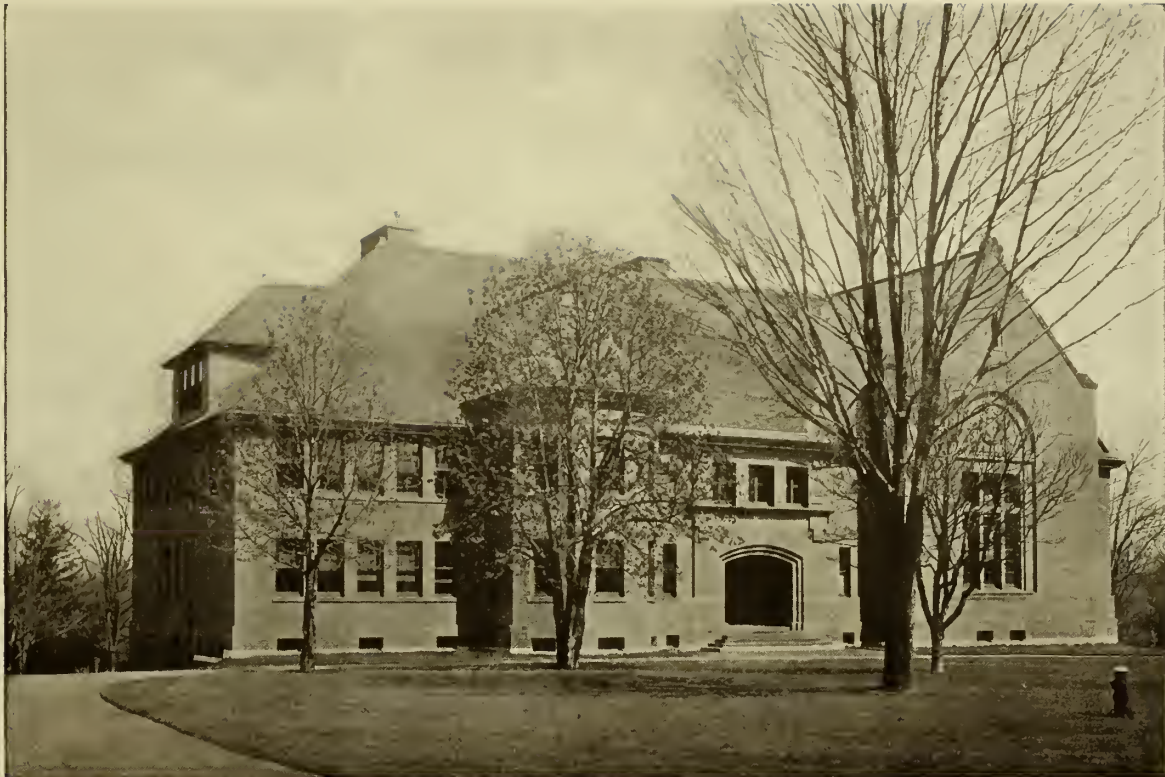
McKeen Memorial Hall