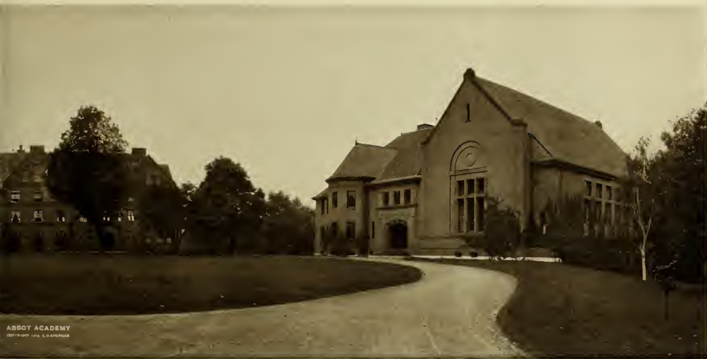
ABBOT ACADEMY