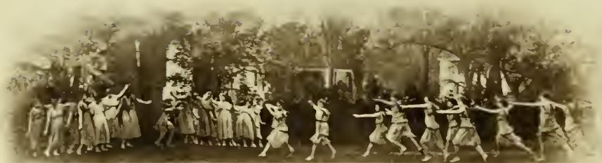
THE PAGEANT OF THE OPEN FIELDS

THERE ARE OPPORTUNITIES FOR CHARMING OUTDOOR PAGEANTS