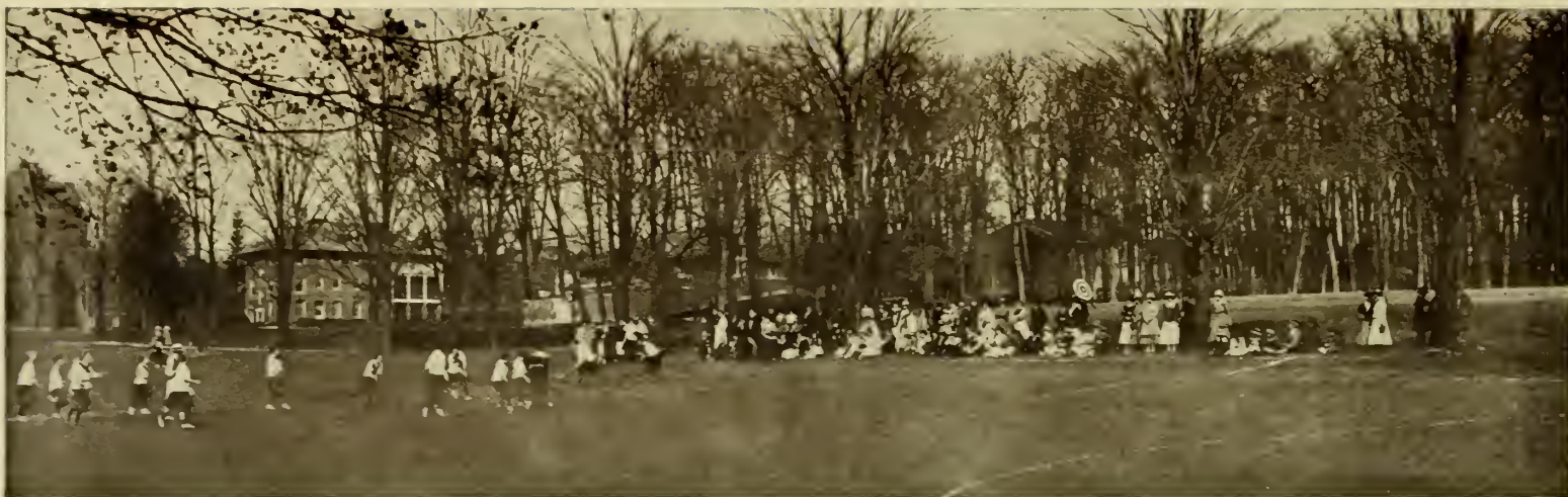
THE HOCKEY GAME

ON FIELD DAY, THE EVENTS INCLUDE HORSEBACK RIDING, HOCKEY AND OTHER SPORTS