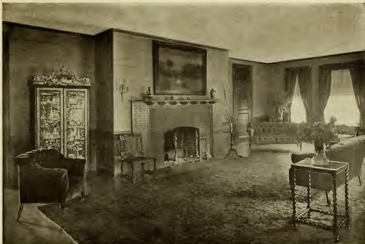
The Drawing Room