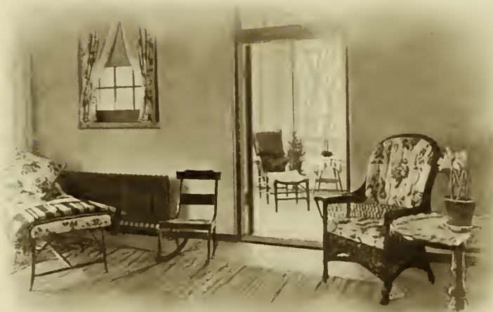
INFIRMARY LIVING ROOM, LOOKING TOWARD SUN PARLOR

CONTAINS BEDROOMS AND BATHS, DIET KITCHENS, LIVING ROOM AND SUN PARLOR