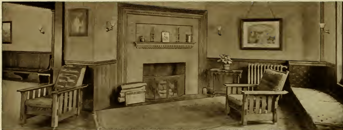
FIREPLACE IN THE RECREATION ROOM

THE STUDENTS HAVE ATTRACTIVE ROOMS FOR STUDY AND RECREATION