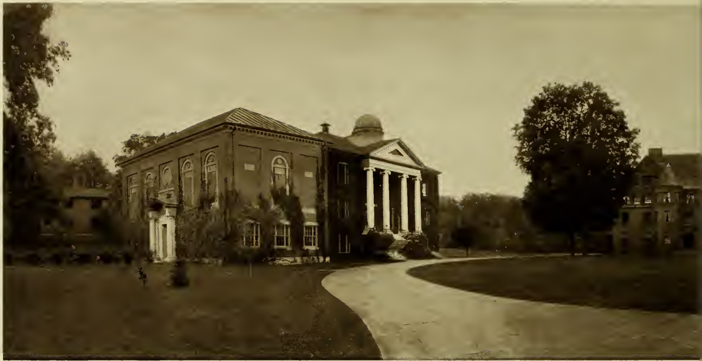
JOHN ESTHER ART GALLERY ABBOT HALL