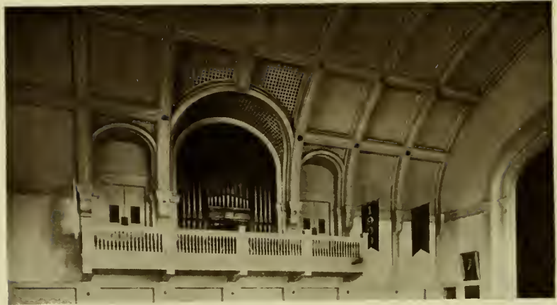
THE DOROTHY DAVIS SIMPSON ORGAN DAVIS HALL