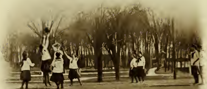
A BASKET BALL GAME

THE SPACIOUS GROUNDS AFFORD ATTRACTIVE OPPORTUNITIES FOR OUTDOOR SPORTS