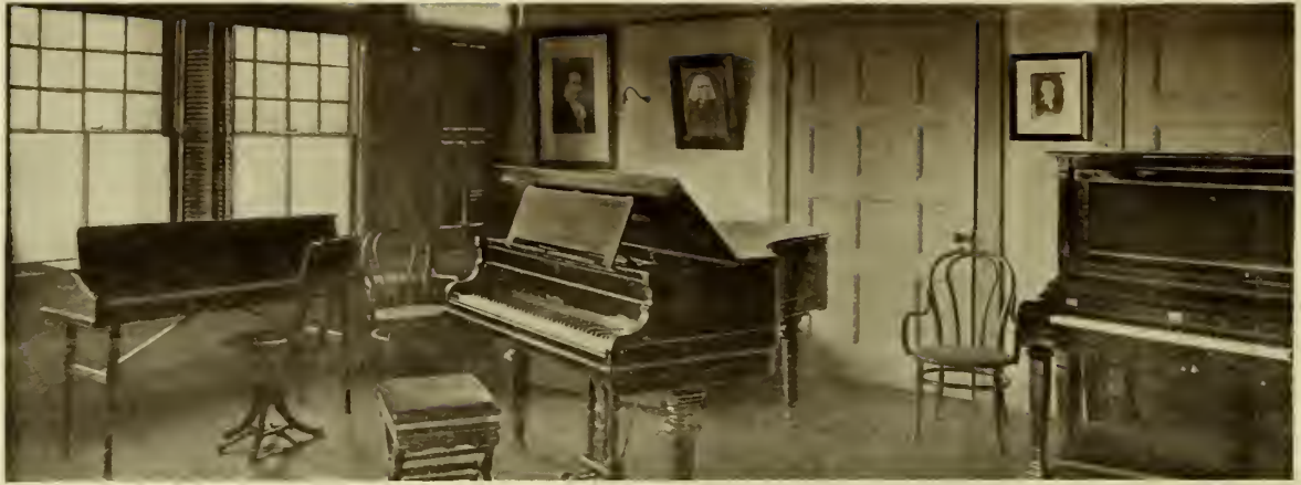
THE MUSIC STUDIO