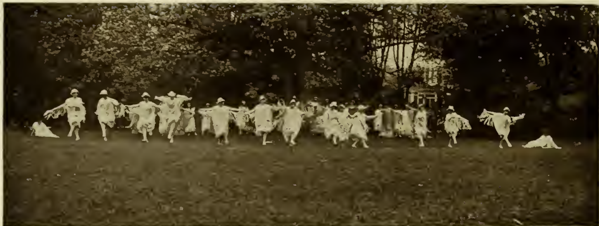
THE MASQUE OF THE FLOWERS

THERE ARE OPPORTUNITIES FOR CHARMING OUTDOOR PAGEANTS