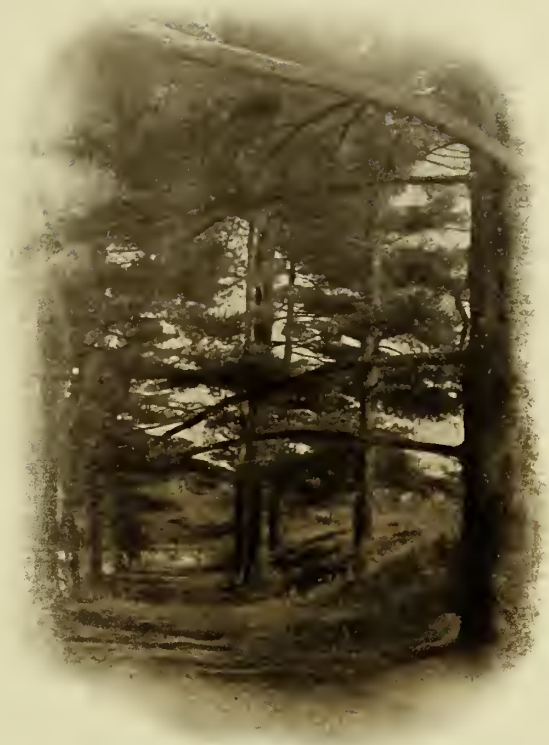
THE OLD RAILROAD TRACK