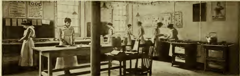
HOUSEHOLD SCIENCE LABORATORY

CONTAINS THE ASSEMBLY HALL, AND LABORATORIES FOR PHYSICS, CHEMISTRY, BIOLOGY AND HOUSEHOLD SCIENCE