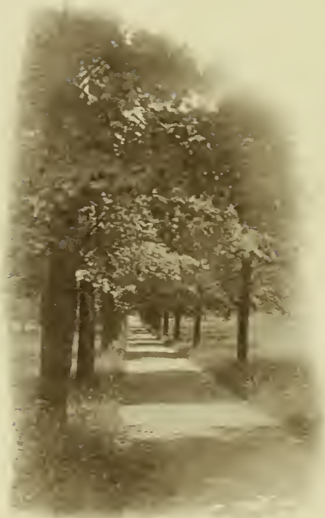
THE MAPLE WALK

FROM THE READING ROOM WINDOWS MAY BE SEEN THE MAPLE WALK, AND SHERMAN COTTAGE, ONE OF THE SMALLER RESIDENCE HALLS