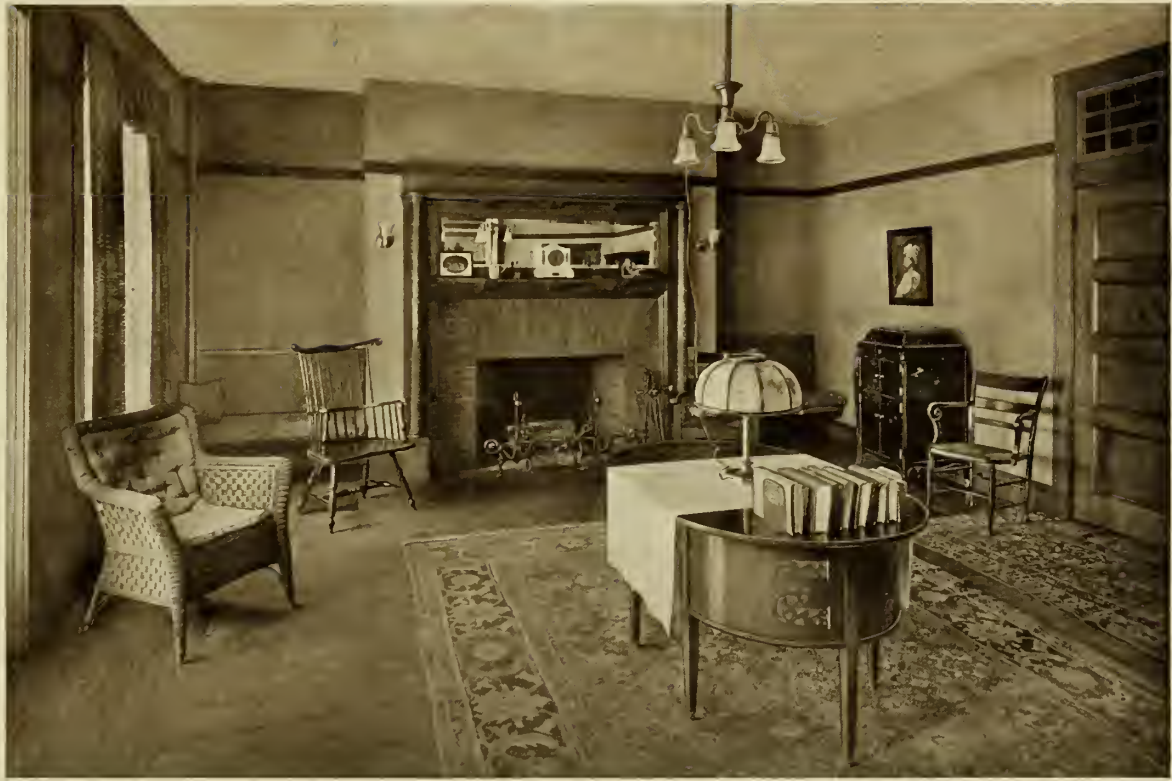
The Senior Parlor