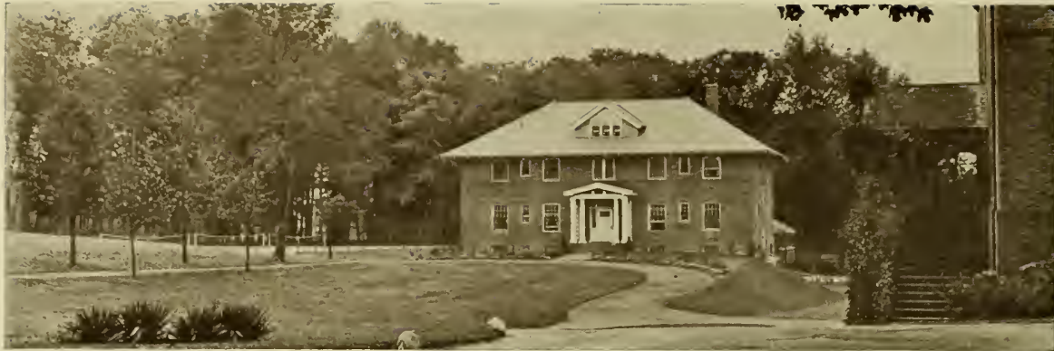
THE ANTOINETTE HALL TAYLOR INFIRMARY