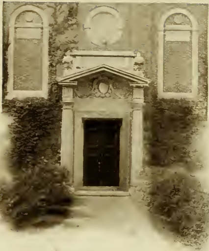
ENTRANCE TO ART GALLERY