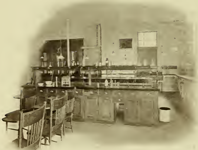
THE CHEMISTRY LABORATORY

ALL LABORATORIES ARE COMPLETELY AND GENEROUSLY EQUIPPED