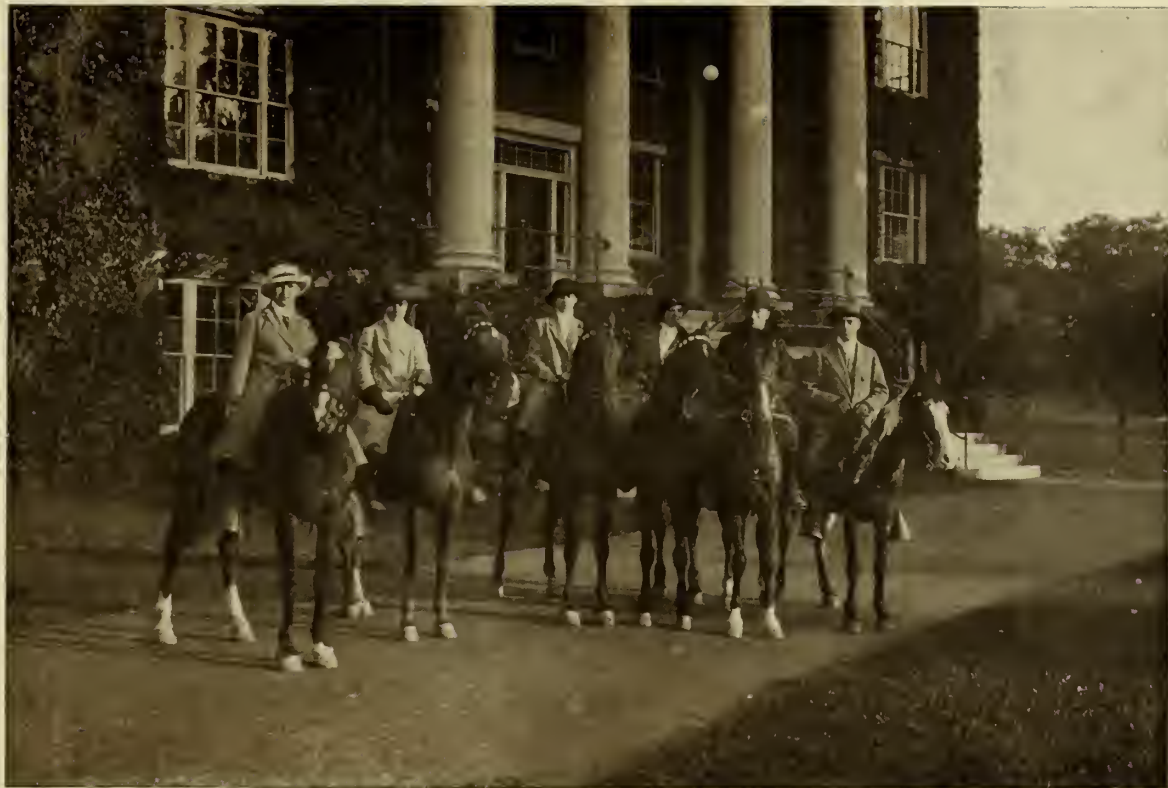
A Riding Party