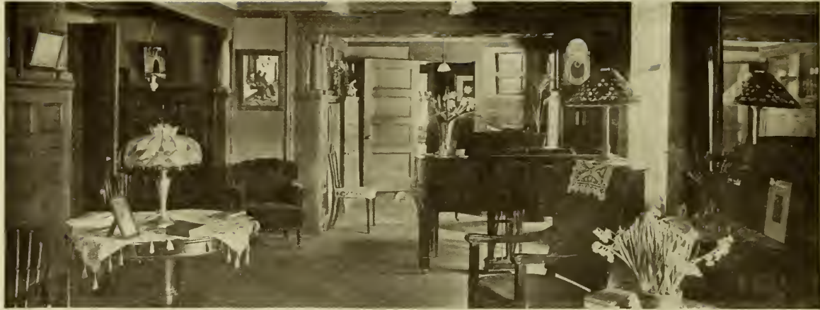
THE MCKEEN SITTING ROOM