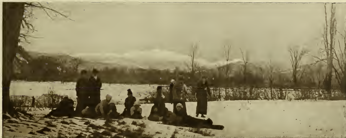
Some of the Seniors at Intervale