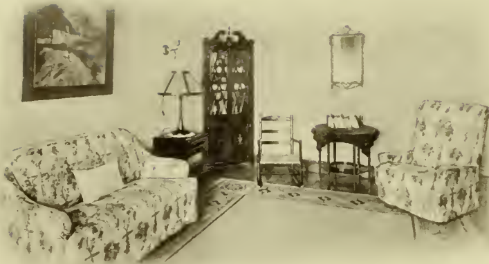
A CORNER OF THE FACULTY PARLOR

THE SCHOOL HOME, ARE THE PRINCIPAL RECEPTION ROOMS AND PARLORS