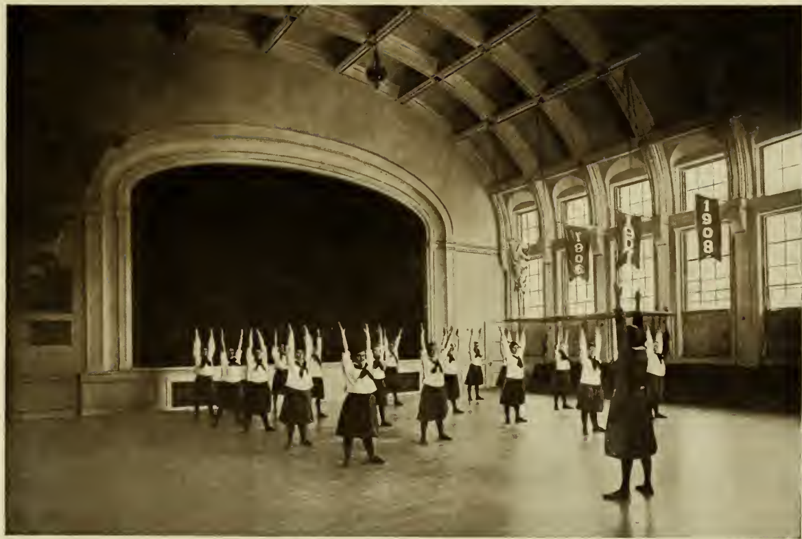
Gymnastic Class in Davis Hall