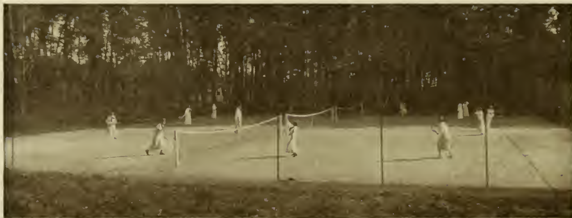
ON THE TENNIS COURTS

THE SPACIOUS GROUNDS AFFORD ATTRACTIVE OPPORTUNITIES FOR OUTDOOR SPORTS