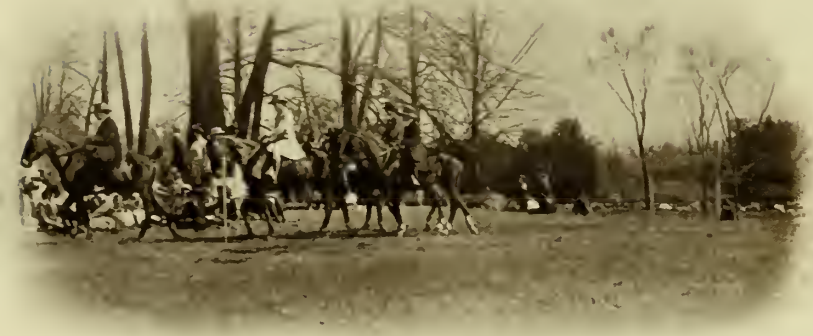
THE HORSEBACK RIDERS

ON FIELD DAY, THE EVENTS INCLUDE HORSEBACK RIDING, HOCKEY AND OTHER SPORTS