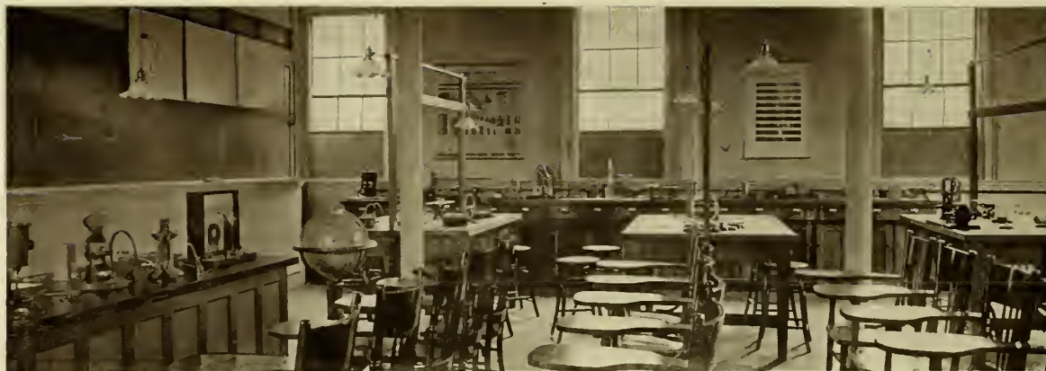
THE PHYSICS LABORATORY

ALL LABORATORIES ARE COMPLETELY AND GENEROUSLY EQUIPPED