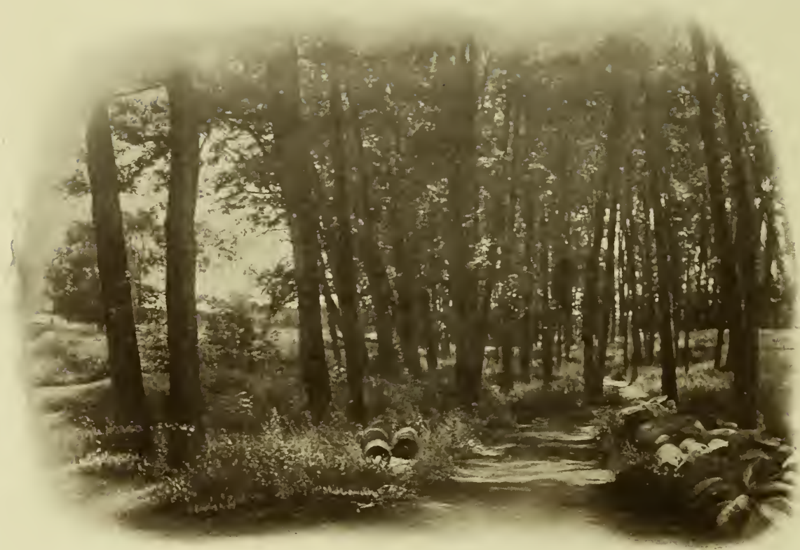
The Edge of the Grove