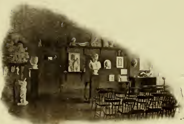
CORNER OF ART STUDIO

ARE LOCATED THE LIBRARY AND READING ROOMS AND THE ART AND MUSIC STUDIOS