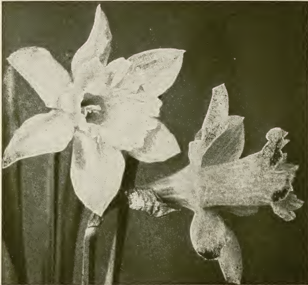
Single Large Trumpet Varieties (Daffodils)

No garden is complete without a liberal planting of Daffodils or Narcissus. Perfectly hardy, they grow and produce abundantly in almost any position, sun or shade, moist or dry. They are equally suited to pot culture for winter flowering and are unsurpassed for Naturalizing.