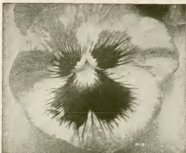
Roggli Giant Pansies

PRICES (unless otherwise priced) all plants are sold at 25 cts. each; $2.50 per dozen. Three plants of one variety at the dozen rate.