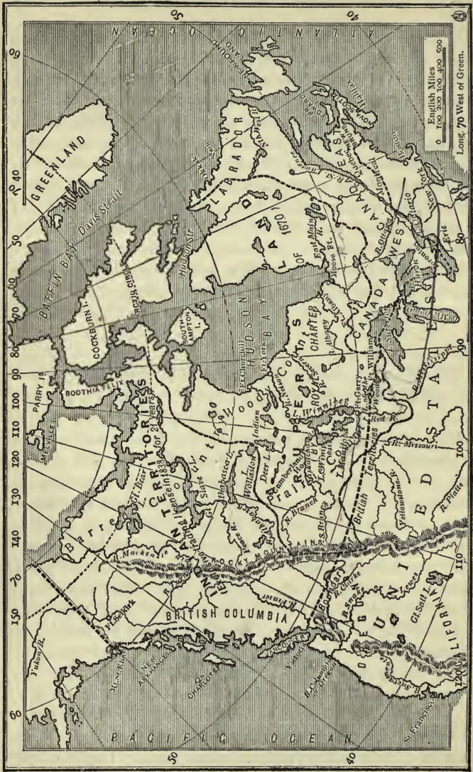
MAP OF BRITISH AMERICA TO ILLUSTRATE THE CHARTER OF THE HUDSON'S BAY COMPANY.