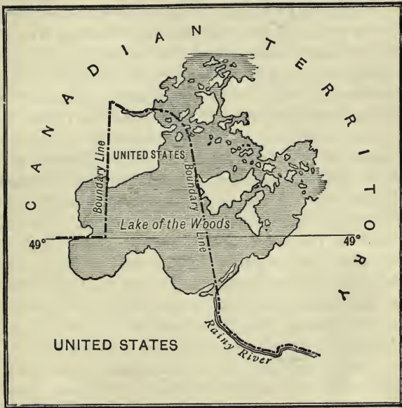
INTERNATIONAL BOUNDARY AS FINALLY ESTABLISHED IN 1842 AT LAKE OF THE WOODS.

west was only rectified in 1842, when Lord Ashburton settled the difficulty by conceding to the United States an invaluable corner of British territory in the east (see below, p. 299).