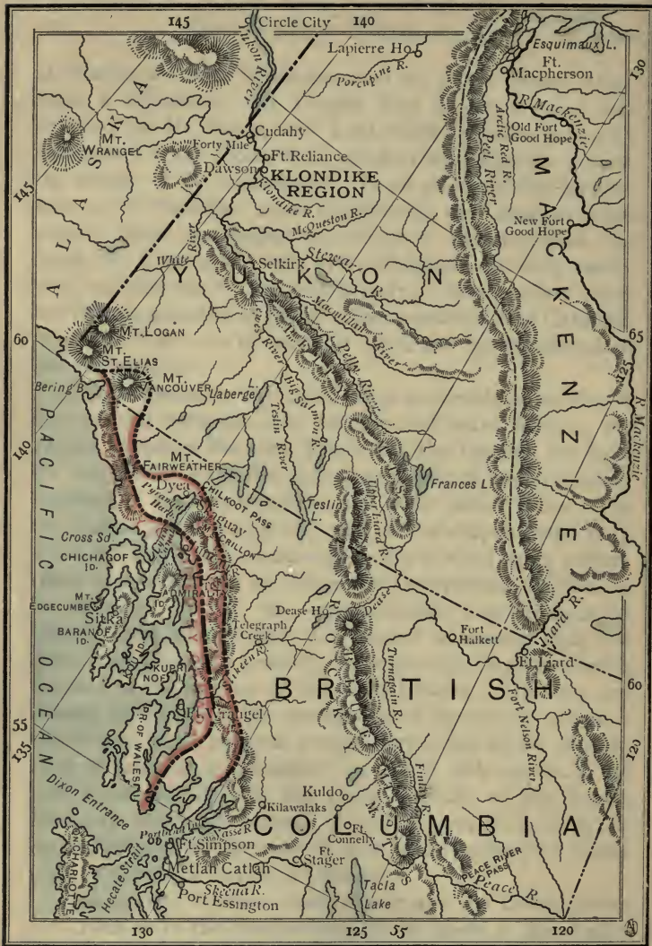
MAP OF BRITISH COLUMBIA AND YUKON DISTRICT SHOWING DISPUTED BOUNDARY BETWEEN CANADA AND THE UNITED STATES.