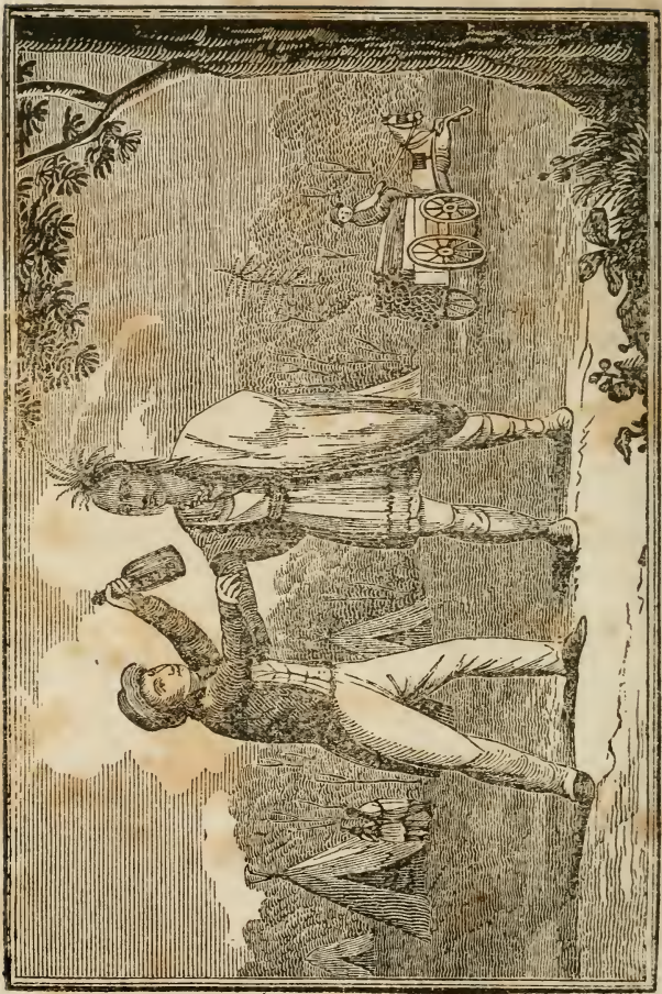
MANNER OF INSTRUCTING THE INDIANS.