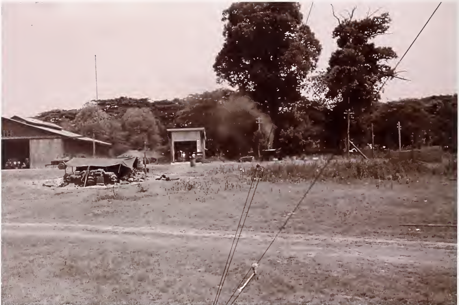
The communications center was established in a permanent structure outside of the main camp. The wires in the foreground held up a pole that provided elevation to the radio's antenna.

To satisfy the first requirement, MABS-16 deployed with 44 EE-8 battery-powered field telephones, one SB-86 switchboard, and one SB-22 switchboard. As with the field phones, both switchboards were "field equipment" and were battery operated. Internal communications were quickly established throughout the initial base camp, with additional lines being run as additional tents were erected and occupied. Concurrent with the construction of the more permanent cantonment, plans were developed to provide it with telephone service. As soon as the second of the three preexisting buildings was rehabilitated by the engineers, the SB-86 switchboard was installed alongside of the MABS-16 offices, the sick bay, motor transport, and material offices. Lines were quickly run to all offices and other work spaces, the flight line, and some of the billeting tents, and internal communications