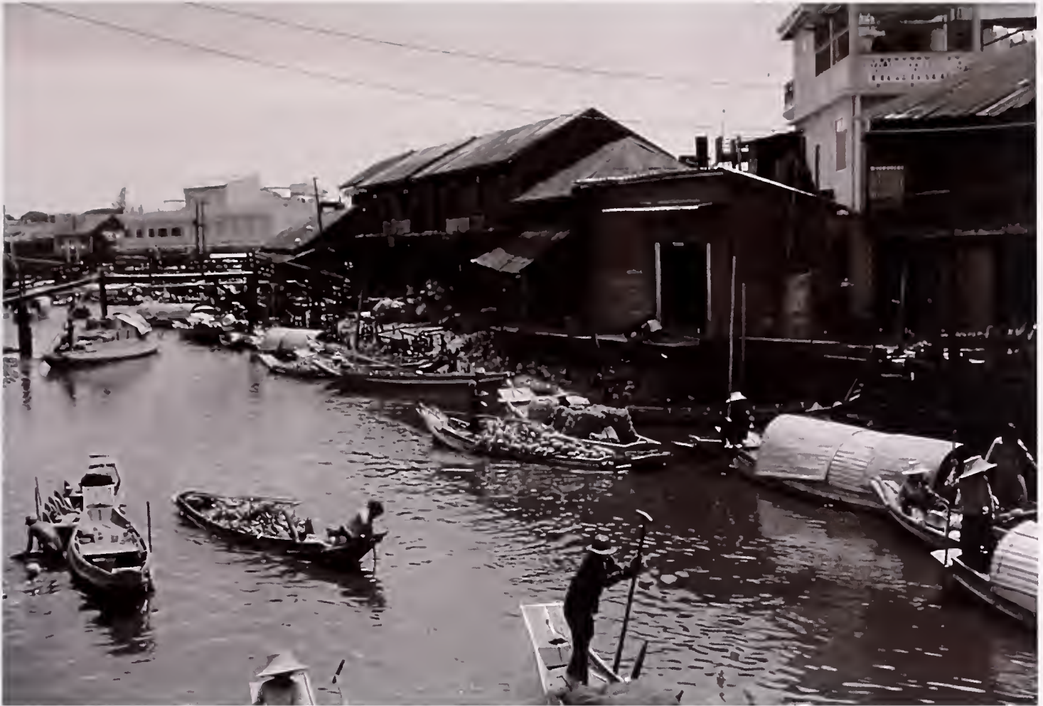
"Klongs" (canals) run throughout the city of Bangkok. They carry off the monsoon rains and provide a watercourse for farmers to bring their vegetables and fruits from the countryside to sell to the city dwellers in "floating markets," located throughout the city.

They were awarded a large silver trophy, which was suitably engraved and as of this writing resides in the MAG-16 trophy case.