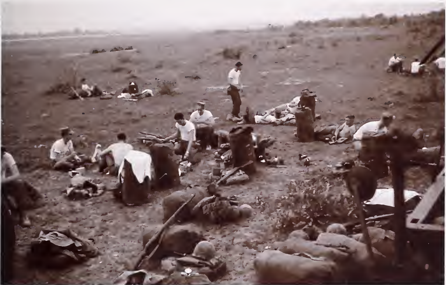
The first Marines to arrive were greeted with bare ground. As soon as tentage arrived, the Marines put up their own billeting and work spaces.