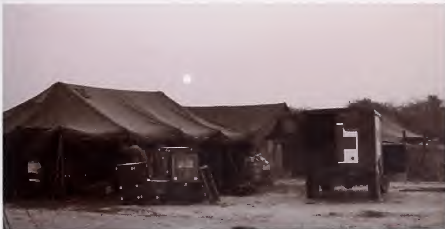
In the initial camp, all tents – including the Squadron Aid Station pictured – were pitched on the ground.

Establishment of the camp began immediately upon Marine arrival and proceeded in two phases. Phase I dealt with the initial, temporary camp. An area was selected and marked off and as tentage arrived, the tents were put up in predesignated areas. First priority was given to billeting. Once living areas had been established, the mess hall, sick bay, and office tents were put up. In approximately