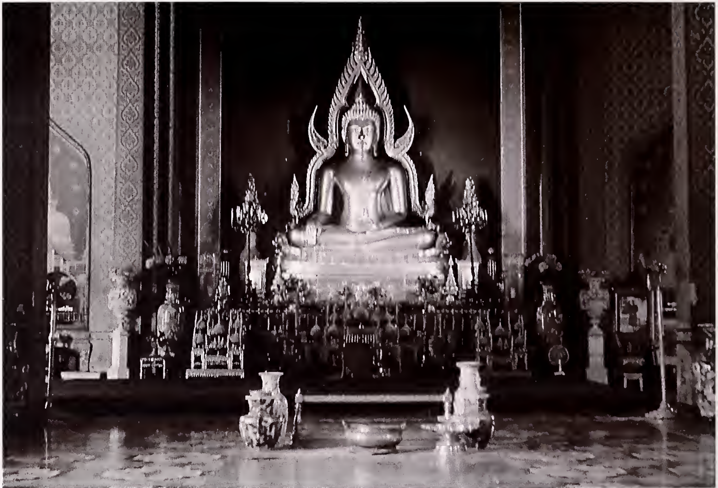
This statue of a sitting Buddha greeted visitors as they entered the Marble Palace in Bangkok. The floors were made of highly polished marble imported from Italy.

business. Meals and drinks were similarly inexpensive. A good steak or lobster dinner at any of the many excellent restaurants cost between $1.50 and $2.00. Drinks were about $1.00 apiece. Cab drivers doubled as tour guides and for a very reasonable price would take Marines on tours of the city that included stops at several of the many beautiful Thai temples. For Marines who had saved some of their money, any of the many jewelry stores would make rings and other items in 24 hours. Black star sapphires were a favorite and were within the financial reach of nearly every Marine who wanted one. In 1961 the cost of two days in Bangkok was not beyond the reach of even the most junior enlisted Marine, and many took advantage of the opportunity to see one of Southeast Asia's most beautiful and modern cities.