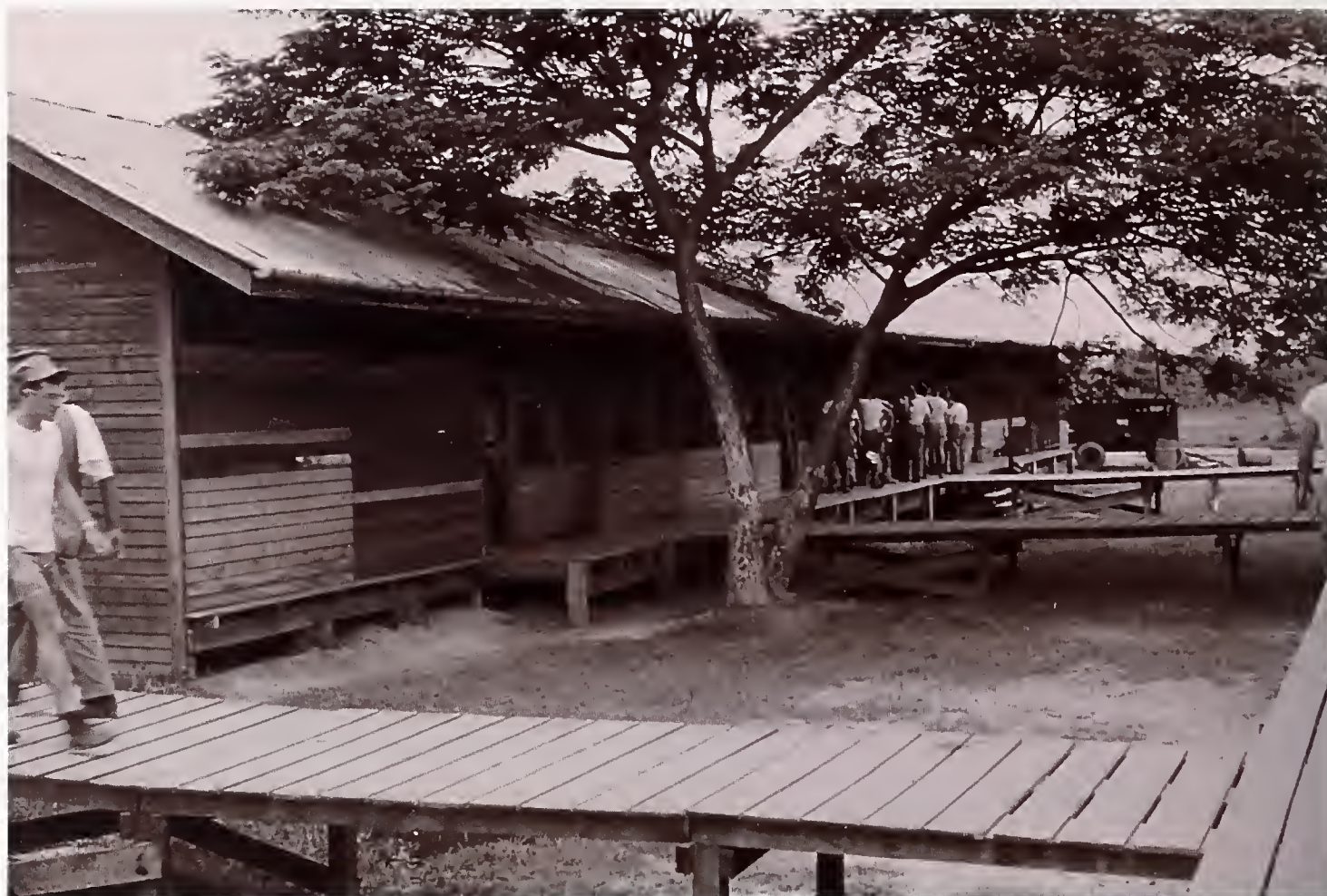
The squadron mess hall was located in one of the existing structures that had been rehabilitated by the engineers. Notice that it was built up off of the ground to prevent flooding during the monsoon season.

Phase II involved construction of a second camp that, while still expeditionary in nature, was more suited to protect the Marines from the monsoon rains would soon be upon them. Construction of this camp took about 11 weeks to complete. The work was done by the engineer platoon with 1 officer and 21 enlisted Marines, augmented by 21 additional carpenters from the 1st Marine Aircraft Wing. Plans were drawn up to build the camp above ground, as it was anticipated that the entire area would be under water when the monsoon season began in the early summer. An area of approximately eight acres, which was relatively flat and free of vegetation and also in close proximity to the airfield, was selected as the site for the camp.