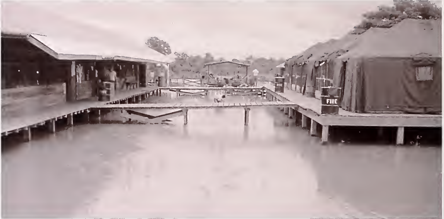
During the monsoon rains, the ground below the elevated cantonment was frequently flooded. The rehabilitated original building on the left housed the squadron's administration offices. On the right are strong back billeting tents.

and bath unit were placed on the other. The final platform measured 48 feet by 40 feet and was built to accommodate two corrugated roofed buildings of 20 feet by 22 feet. Inside of each of these buildings, a strong-backed command post tent was erected. These two buildings were joined together and served as the squadron's command center.