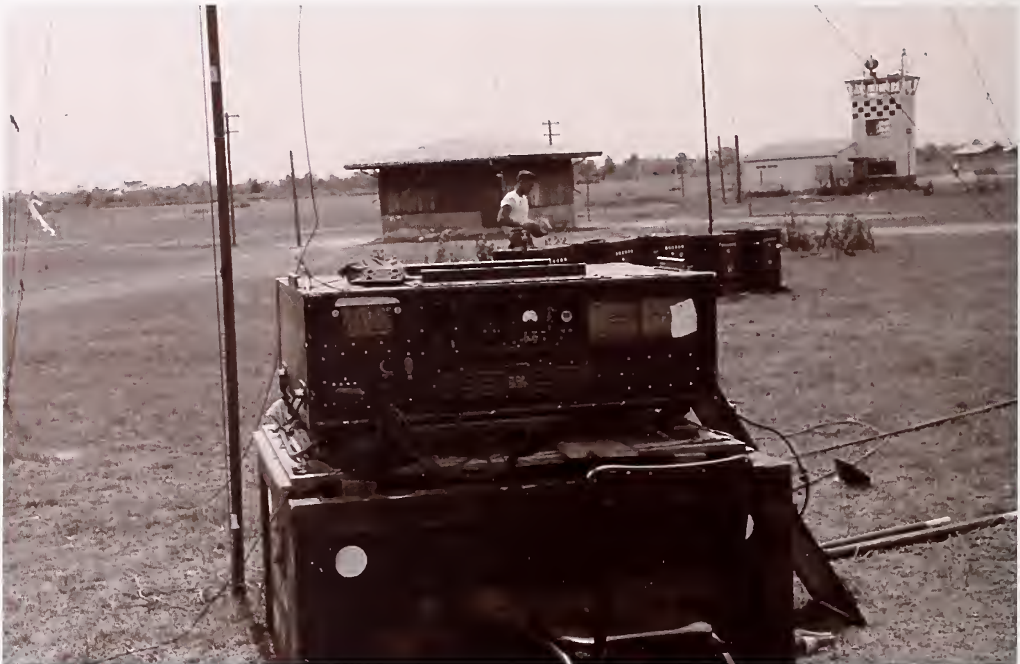
An AN/TRC-75 transmitter-receiver was set up outside of the communications center. The poles in the background supported the long-wire antennas that attached to the radio.

High temperatures, poor signals, and mediocre antennas plagued communications on the Udorn-Bangkok circuit, and teletype incompatibility frustrated communications on the Udorn-NavComPacPhil circuit in the early days of the deployment. Signals improved markedly on the Udorn-Bangkok circuit after much experimentation with long-wire antennas cut specifically to frequency length, which were employed at Udorn, and the installation of a 35-foot fiberglass antenna to the AN/TRC-75 on the Bangkok end of the circuit. The teletype incompatibility problem on the Udorn-NavComPacPhil circuit was quickly resolved. With minor exceptions, both circuits enjoyed "five by five" communications for the duration of the deployment.