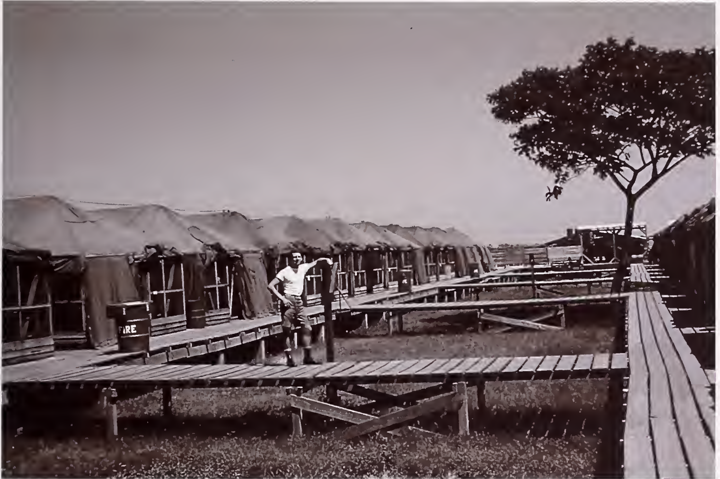
Strong back tents were erected in the permanent camp, which was built entirely off the ground to protect it from flooding during the monsoon season. The author is pictured in the authorized "uniform of the day," cutoff utilities, combat boots – rubber boots were substituted during the monsoon season – and tee shirts.

extending the existing decks and enclosing them. The second building was rehabilitated and turned into office space. It housed the sick bay, post office, exchange, squadron office, communications switchboard, and the motor transport office. A dry stores warehouse was also located in this building. The third building was given to Air America for its office spaces.