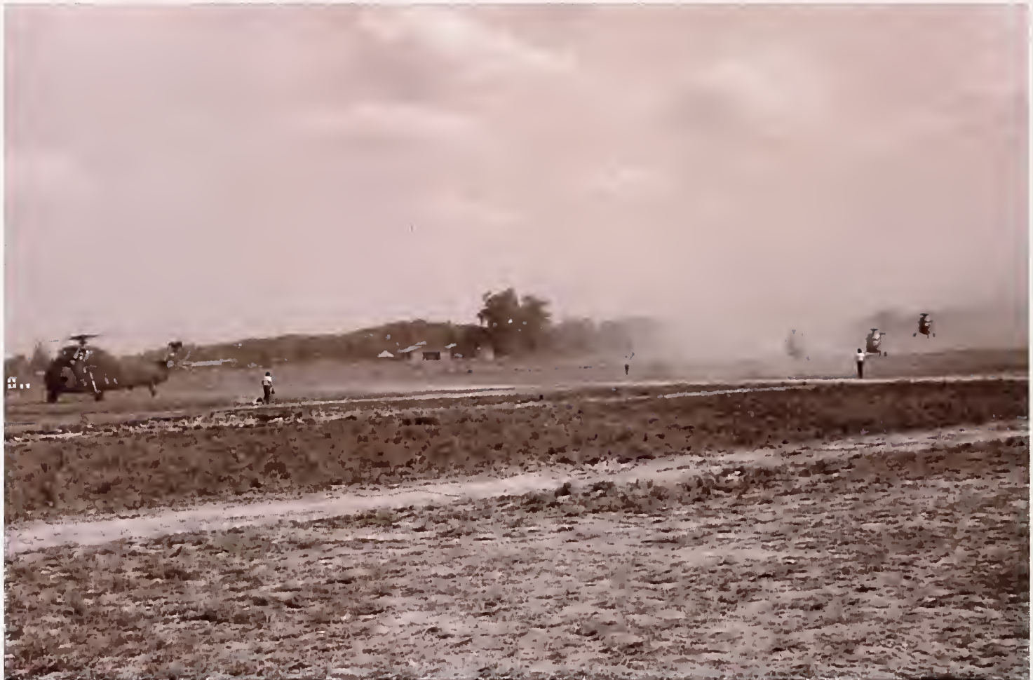
Air America helicopters returning from a mission in Laos. Notice that there are no markings on the helicopters.

Flight operations totaled 1,934.5 flight hours, for an average of 106.5 hours of flying time per helicopter. In May, they averaged an aircraft availability of 18.6 HUS-1s, which flew for a total of 1,750 hours.