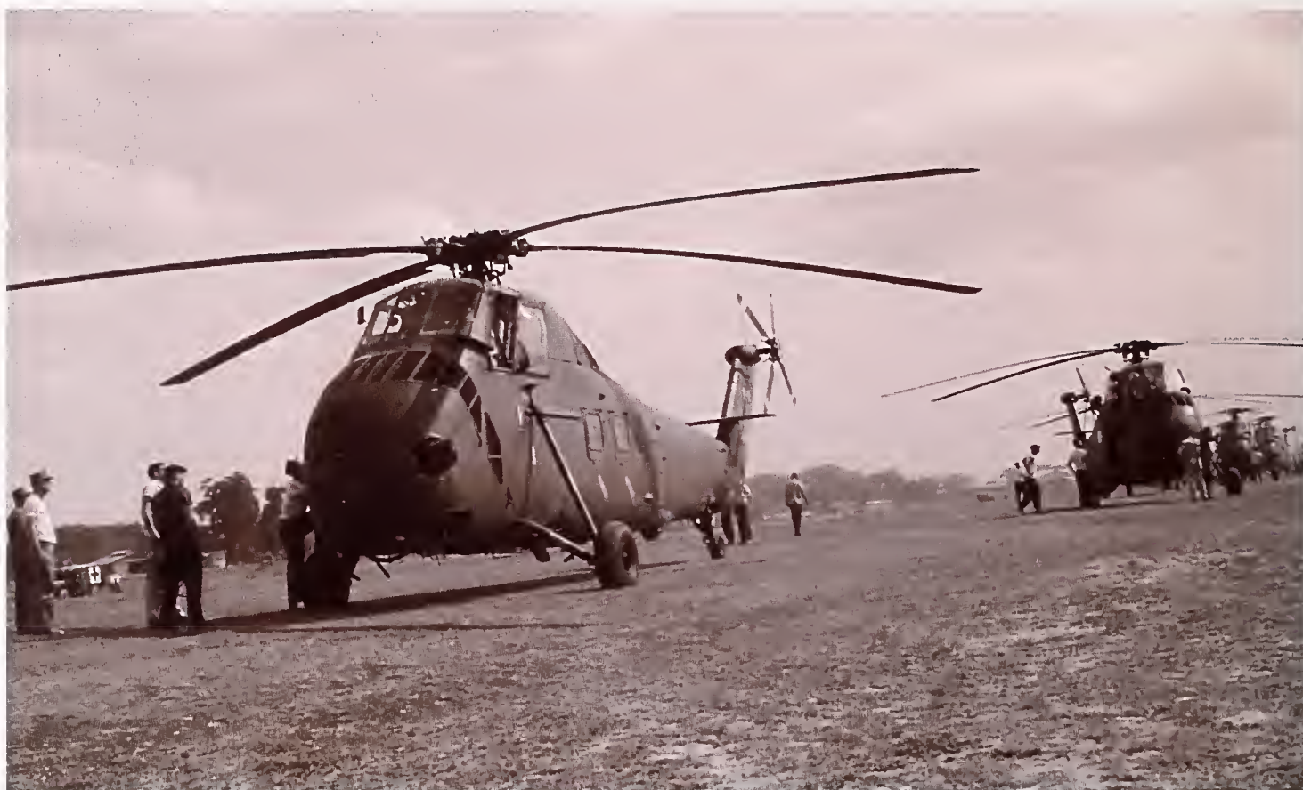
Air America's helicopters as they arrived for duty. Underneath the light coat of green paint, a large white star and the word "Marines" were clearly visible.

Of the 16 additional aircraft made available (to bring Air America up to its 20 authorized aircraft), 13 flew into the Udorn airfield on 27 March. 13 Although efforts had been made to “sanitize” the aircraft, when the sun struck the fuselage of the arriving HUS-1s, a large white star and the word “Marines” were clearly visible under the light coat of green paint that had been applied to each helicopter. 14 With the arrival of the final three helicopters a few days later, and the repair of the three that had been provided the pervious December, Air America had 19 operational aircraft. The loss of a second aircraft a short time later left Air America with 18 assigned as April approached.