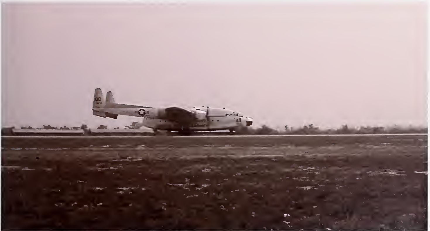
Marine aircraft visited the squadron at least twice weekly bringing mail, repair parts, and other needed supplies.

The morale of the squadron's Marines was excellent throughout the deployment. It was sustained in part by the knowledge that the Marines were deployed on an actual operational mission. Superb mail service throughout the deployment also contributed to the high morale. The MABS-16 fleet post office address did not change, so mail was never interrupted. Mail was delivered at least