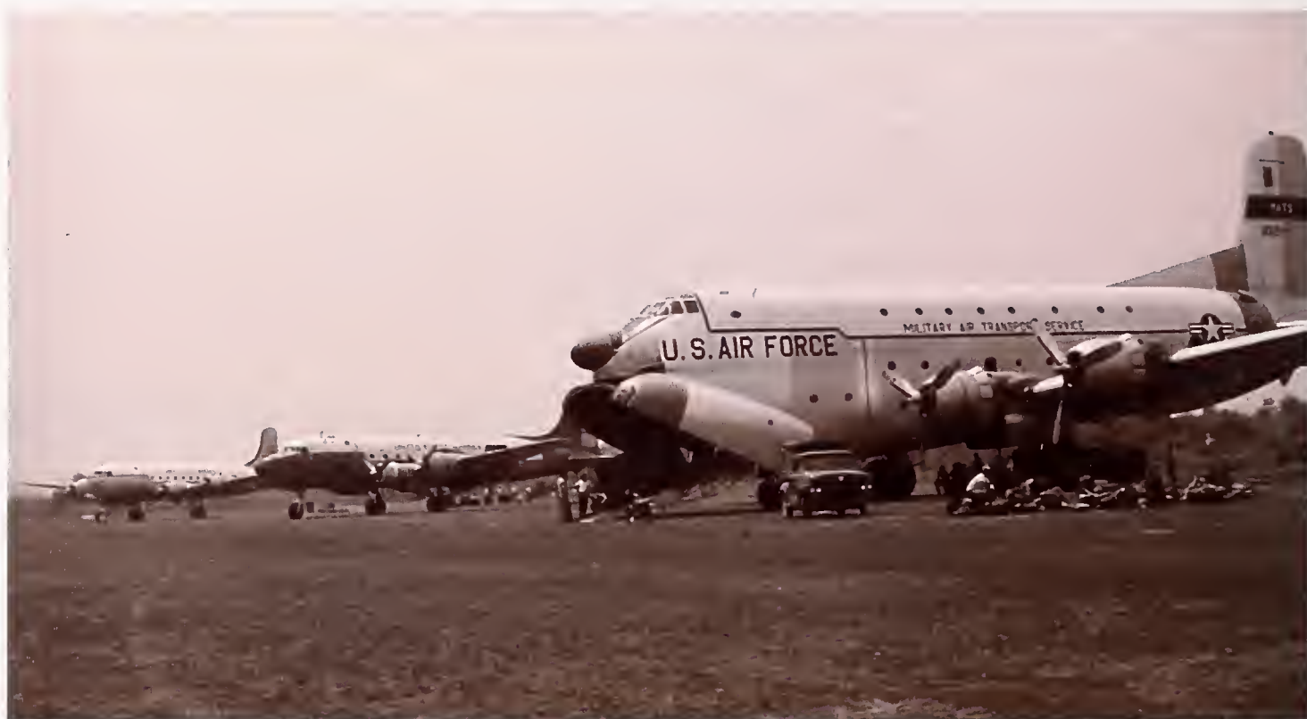
Air Force transport planes from the Military Air Transport Command brought many of the Marines and their equipment to the airfield at Udorn, Thailand.

The execute order for Operation Millpond was received on 19 March 1961. It directed movement to begin on 22 March, with the airlift phase to be completed in four days. MABS-16 was directed to be prepared to receive helicopters at the Udorn airfield on 27 March and to begin supporting helicopter operations immediately thereafter. Nine aircraft (five C-130s and four C-124s) carrying the most urgently needed members of the deploying force were scheduled to depart Okinawa on the evening of 22 March and arrive at Udorn, with intermediate stops at Clark Air Force Base in the Philippines and Bangkok, on 23 March. Both organic 1st Marine Aircraft Wing and U.S. Air Force (315th Air Division) aircraft participated in this airlift. Due to mechanical problems, only seven of these aircraft made it to Udorn on 23 March.