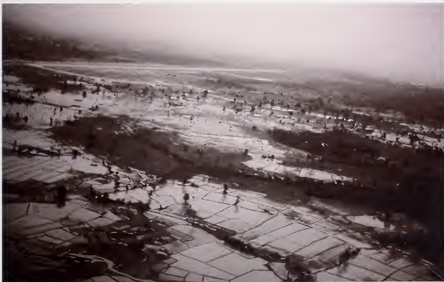
The monsoon season brings considerable amounts of rain to northeast Thailand. The airfield is at the top of the picture. The initial, temporary camp was located to the right of the airfield.

Air America pilots had already been flying missions in Laos. Operating under the control of the Program Evaluation Office, they had been flying four HUS-1s in Laos since December 1960. One had been lost to enemy fire, and all of the others