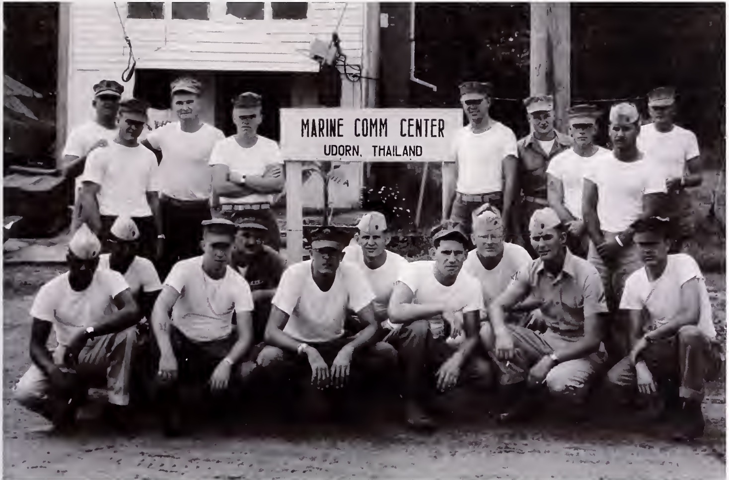
The message center Marines and technicians who ran and maintained the MABS-16 communications center, which is in the rear of the photograph. (The author is third from the right in the front row.)

were established. This system served MABS-16 internal communications needs until the squadron departed in late October. Prior to passing the telephone exchange to Air America in October, the Marines made several upgrades to the system. Improvements included replacing the military "slash wire" that connected each telephone to the main switchboard with WD-110 wire, running all lines overhead, converting to a central battery system, and substituting Air America's desk phones for the Marines's military EE-8s.