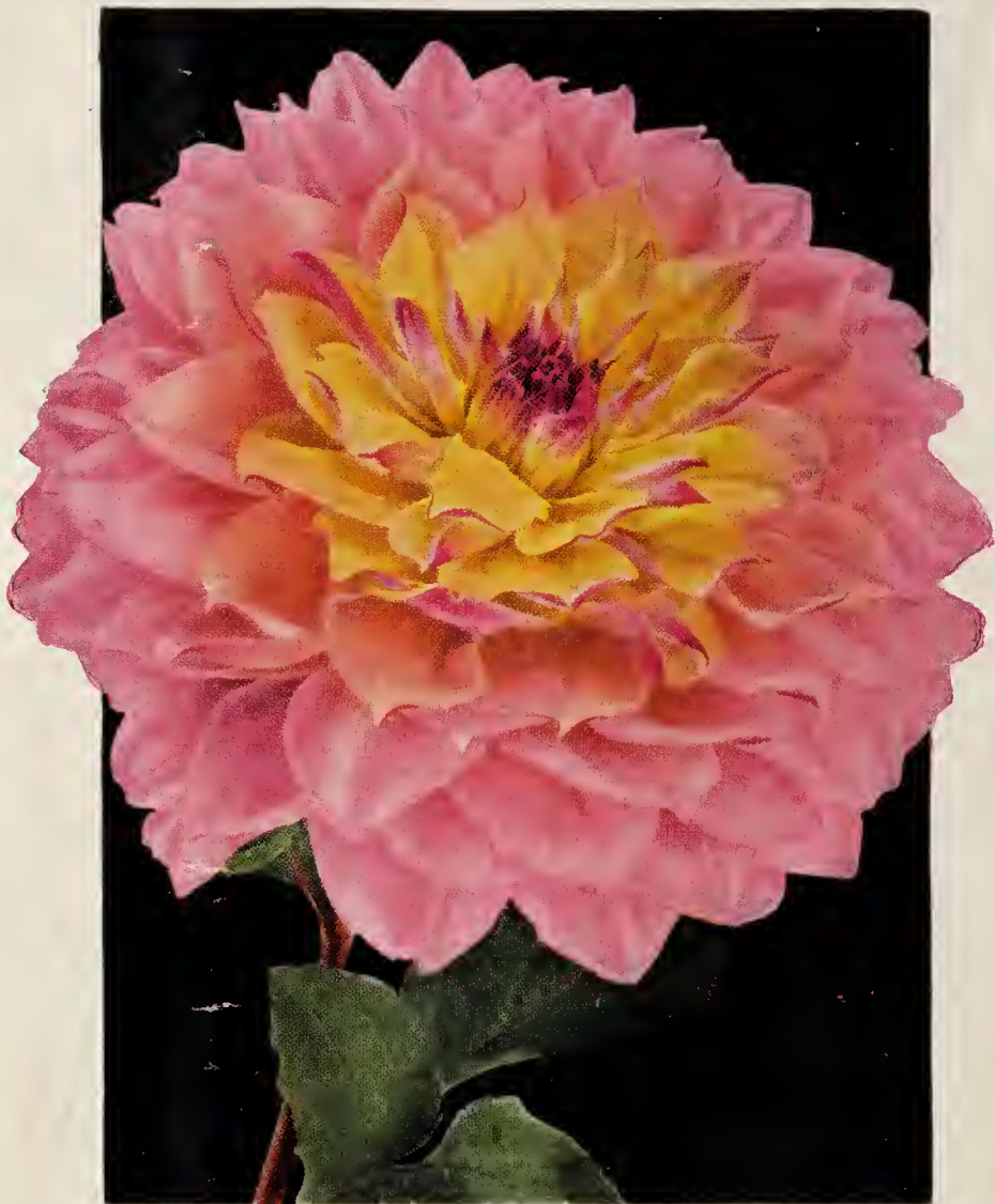
ELIZABETH POTTER. \frac{1}{2} natural size A New Gold Medal Dahlia