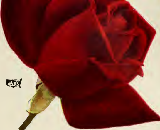
MIRANDY. Plant Pat. 632 $1.50 each; 3 for $3.75

White Briarcliff. HT. Plant Pat. 108. Well shaped, pure white, fragrant. $1.35 each; 3 for $3.40.