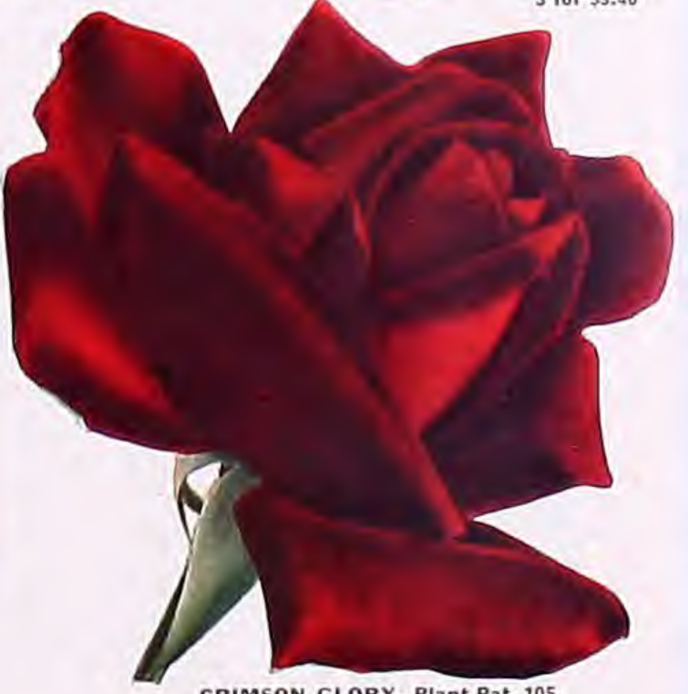
CRIMSON GLORY. Plant Pat. 105 $1.35 each; 3 for $3.40