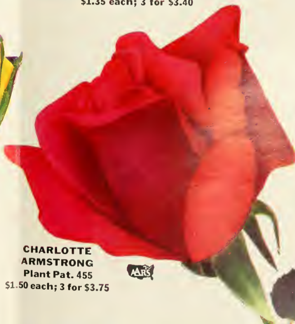
CHARLOTTE ARMSTRONG Plant Pat. 455 $1.50 each; 3 for $3.75