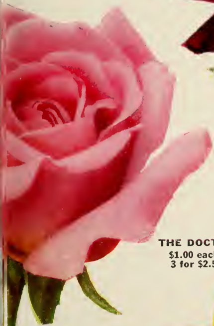
THE DOCTOR $1.00 each; 3 for $2.50

Three plants of a variety will fur- nish harmonious and pleasing bouquets.