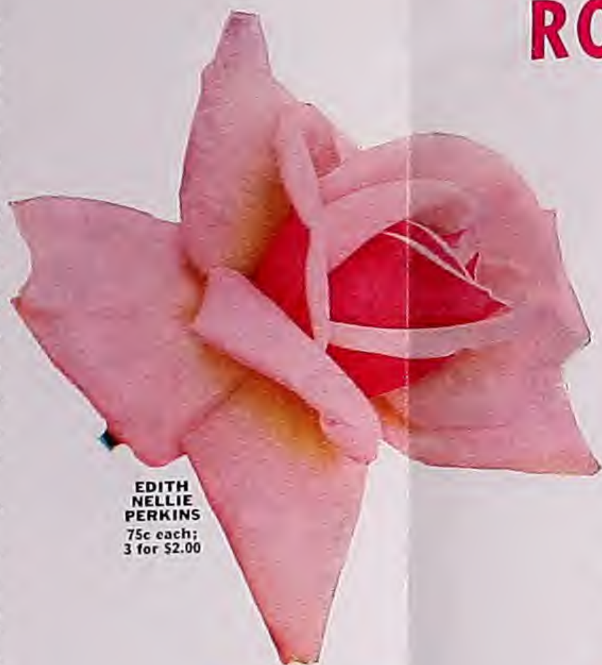
EDITH NELLIE PERKINS 75c each; 3 for $2.00