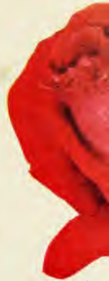
MARY MARGARET MCBRIDE. Plant Pat. 537 $1.50 each; 3 for $3.75