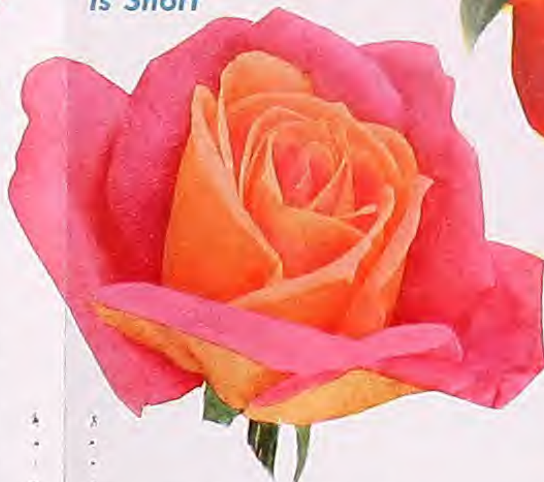
PRES. HERBERT HOOVER 75c each; 3 for $2.00