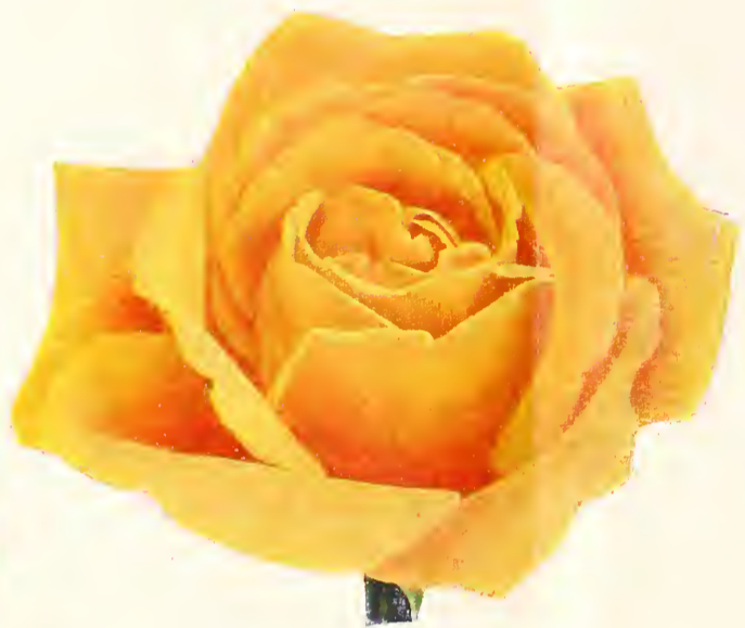
GOLDEN DAWN 75c each; 3 for $2.00

or nearly half a century this bud is cream-white, but the a tint of lemon at the center. rge, double blooms of snowy and double, high centered, liage large, dark, leathery. flower very large, fragrant, l Tea Rose and justly world hesse de Luxembourg). d best of the deep yellow or able for the South. t-grade 2-yr. plants, 75c 0 for 10; $60.00 per 100