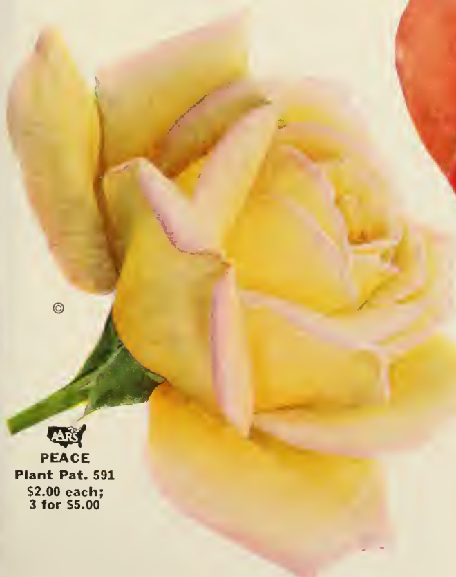
PEACE Plant Pat. 591 $2.00 each; 3 for $5.00

Since May 23, 1930, famous Rose growers who spend their lives producing new and beautiful varieties have been able to enjoy a small margin of compensation under the Plant Patent Law. Marvelous progress has been made; Roses beautiful beyond description have been produced. Rosemont offers you the best of these Patented Rose introductions. Our supply is limited. Order now.