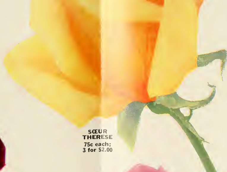
SEUR THERESE 75c each; 3 for $2.00

ny not be grouped es to obtain the y rate