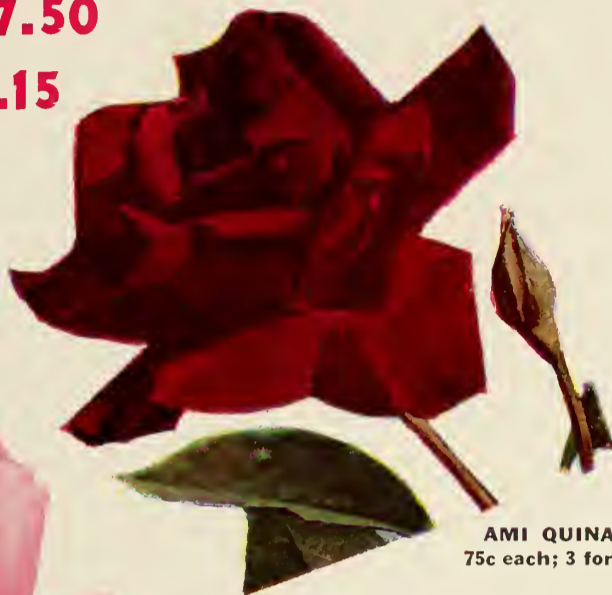
AMI QUINARD 75c each; 3 for $2.00