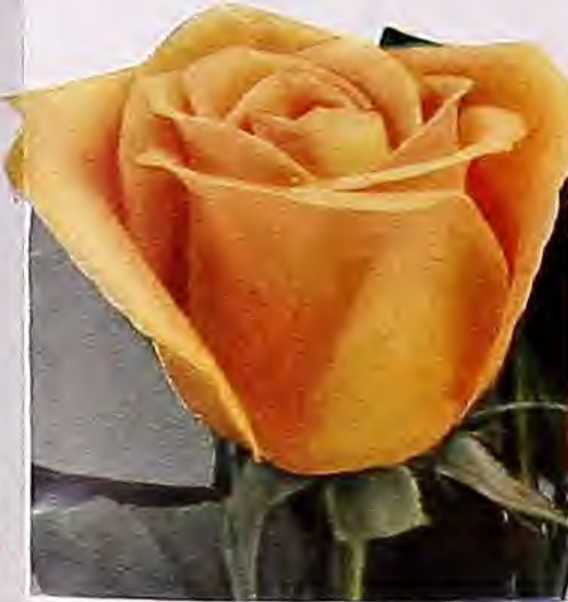
BRANDYWINE. Plant Pat. 530 $1.50 each; 3 for $3.75