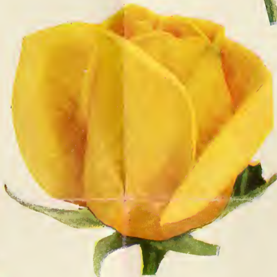
LUXEMBOURG 75c each; 3 for $2.00