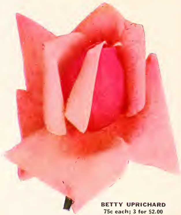
BETTY UPRICHARD 75c each; 3 for $2.00