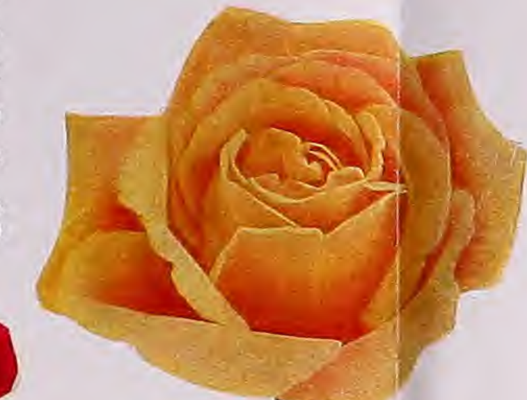
GOLDEN DAWN 75c each; 3 for $2.00