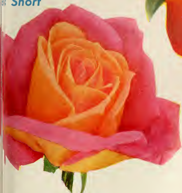
PRES. HERBERT HOOVER 75c each; 3 for $2.00