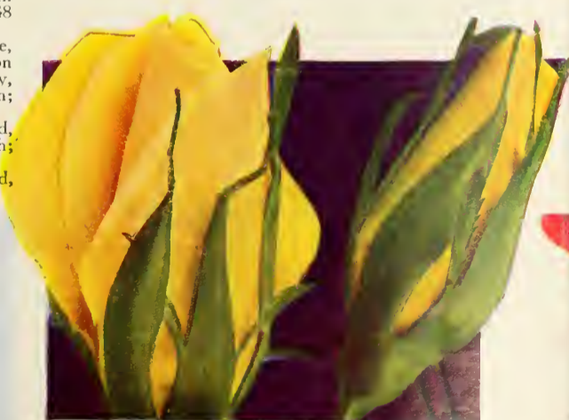
ECLIPSE. Plant Pat. 172 $1.35 each; 3 for $3.40