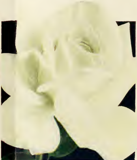
REX ANDERSON. Plant Pat. 335 $1.50 each; 3 for $3.75