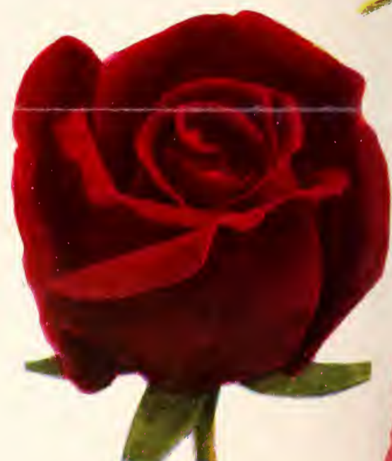
ROUGE MALLERIN 75c each; 3 for $2.00