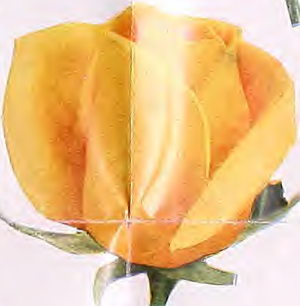
LUXEMBOURG 75c each; 3 for $2.00