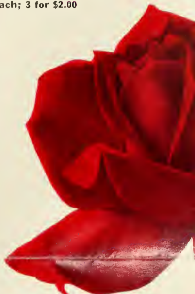
ETOILE DE HOLLANDE 75c each; 3 for $2.00