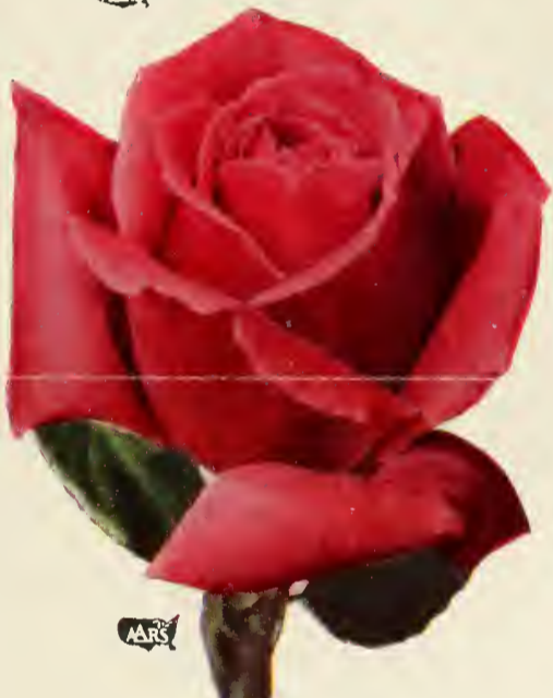
TALLYHO Plant Pat. 828 $2.00 each; 3 for $5.10