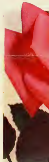
MARY MARGARET MCBRIDE. Plant Pat. 537 $1.50 each; 3 for $3.75