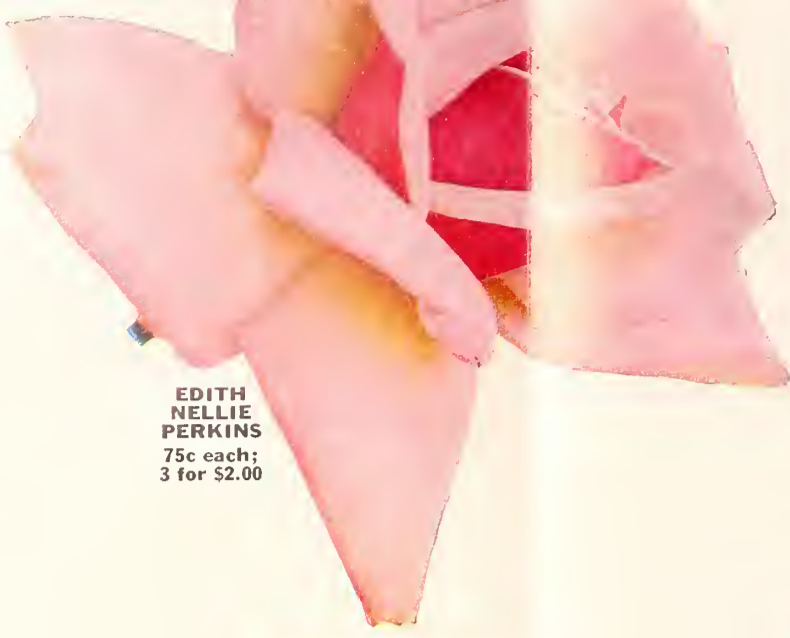
EDITH NELLIE PERKINS 75c each; 3 for $2.00

et, flushed velvety crimson. tant. imson, without a trace of beautiful. $1.00 each; 3 for The blooms are full double, rorous. color beauty from Spain— er large and double. Free single flowers with maroon tant. cupped, high centered, fra- rge; very vigorous. red, shaded cerise-orange; rant, glowing pink flowers, carlet, shading to deep pure ge; free flowering. almost unfading. large and very double, deep A thrifty, dependable Rose. y, flushed old-rose. yellow flowers of fine form, fragrance. et of Talisman, with its par- pleasing fragrance. nasturtium-red; flower very rtium shadings. $1.00 each;