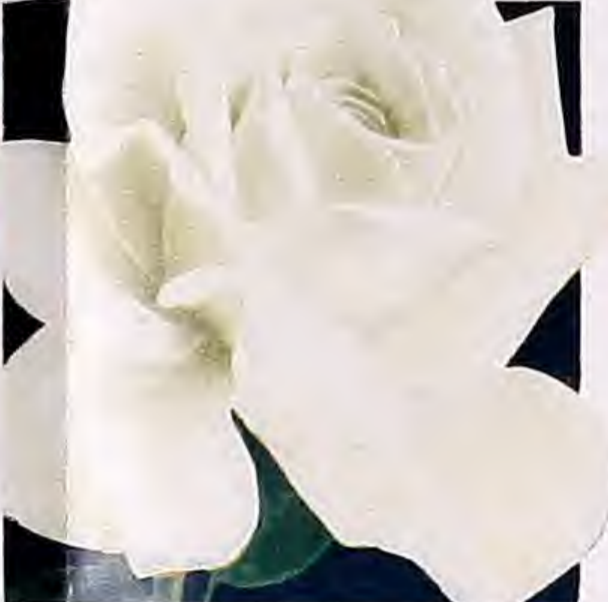
REX ANDERSON. Plant Pat. 335 $1.50 each; 3 for $3.75