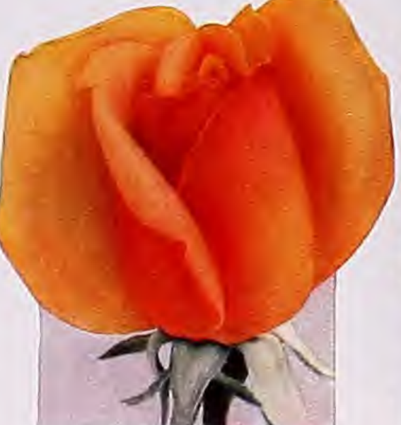
CALIFORNIA. Plant Pat. 449 $1.25 each; 3 for $3.75