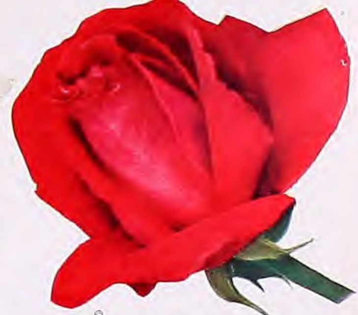
RUBAIYAT. Plant Pat. 758 $1.50 each; 3 for $3.75