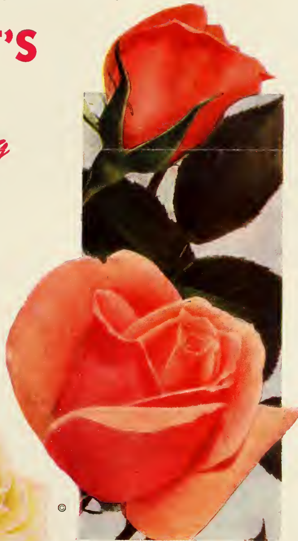
HORACE McFARLAND. Plant Pat. 730 $1.50 each; 3 for $3.75.