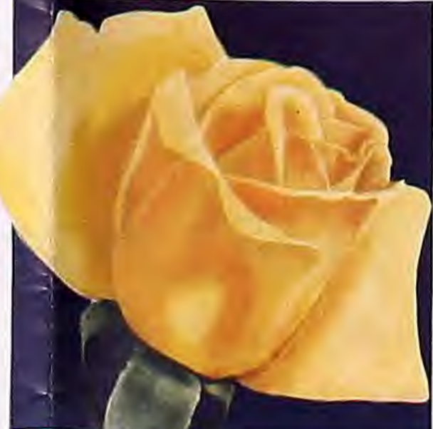
MME. MARIE CURIE. Plant Pat. 727 $1.50 each; 3 for $3.75