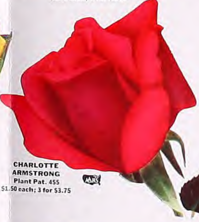
CHARLOTTE ARMSTRONG Plant Pat. 455 $1.50 each; 3 for $3.75