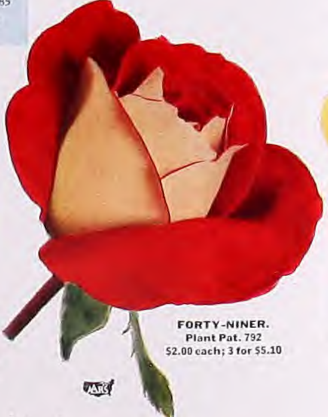
FORTY-NINER. Plant Pat. 792 $2.00 each; 3 for $5.10