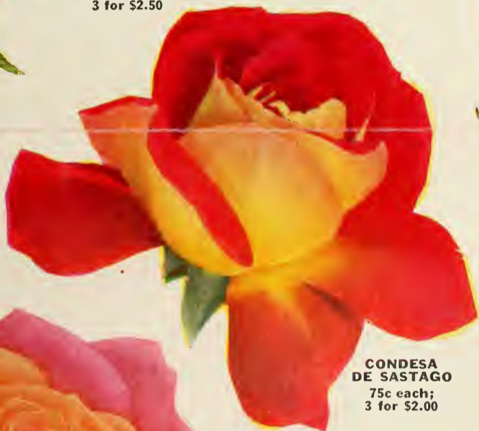
CONDESA DE SASTAGO 75c each; 3 for $2.00

Three plants of a variety will fur- nish harmonious and pleasing bouquets.