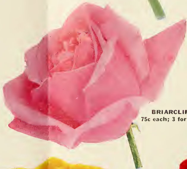
BRIARCLIFF 75c each; 3 for $2.00