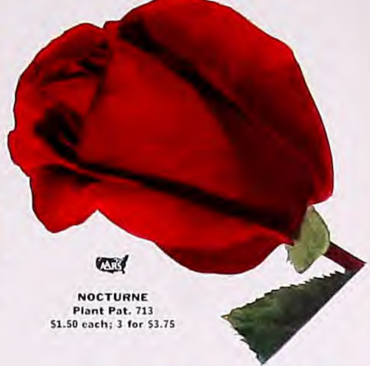
NOCTURNE Plant Pat. 713 $1.50 each; 3 for $3.75