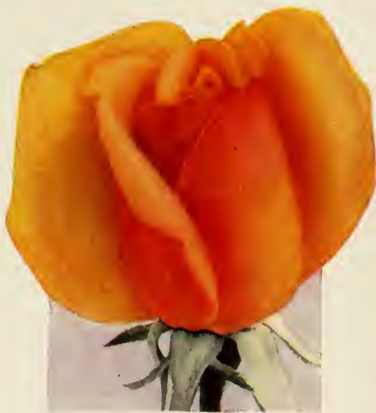
CALIFORNIA. Plant Pat. 449 $1.25 each; 3 for $3.15