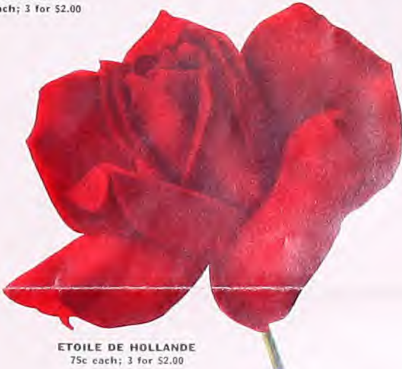
ETOILE DE HOLLANDE 75c each; 3 for $2.00