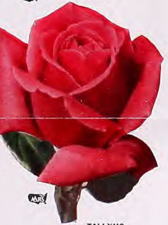
TALLYHO Plant Pat. 828 $2.00 each; 3 for $5.10