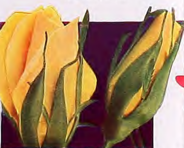
ECLIPSE. Plant Pat. 172 $1.35 each; 3 for $3.40