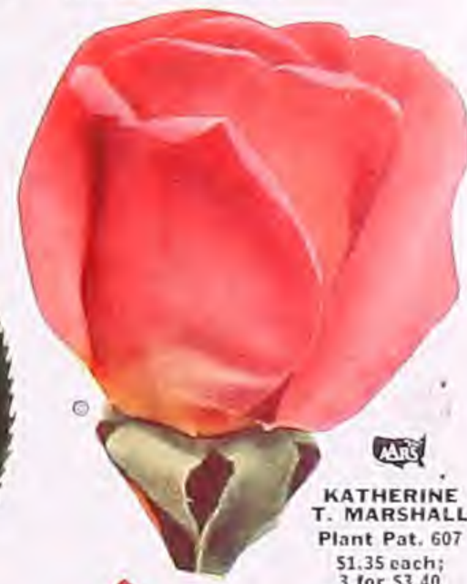
KATHERINE T. MARSHALL Plant Pat. 607 $1.35 each; 3 for $3.40