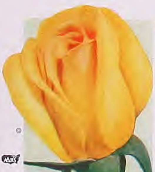
LOWELL THOMAS. Plant Pat. 595 $1.50 each; 3 for $3.75

One each of the above prepaid for only $10.10