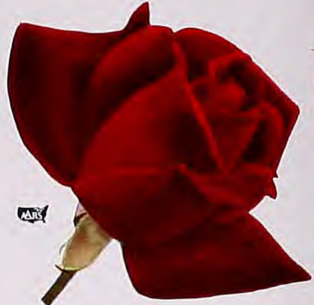
MIRANDY. Plant Pat. 632 $1.50 each; 3 for $3.75