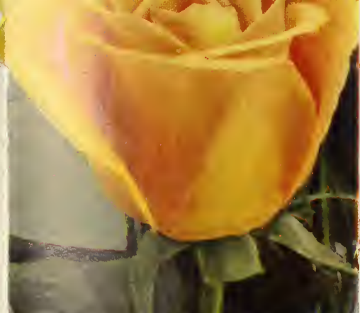
BRANDYWINE. Plant Pat. 530 $1.50 each; 3 for $3.75