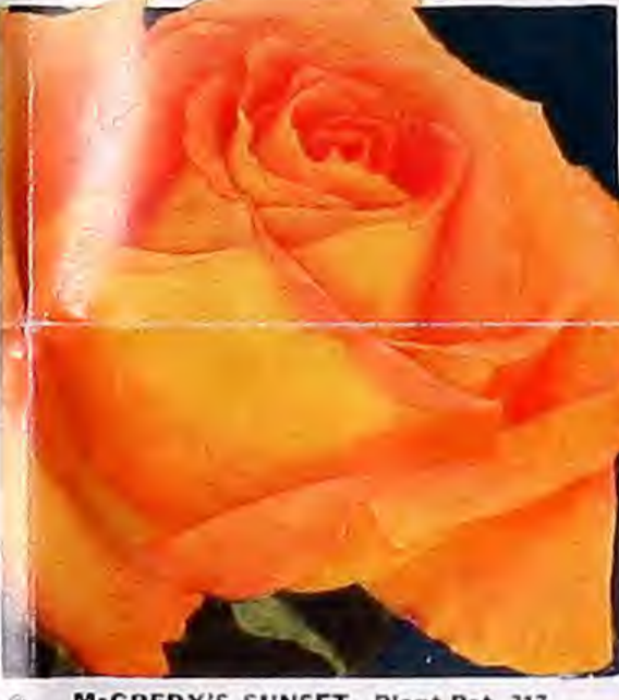
McGREDY'S SUNSET. Plant Pat. 317 $1.35 each; 3 for $3.40