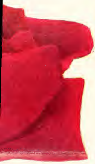
HILL 3 for $2.00