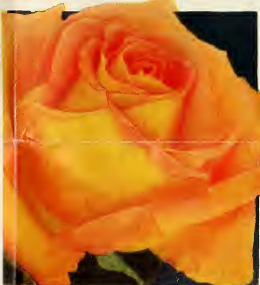
MCGREDY'S SUNSET. Plant Pat. 317 $1.35 each; 3 for $3.40