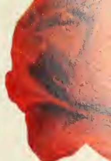
NOCTURNE. Plant Pat. 713 $1.50 each; 3 for $3.75