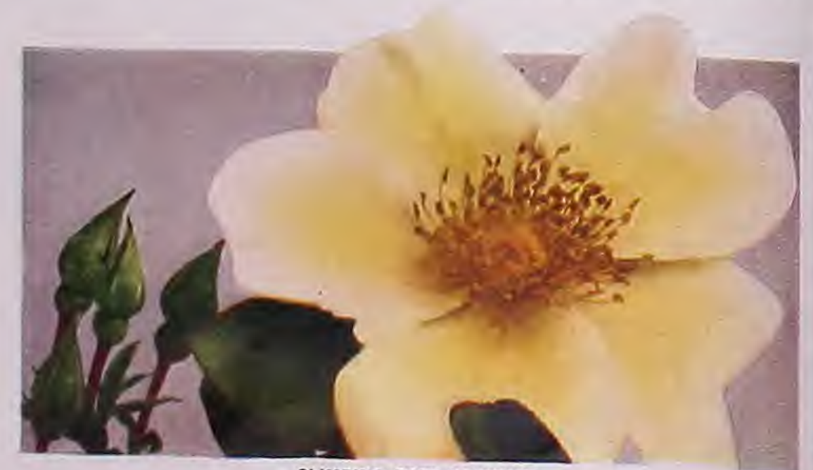
CLIMBING ROSE, MERMAID $1.00 each; 3 for $2.50