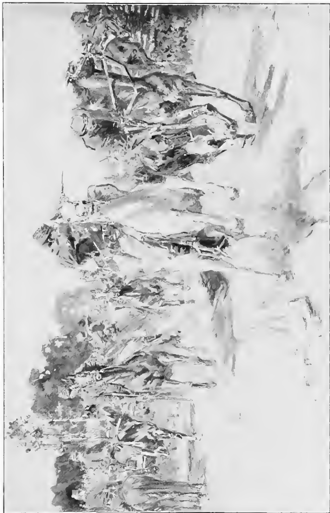
With the rein dangling under the bits he went over the fence like a deer.