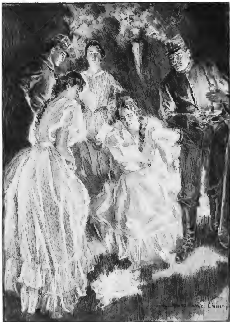
Springing to the ground between our two candles, she bent over the open page.