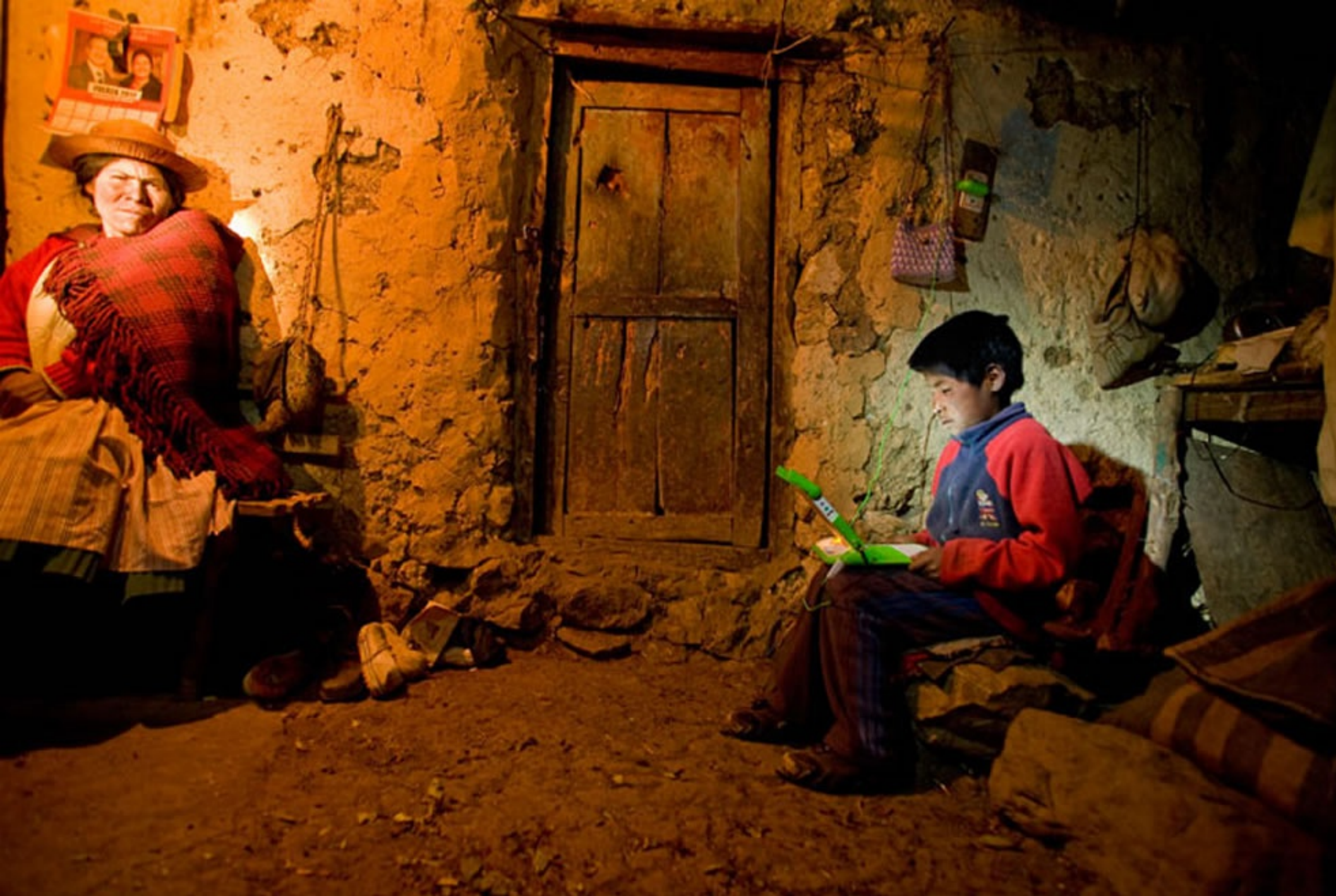
Reading Wikipedia offline. Arahuary, Peru. (2007)