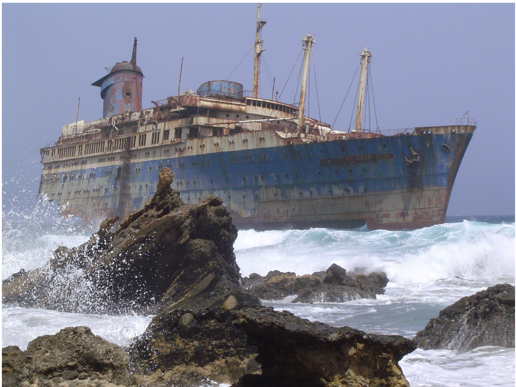
Restos del naufragio del American Star (SS America) vistos desde tierra