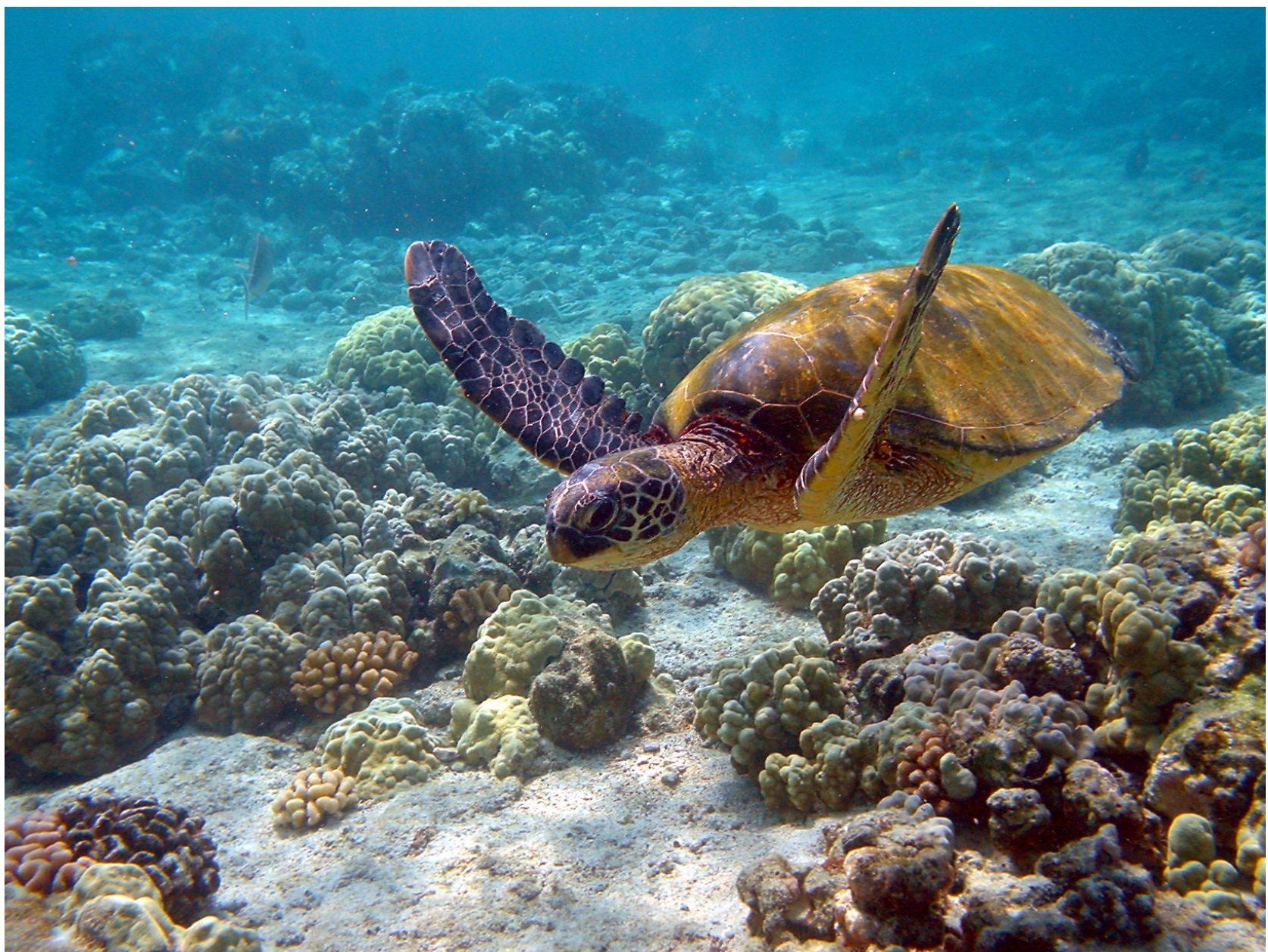
Green turtle ( Chelonia mydas ), Hawai'i, USA