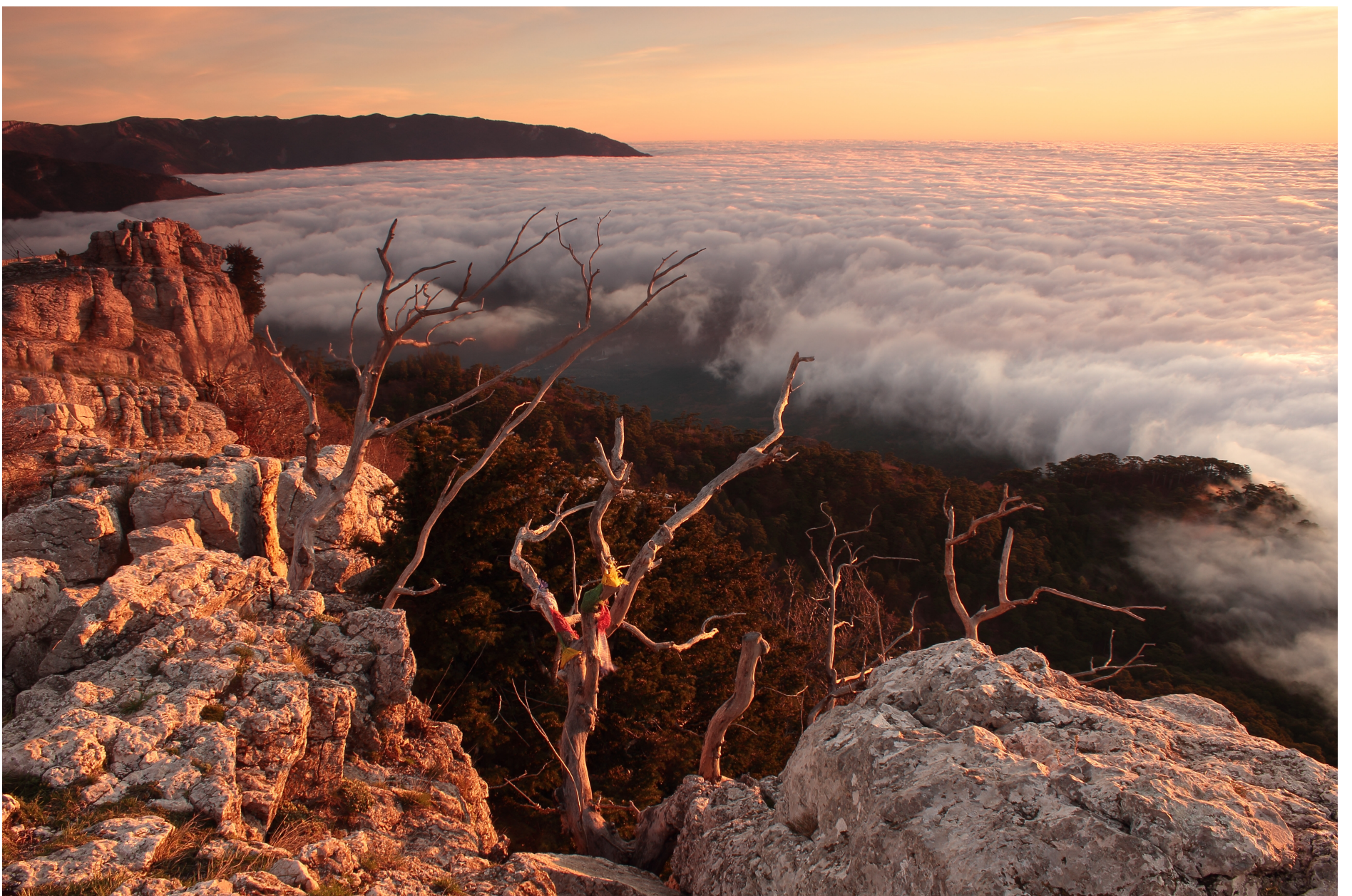
світанок на г. Ай-Петрі, заказник «Ай-Петринська яйла»