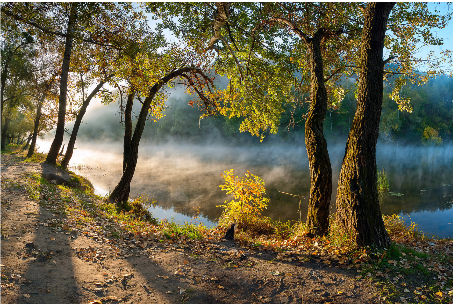
Національний природний парк «Святі Гори», Донецька область, Україна