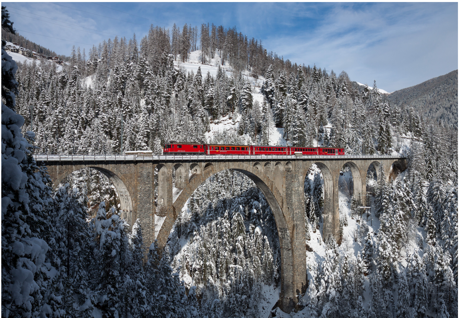
Eine Ge 4/4 II der RhB überquert mit ihrem Pendelzug den Wiesener Viadukt zwischen Wiesen und Filisur, Schweiz.