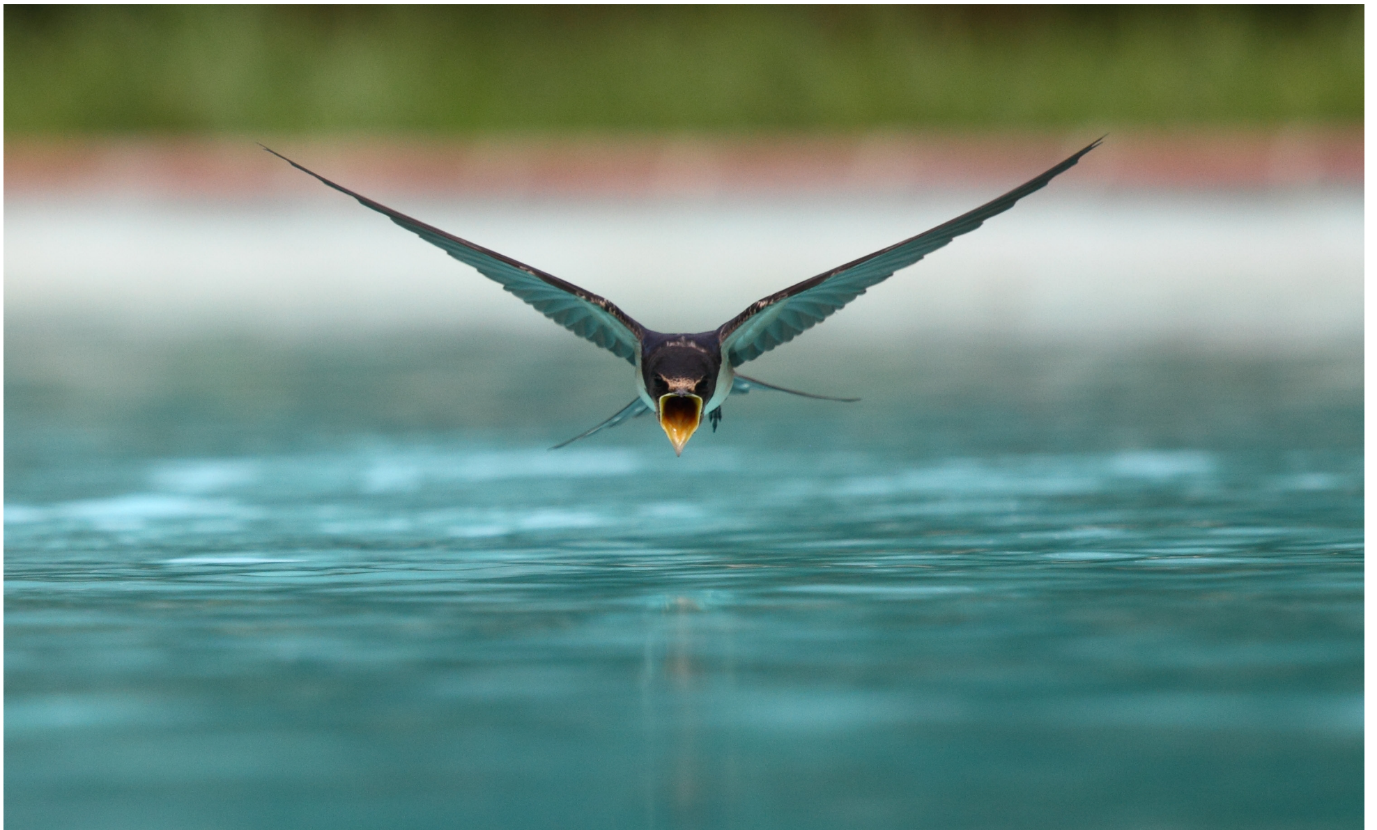
Une hirondelle rustique ( Hirundo rustica ) buvant dans une piscine en plein vol