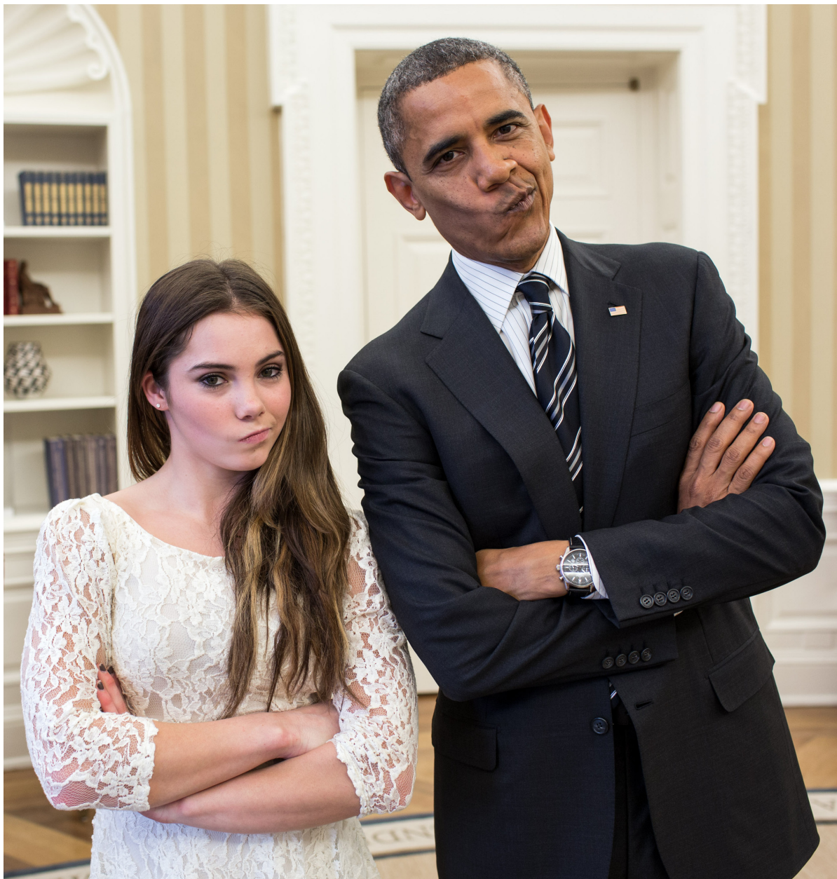
President Barack Obama jokingly mimics U.S. Olympic gymnast McKayla Maroney's "not impressed" look while greeting members of the 2012 U.S. Olympic gymnastics team in the Oval Office.