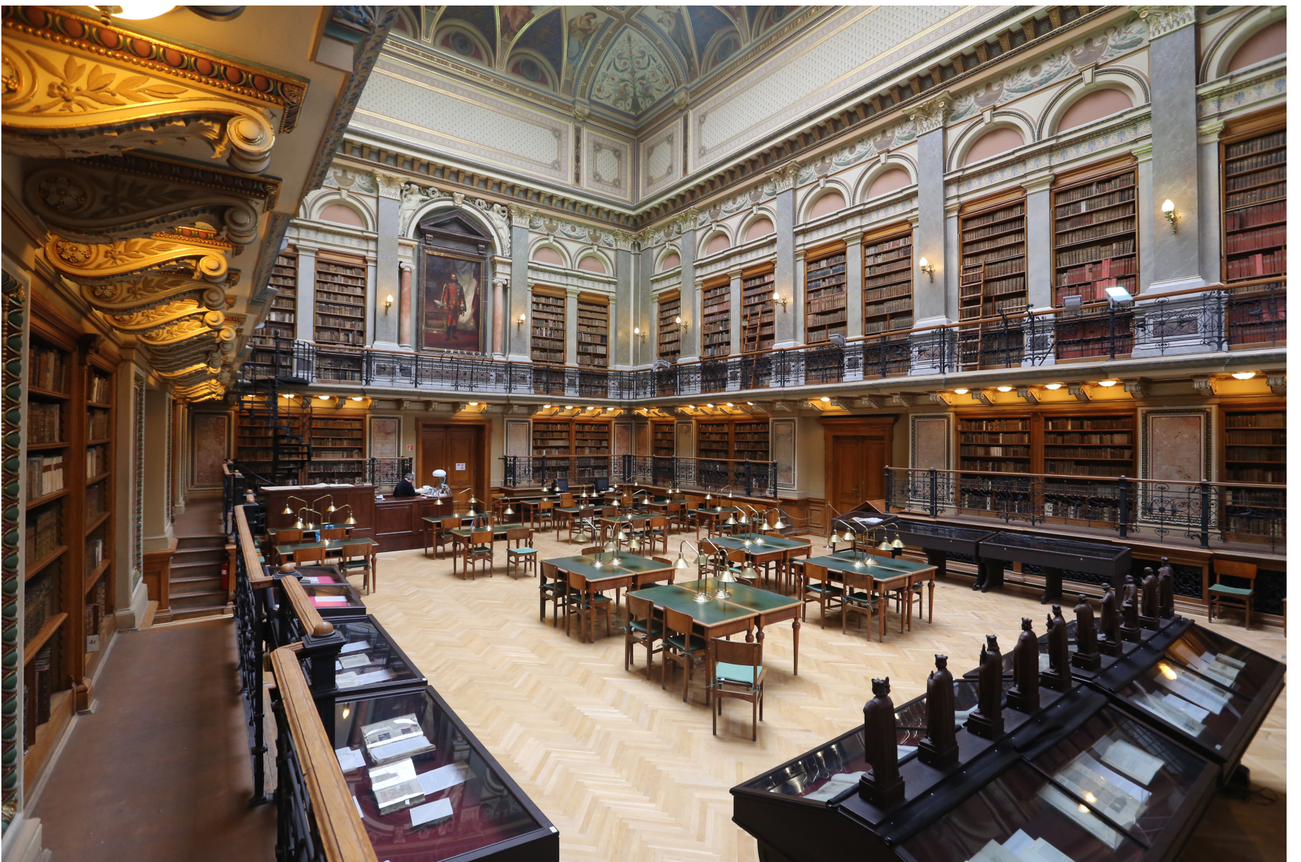
Egyetemi Könyvtár terme, Budapest V. kerület, Ferenciek tere 6