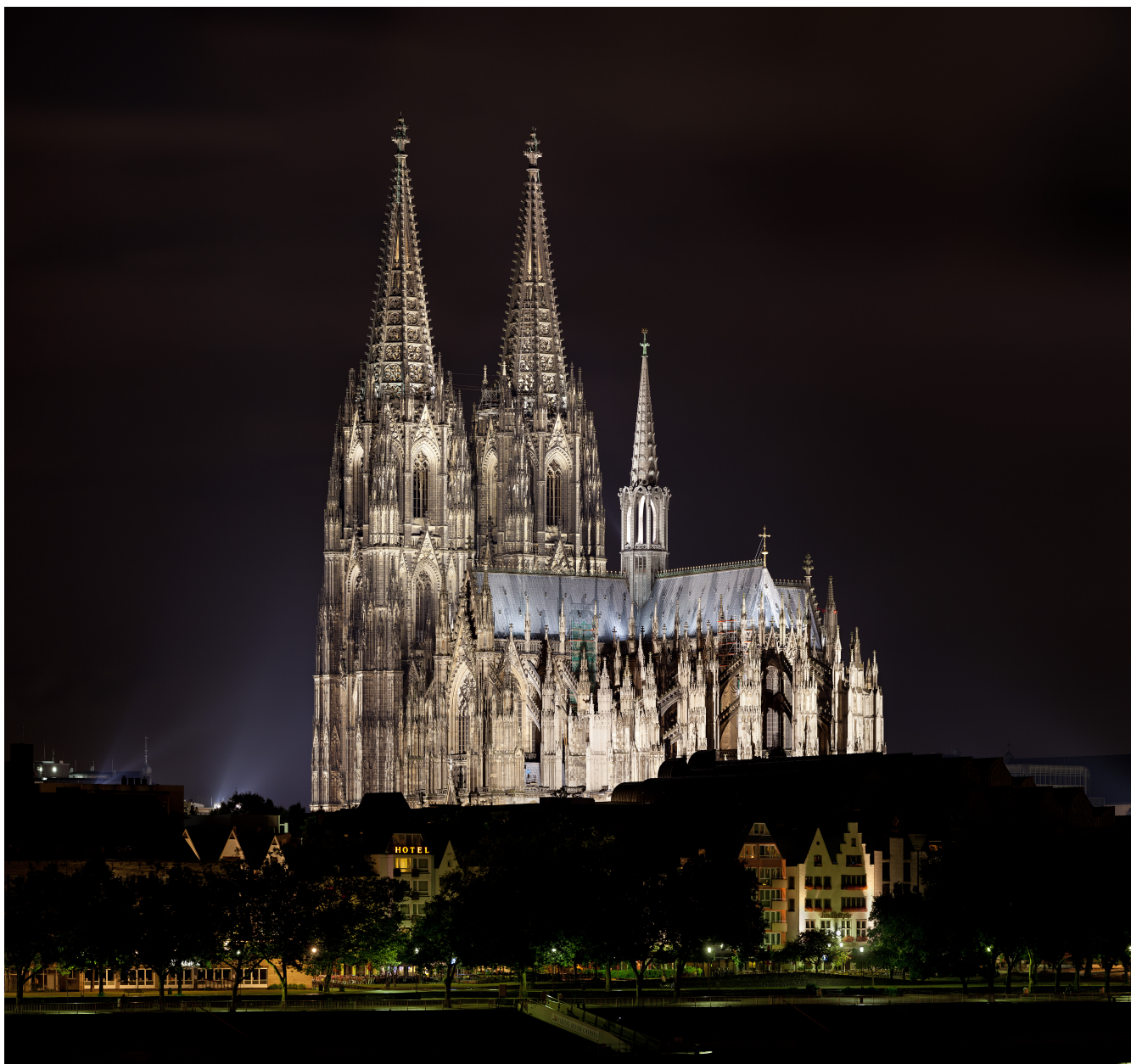
Der Kölner Dom nachts