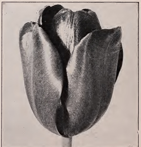
Queen of the Night

MIXED COLORS. Especially attractive where bright showy colors are desired. Every hue and shade represented from white through deepest purple. All top-size, Holland grown bulbs. 3 for 30c; 6 for 50c; 12 for 95c; 25 for $1.70; 100 for $6.15.