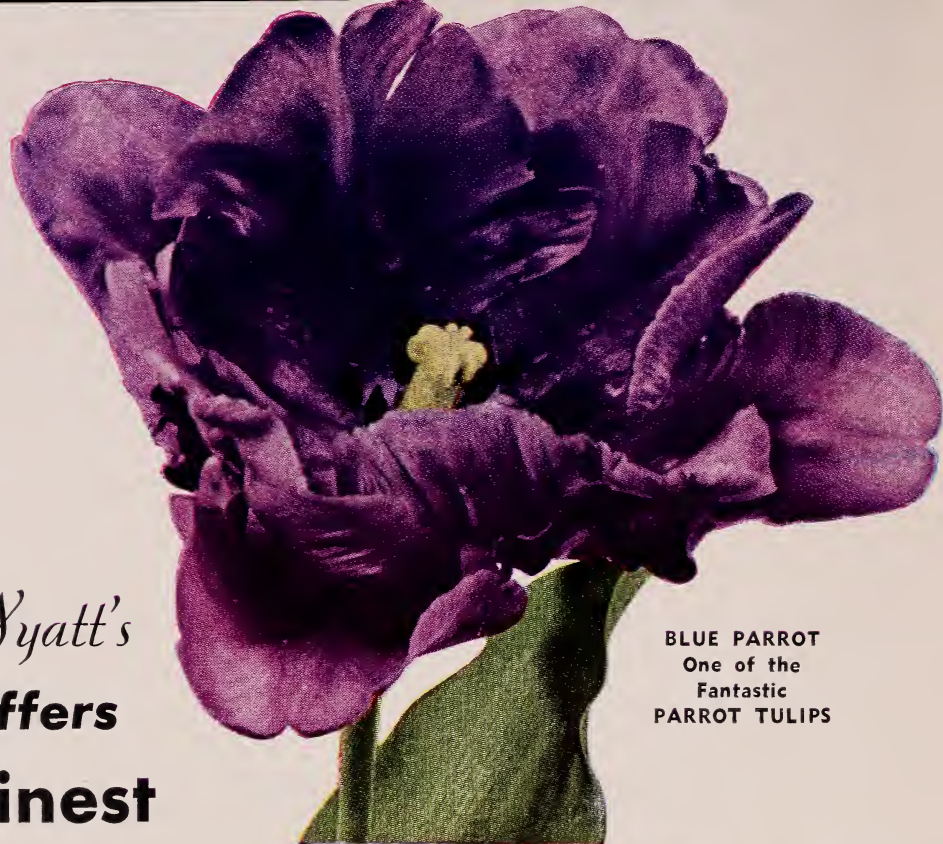
BLUE PARROT One of the Fantastic PARROT TULIPS