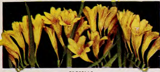
FREESIAS Separate Colors Offered