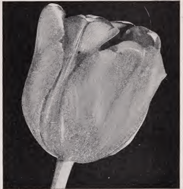
City of Haarlem

ECLIPSE. Large, strikingly attractive deep crimson, with blue base, tall stiff stems. 3 for 35c; 6 for 65c; 12 for $1.20; 25 for $2.15; 100 for $7.65.