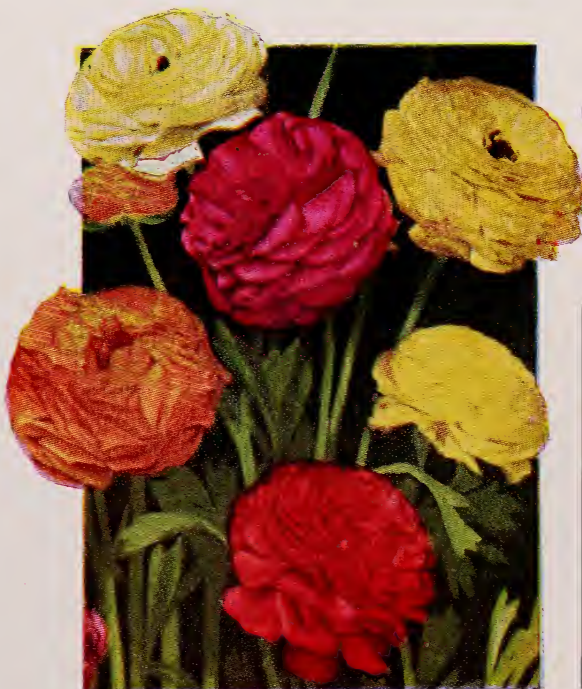
RANUNCULUS Claremont Hybrids