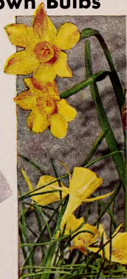
JONQUILLA SIMPLEX and BULBOCODIUM CONSPICUUS