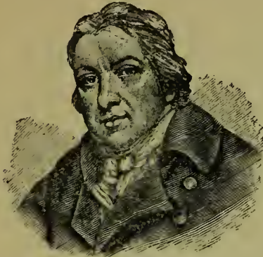
FIG. 360.—EDWARD JENNER, M.D. (CELEBRATED ENGLISH PHYSICIAN, AUTHOR, AND DISCOVERER OF VACCINATION.)

The best form for a surgeon who attempts the most severe