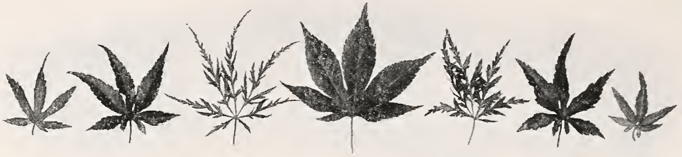
Leaves of the Japanese Maples.