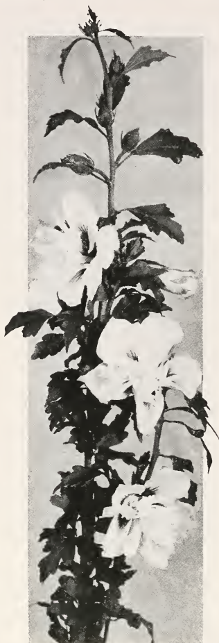
Hibiscus syriacus. Althea.

Hydrangea paniculata grandiflora. HARDY HYDRANGEA. Most hydrangeas are hardy here, but this is the best known of those whose branches are not at all killed back in winter. It has larger flower clusters than any other garden shrub and this fact has made it one of the most popular. They give a magnificent display for a long time in late summer before they turn from white to green and bronze.