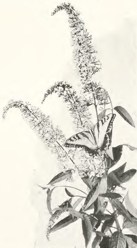
Flowers of the Butterfly Shrub.

Cercis chinensis. DWARF RED BUD. Similar to our native red bud or Judas tree except that it is a shrub. The magenta pink flowers cover the branches in spring.