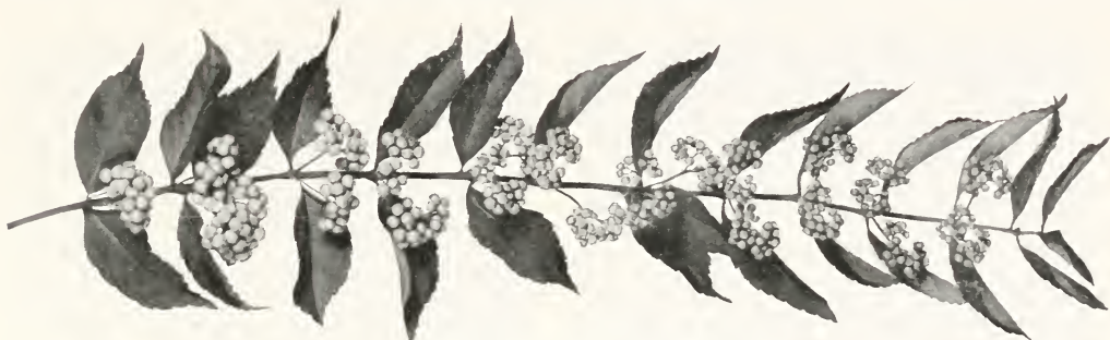
Berries of the Japanese Callicarpa.

Berberis vulgaris. COMMON BARBERRY. A taller arching plant that has pretty clusters of yellow flowers in spring and long coral red berries in winter. Likes partial shade.