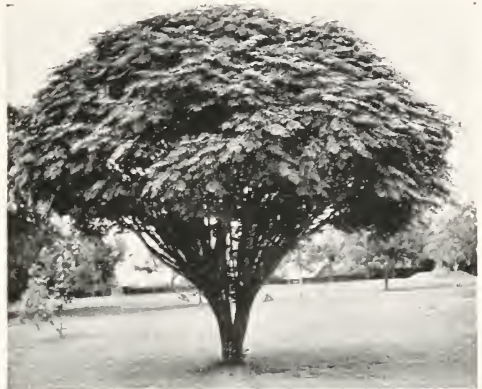
Melia azederach Umbraculiformis. Umbrella China Berry.

Malus ioensis Bechteli. BECHTEL'S CRAB. This is a variety of the western crab apple, and it has the prettiest flowers of all the crabs, we might almost say of all the trees. They are like pale pink, semi-double roses and have the fragrance of the pansy. They cover the tree in late spring.