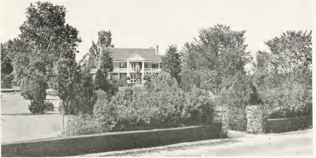
Taken a few years later.

Acer saccharum. SUGAR MAPLE. The tree from which maple sugar is made and famous also for its brilliant autumn colors, symmetry of form and general beauty as a lawn and street tree.