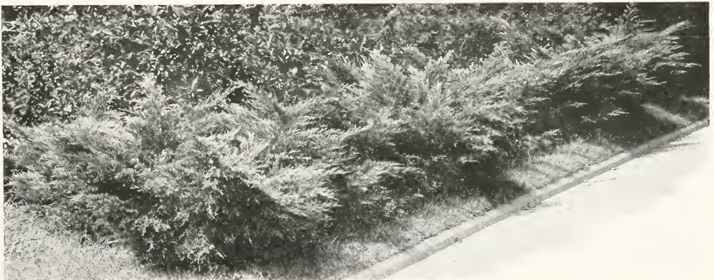
Juniperus Pfitzeriana as an edging.

Juniperus communis Ashfordii. ASHFORD'S JUNIPER. Our own introduction similar to the Irish juniper, but a heavier, denser and broader plant. One of the handsomest of all columnar evergreens.