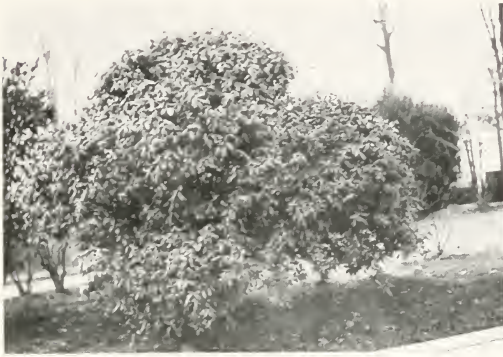
Elaeagnus pungens Simonii.