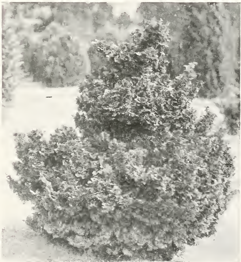
Retinispora obtusa nana .

These are specimens of a rich and highly cultivated character. They are expensive and look it. They are our most popular evergreens, particularly for high class work. They transplant easily, and are not hurt by heat and drouth. Their character is greatly altered by trimming. Entirely untrimmed, they eventually become large, rather open trees. Kept closely sheared they can be developed into dense specimens of any size and shape. This is often the best way to handle them, but the beauty of their foliage is best brought out if the branches are merely tipped once or twice a year. The sheared specimens from our nurseries will stay dense for many years without trimming, but it is best to give them some attention. They are essentially horticultural in appearance and in the treatment they require. Their beauty is due to the varying form and color of their foliage.