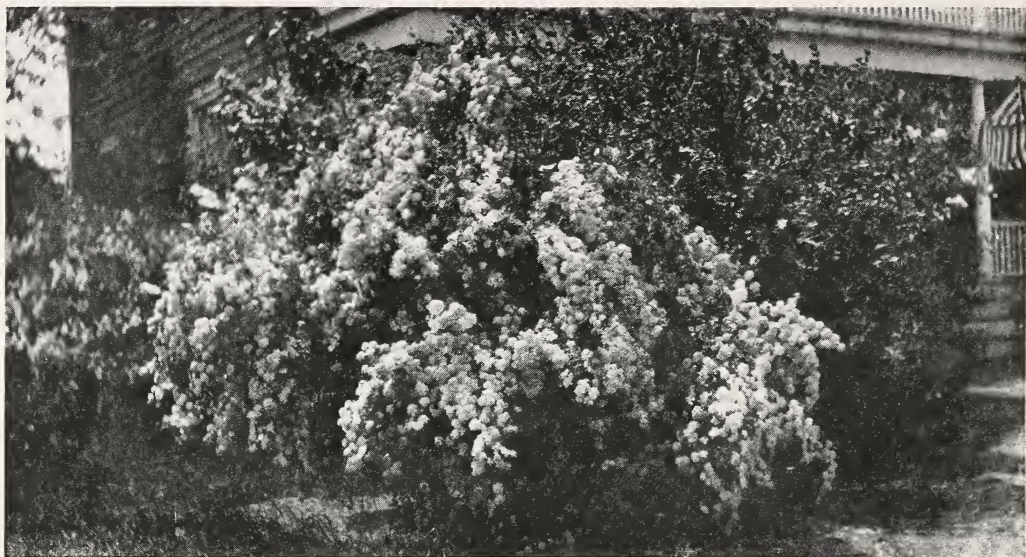
Spirea Vanhouttei . Weeping Bridal Wreath.

Robinia hispida . MOSS LOCUST. This is like the locust tree in foliage, and form of the blossoms. The latter are a beautiful shade of pink, and come in late spring and early summer. It makes a low bush, inclined to sucker and form thickets. Fine for naturalistic and picturesque effects. It sometimes blooms a second time.