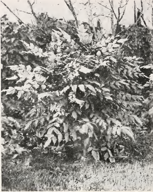
Mahonia japonica. Japanese Mahonia.

Mahonia Aquifolium. HOLLY-LEAVED MAHONIA. OREGON GRAPE. When well grown this is one of the handsomest of all shrubs. It does not like the hot sun or poorly drained clay soil, nor poor dry soil. Plant it in the shade in a soil rich with humus and where it gets good drainage. The leaflets are spiny like the holly; green in the summer, but reddish in winter. The bright yellow flowers are likely to appear at almost any time from mid-winter to mid-spring. They are followed by blue berries.