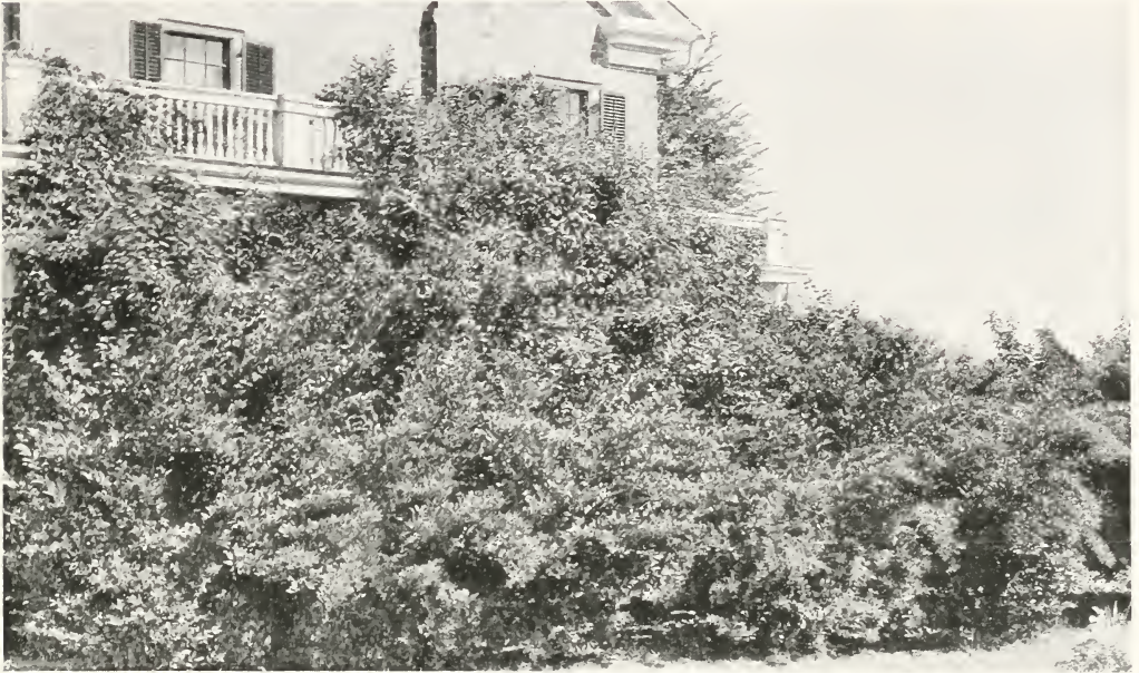
A mass planting of Japanese privets. The taller plants are Ligustrum japonicum . Those in front are Ligustrum lucidum .

Ligustrum japonicum . LARGE JAPANESE PRIVET. The most rapid grower of all broad-leaved evergreens. A two to three foot plant in spring may be six or eight feet tall in fall. Valuable for quick results and for screens. The white flowers are not particularly showy, but the clusters of blue berries in winter resembling upright bunches of wild grapes are extremely attractive and valuable to cut and bring in the house. In severe winters this privet may drop some of its leaves and growth made late in the fall is sometimes injured by severe cold. Ligustrum japonicum forms the main part of the planting at the entrance on page 5.