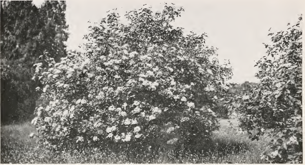
A typical viburnum. See the discussion of viburnums and dogwoods on the previous page.

Viburnum cassinoides. WITHE ROD. The glossy green leaves turn to brilliant orange and scarlet colors in the autumn. The flower clusters are large and showy. The berries are first straw color, then pink, and then blue-black. Requires plenty of moisture. One of the best shrubs for wet places.