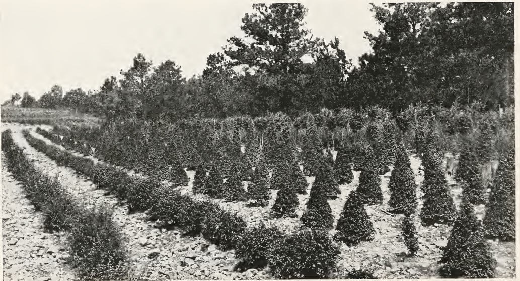
A block of trimmed Box-leaved privet in our nursery.

Ligustrum sinense buxifolia . BOX-LEAVED PRIVET. This is our own introduction. It is a seedling from Ligustrum sinense and is superior to it for all topiary and trimmed work. The leaves are smaller and closer together. The plant is more dense in every way. It is a very dark and rich green in winter. We use this almost entirely for our trimmed forms; cones; standards; domes, etc. Hedges of it are denser, finer and more uniform than those of the type. We have it trimmed into all sorts of attractive shapes, baskets, seats, etc. A privet trimmed to standard form is shown in the illustration on page 28.