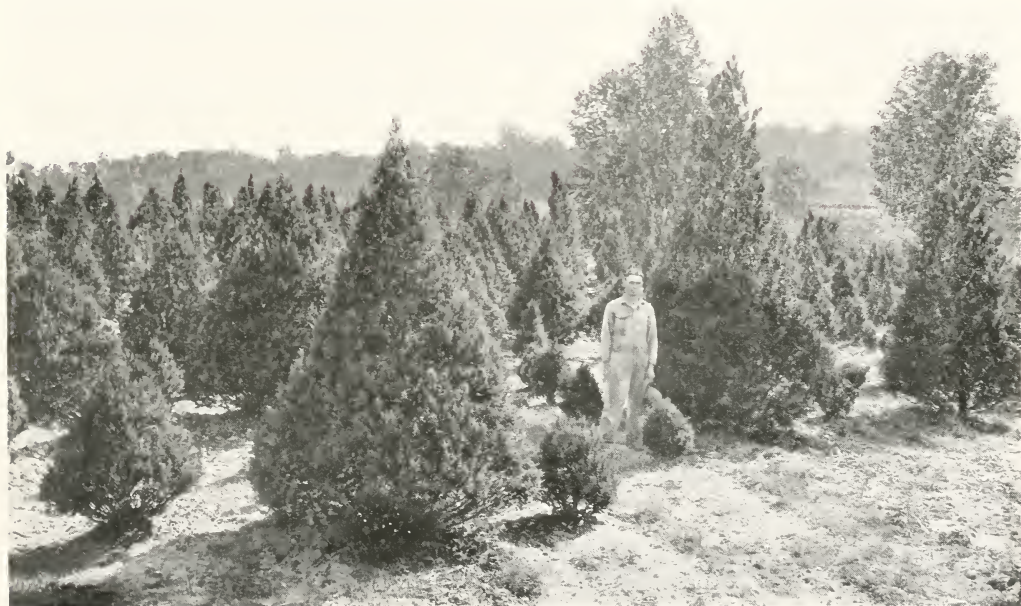
A block of Retinispora in our Nursery.