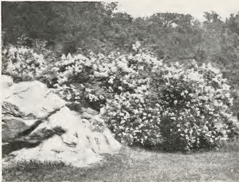
A Rambler Rose.

Vinca major. LARGER PERRIWINKLE. Like the above, but much larger in every way.