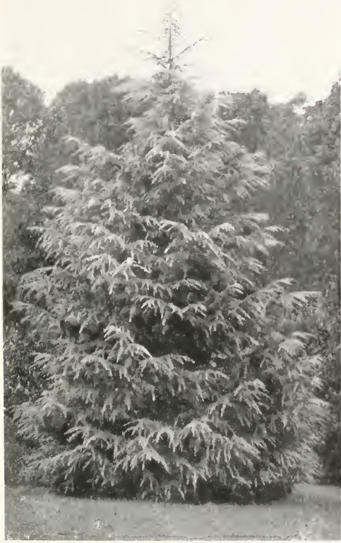
Cedrus Deodara. Deodar Cedar.

Chamaecyparis Lawsonia azurea. BLUE LAWSON'S CYPRESS. One of the most beautiful plants we have. The fronds of foliage are in distinct vertical planes like the Chinese aborvitaes and the color is a beautiful blue green winter and summer.