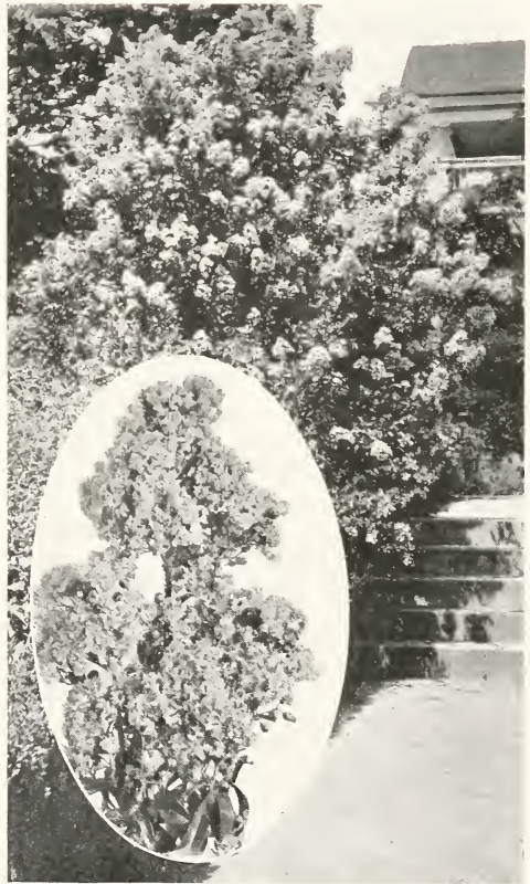
Lagerstroemia indica , Crape Myrtle.

Lespedeza bicolor . PURPLE BUSH CLOVER. Like Desmodium japonica except that it is smaller and the flowers are purple.