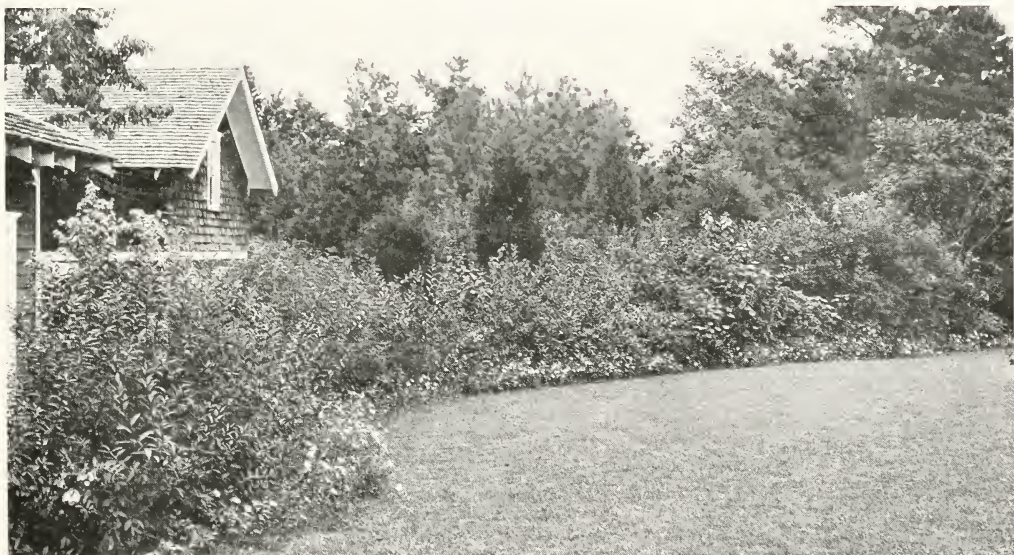
A border of shrubbery and flowers that is not only a thing of beauty and joy in itself, but hides from view the service portions of the property.