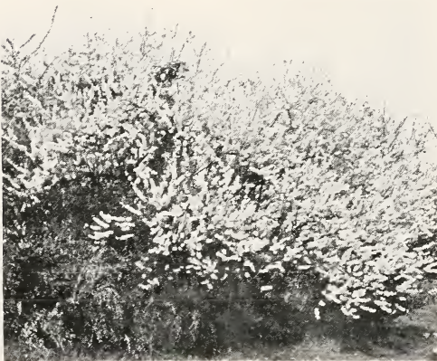
Amygdalus persica. Flowering Peach

Acer rubrum. RED MAPLE. Similar to the silver maple. A smaller tree. The dull red flowers make a brilliant showing in the early spring, and are quickly followed by the still showier and brighter red fruits. The leaves usually turn to brilliant colors in the autumn. This is not the red-leaved Japanese Maple.