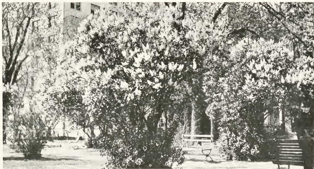
Syringa vulgaris . Lilac.

Viburnum dentatum . ARROWWOOD. One of the most vigorous viburnums here under average conditions. Bright blue berries in mid-summer. Upright growth.