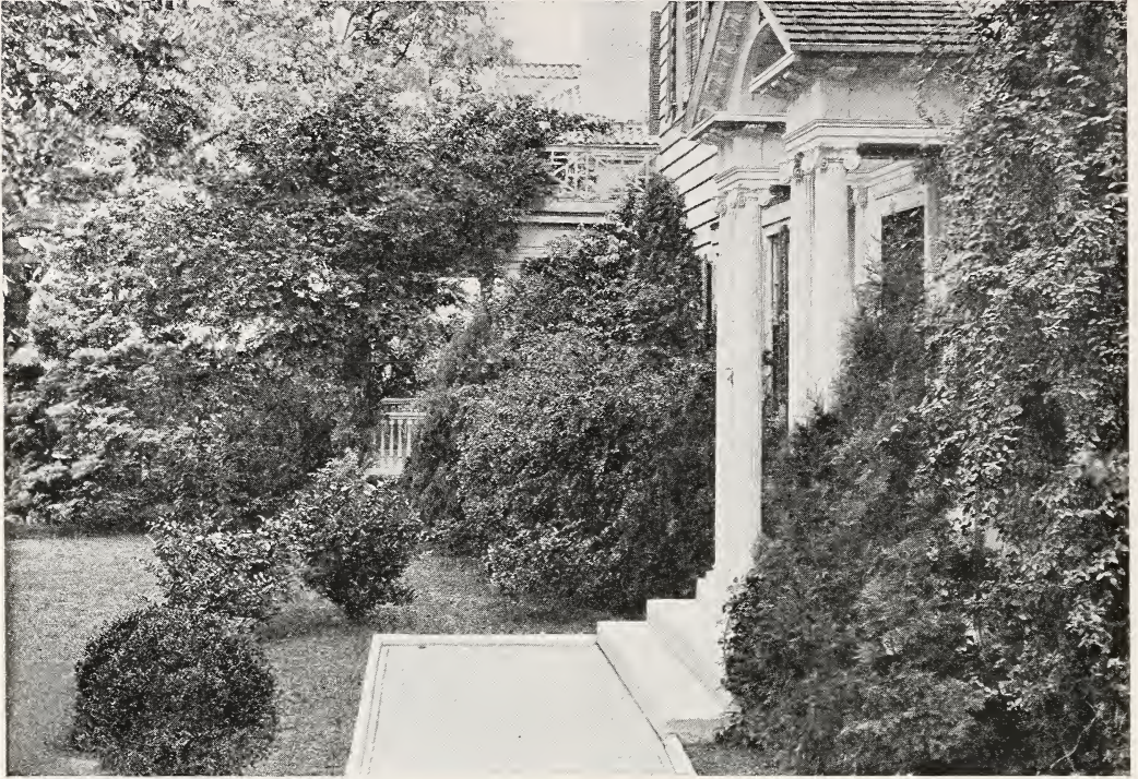
Planting about a colonial doorway.