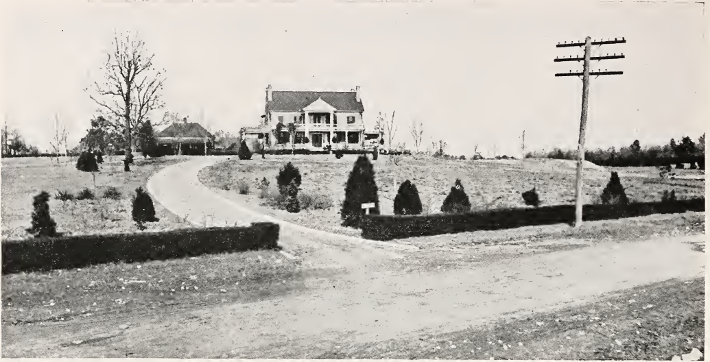
Taken just as planting was commenced.