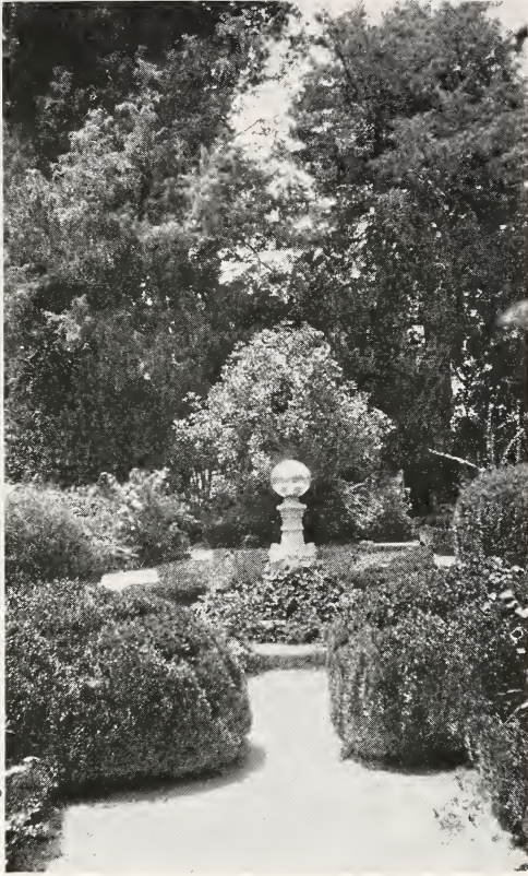
Boxwood and other broad-leaved evergreens in a real old Southern garden.