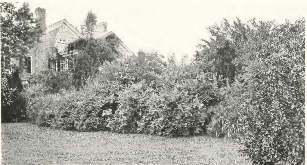
A border of flowering shrubs which separates garden and lawn. A similar one might separate you from some unsightly view or give you privacy where desired.

Ulmus glabra pendula. CAMPERDOWN WEEPING ELM. Weeping branches from a straight upright stem, leaves dark green. This has a richer, higher class look than the other weeping trees.