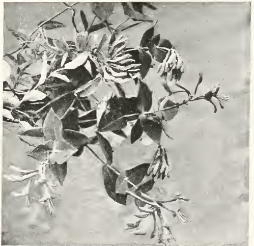
Lonicera periclymenum belgica. Woodbine.

American Pillar. A pillar rose is one that sends up long stiff canes suitable for tying to a pillar or lattice. This has beautiful clusters of large single flowers that open carmine pink with white eye and yellow stamens. No mildew. Our favorite of all the ramblers.