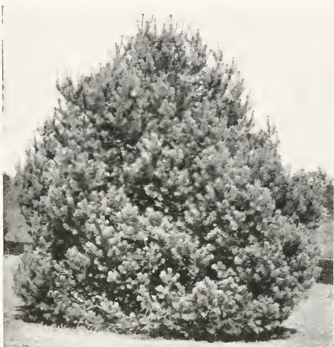
Pinus sylvestris . Scotch Pine.

Pinus montana mughus . MUGHO PINE. Very much a dwarf. Forms a low, dense mound, broader than high. Unusual and attractive. Pure green all winter.