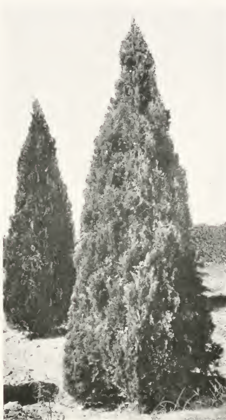
Thuja orientalis aurea conspicua . Golden pyramidal arborvitae. In the background is the pure green pyramidal arborvitae.

Tsuga canadensis . CANADIAN HEMLOCK. A tall forest tree in the mountains. A handsome medium sized specimen here. Although it prefers a cooler climate it needs only a good soil to be a success in the South. One of the few conifers that will grow in shade. The foliage is a dark rich green the year around.