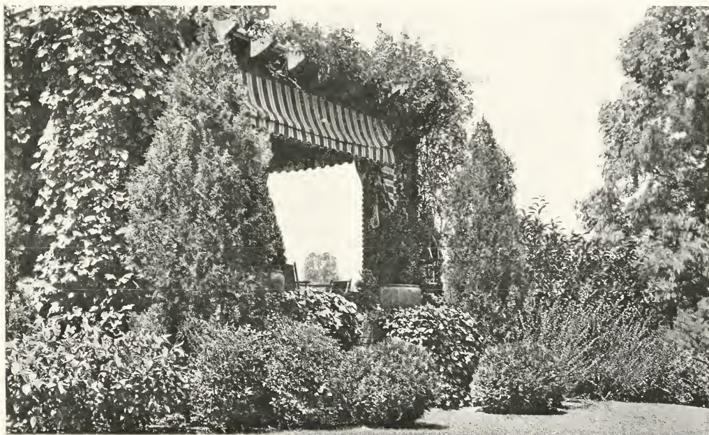
Planting at a porch entrance, Robert B. Cridland, Landscape Architect. Plants from our nurseries.

Aucuba japonica aurea maculata. GOLD DUST TREE. A variety of the above in which the leaves are flecked with small golden yellow spots as though they had been sprinkled with gold dust. One of the best broad-leaf evergreens to give variety in foliage color.