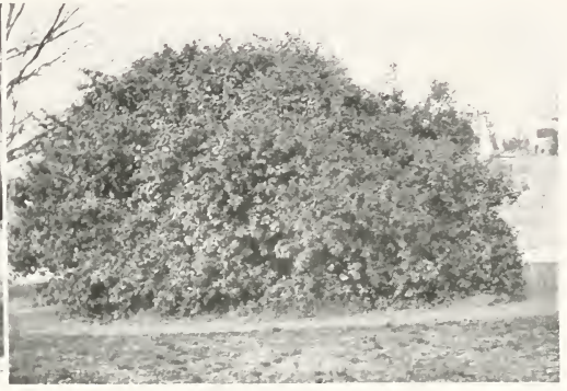
Elaeagnus pungens reflexa.

Elaeagnus pungens . EVERGREEN OLEASTER. A broad-leaved evergreen that is of fairly rapid growth, and not particular as to soil or sun. The under sides of the leaves are silvery with brown scales. The flowers are not conspicuous, but are very fragrant and come in the fall. The fruit matures the following spring and is dark red and edible when fully ripe.