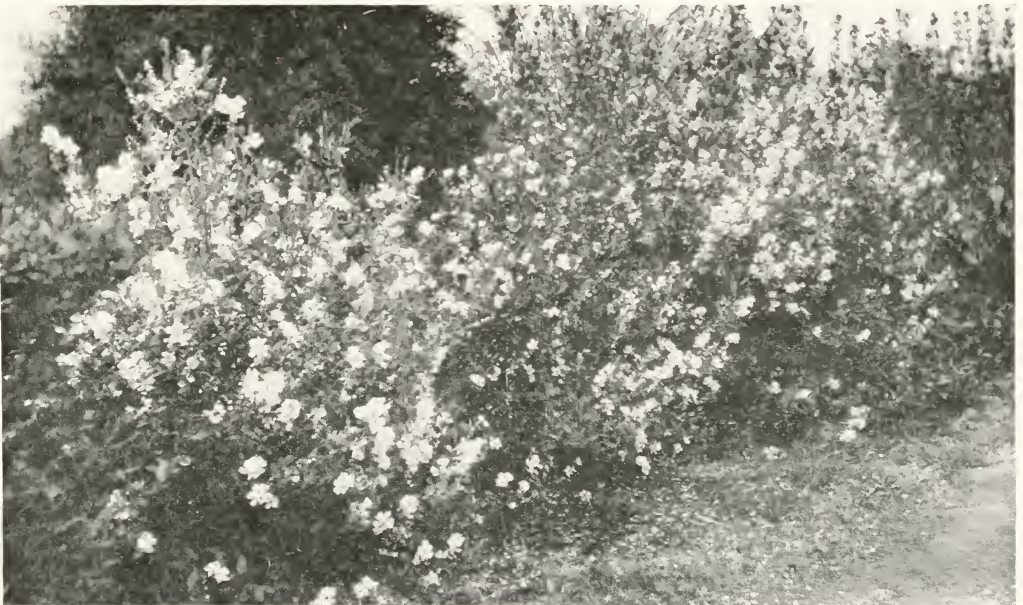
Exochorda grandiflora. Pearl Bush.

Exochorda grandiflora. PEARL BUSH. Gives a wonderful display of pure white flowers for a long time in the spring, yet it is not frequently planted. Usually, when we want an uncommon plant we have to select something that is difficult to grow or which does not advertise itself with a striking floral display. Here is an exception.