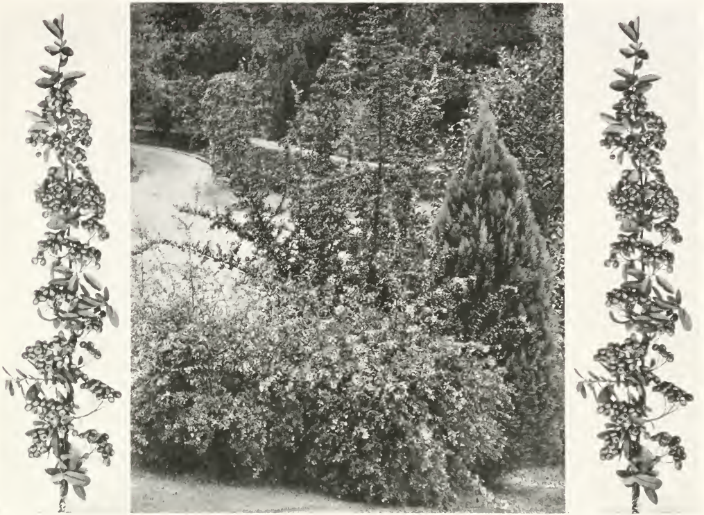
Plant and berries of the Evergreen Hawthorn, Pyracantha coccineum . The plant in the foreground is abelia. That on the right is the blue variety of Lawson's Cypress.

atmosphere. They should be planted in a bed of old compost and wood's earth; the surface of the bed kept a few inches lower than that of the surrounding ground and covered with a thick mulch of leaves. They must be in partial shade and have both moisture and drainage. When grown successfully nothing is more beautiful. Do not cultivate them as the roots are too near the surface. We do not carry many rhododendrons in stock, but have arrangements for collecting them.