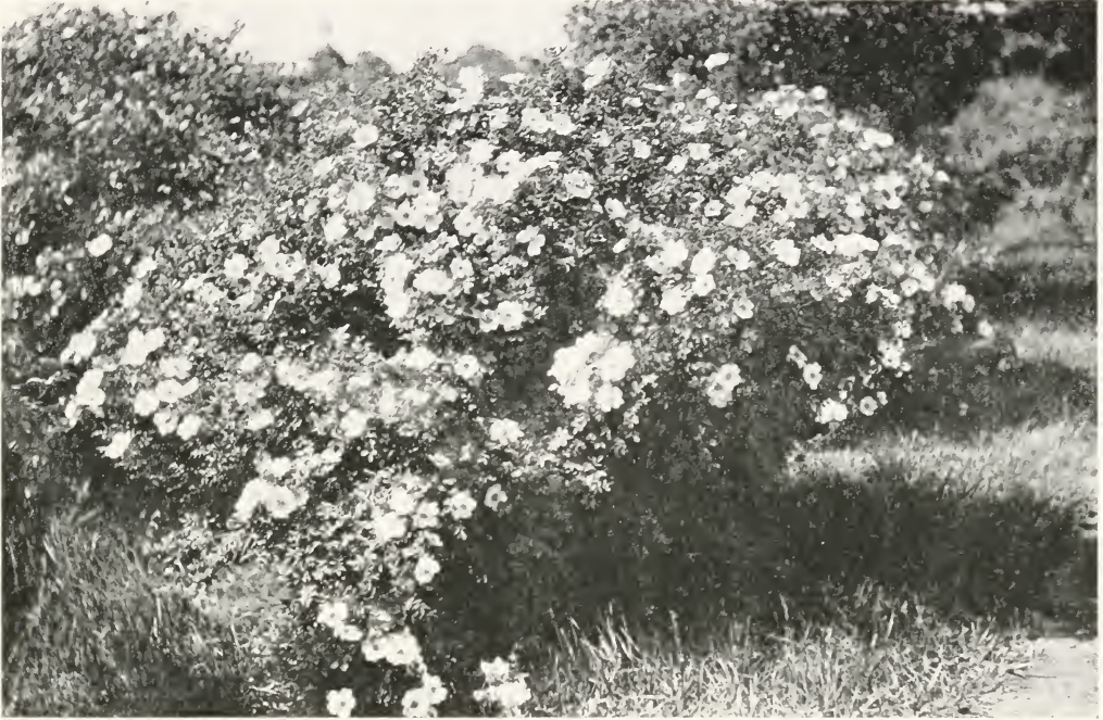
A typical single rose.

Rhus canadensis. FRAGRANT SUMAC. This is usually a low spreading shrub when growing wild. In cultivation it is more upright. The yellow flowers in spring and scarlet berries in early summer are partly hidden by the leaves. The leaves turn deep rich red in autumn. They resemble the leaves of the poison ivy, but are not poisonous. It is one of the best low shrubs for naturalistic work.