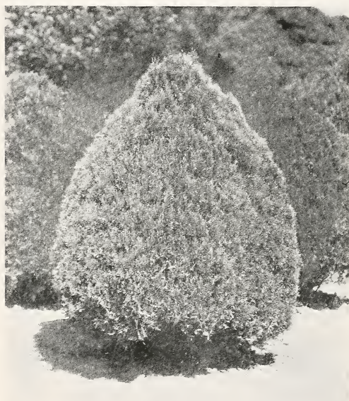
Thuja orientalis aurea nana .

Thuja orientalis aurea compacta . DWARF GOLDEN BIOTA. Dwarf and compact, pleasing light yellow green color.