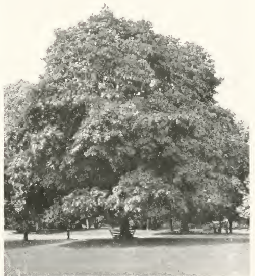
Acer platanoides. Norway Maple.

Betula lenta. SWEET OR CHERRY BIRCH. The bark of the young twigs has a pleasing taste. From it are made the birch and winter-green flavors. It grows into a large, handsome tree.