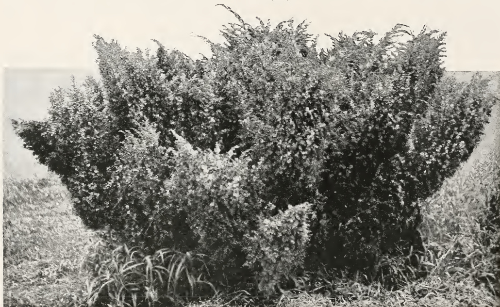
Juniperus communis depressa . Spreading Juniper.

Juniperus horizontalis . PROSTRATE JUNIPER. A prostrate creeping juniper, useful among the rocks.