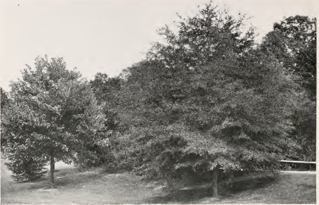
Quercus nigra . Water Oak (Right). Acer dasycarpum . Silver Maple (Left.). These two trees were both 10-12 foot size when planted from our nurseries in 1914. Photographed 1921. Some think all oaks are of slow growth. Here, as usual, the water oak has grown as fast as the silver maple, famous for its rapidity of growth.

Platanus orientalis . LONDON PLANE. The oriental plane of horticulture, but not the true oriental plane of botany. Of more symmetrical and denser growth than the native plane. Less conspicuous bark. Often recommended as the best street tree.