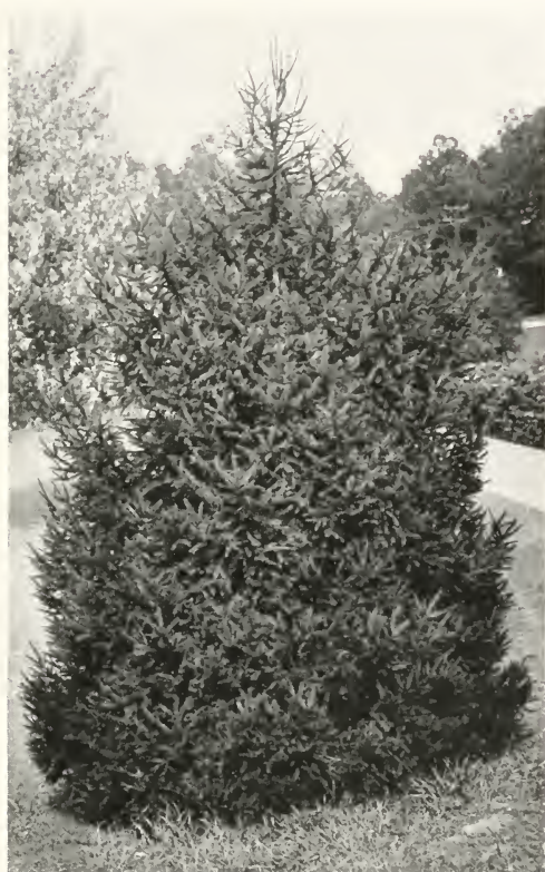
Picea excelsa . Norway Spruce.

Picea pungens glauca . COLORADO BLUE SPRUCE. This is a striking blue-colored spruce much planted in the North. It is rather fortunate that it does not do well in the South because its aggressive bizarre color and form have spoiled the character of many an otherwise quiet and dignified lawn. We have it for you if you insist.