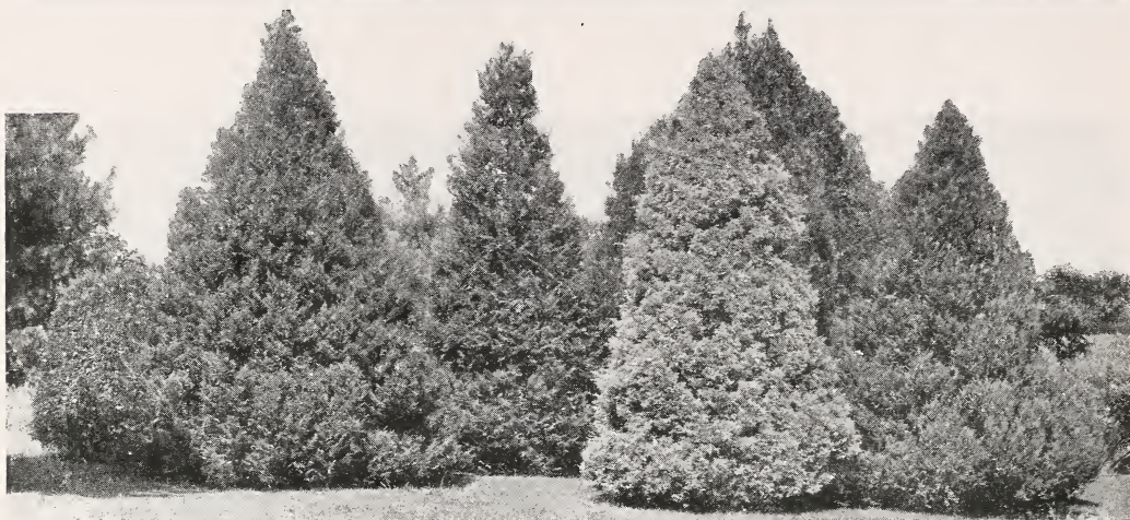
Group of Retinisporas . The Light colored is the Silver Cypress. The others are the Plume Cypress.

Retinispora pisifera . PEA-FRUITED JAPANESE CYPRESS. Foliage flattened as though ironed out. Pure green.