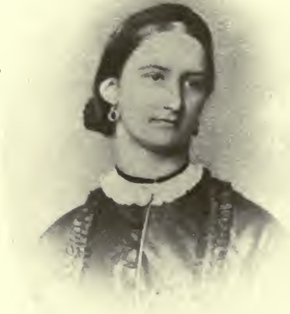
LADY LYALL—ABOUT 1862.