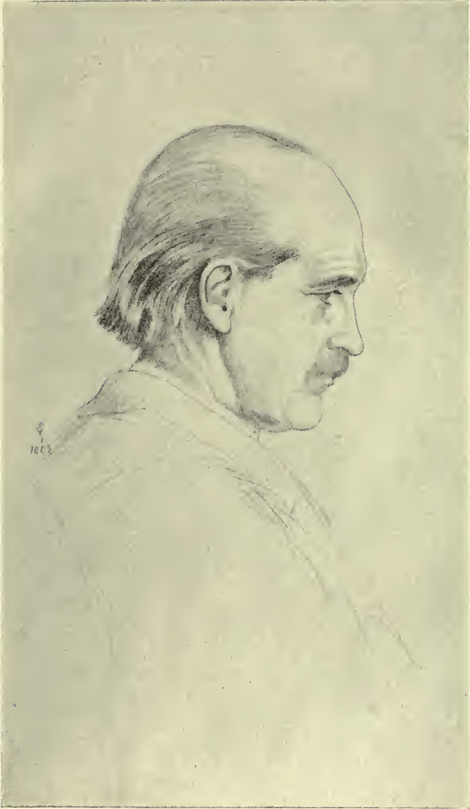
1892. FROM A PENCIL SKETCH BY THE MARCHIONESS OF GRANBY.