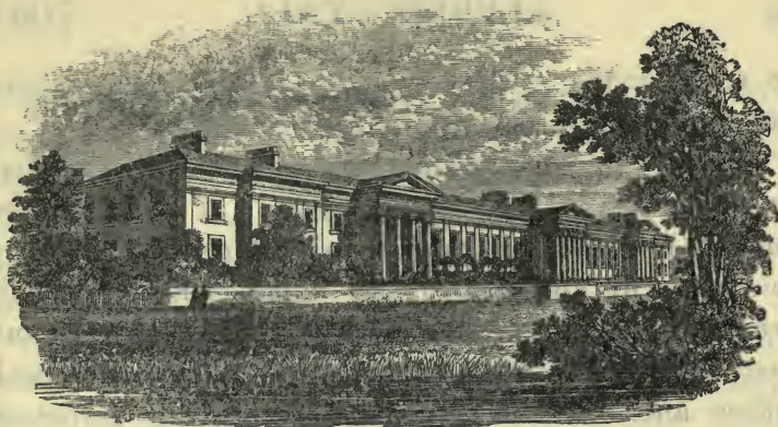
SOUTH FRONT HAILEYBURY COLLEGE.