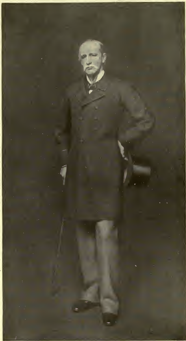
FROM THE PORTRAIT BY J. J. SHANNON, R.A., 1890.