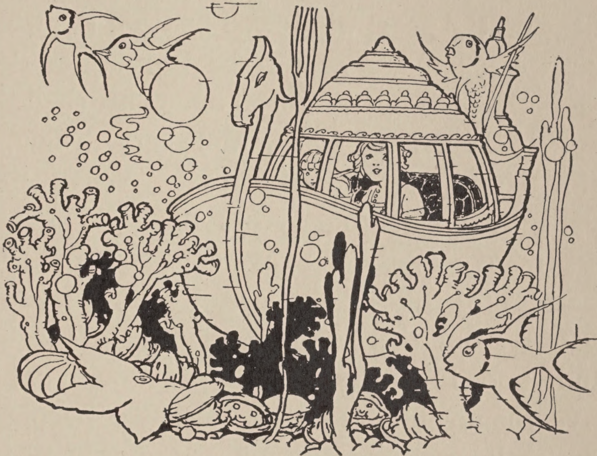
Each bed held a plump, smiling baby oyster

say it myself. Listen! The Water Nymphs are singing the oyster babies to sleep."