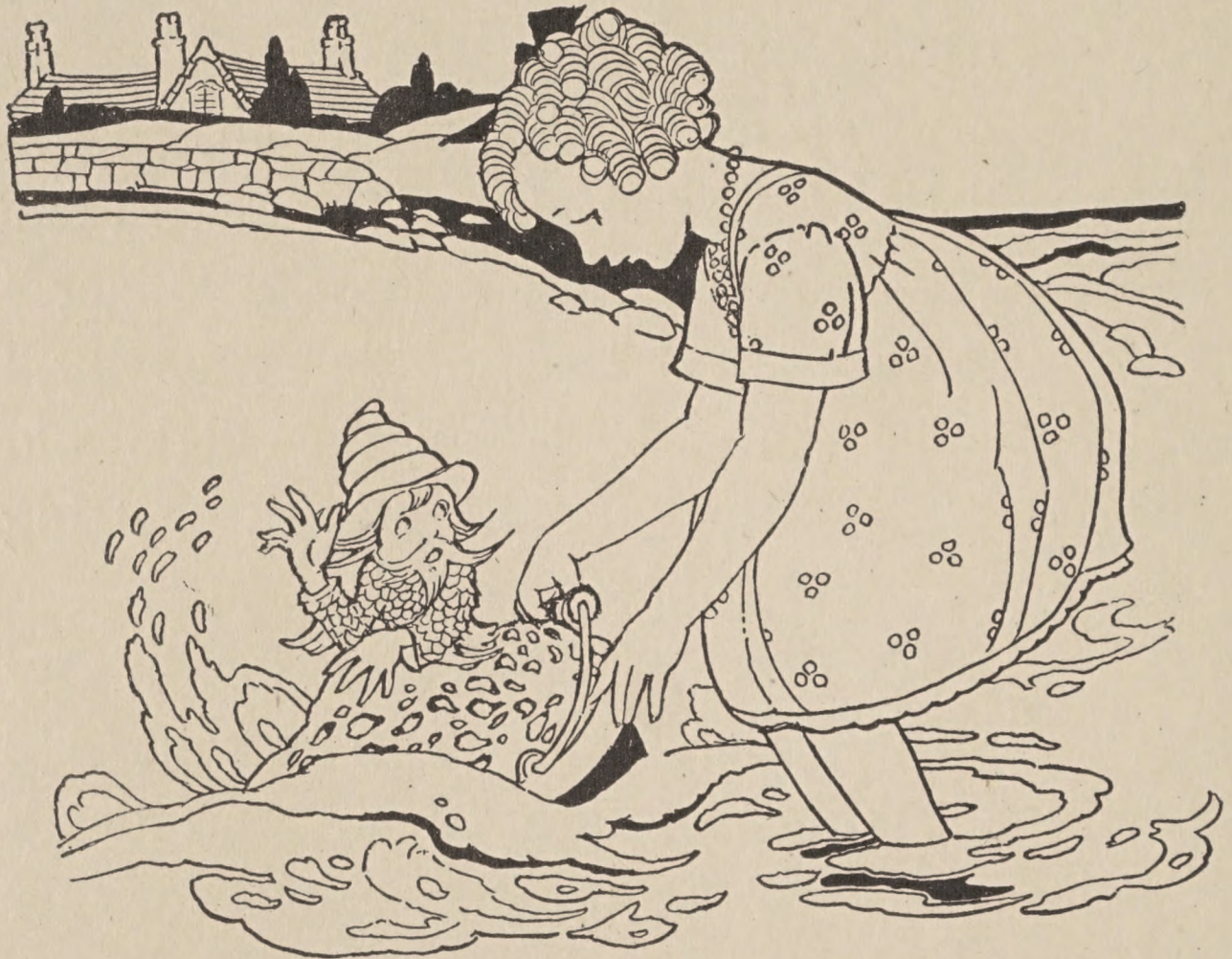
She carefully set the little old grandfather afloat

the water. There she carefully set him afloat, when he immediately began to swell