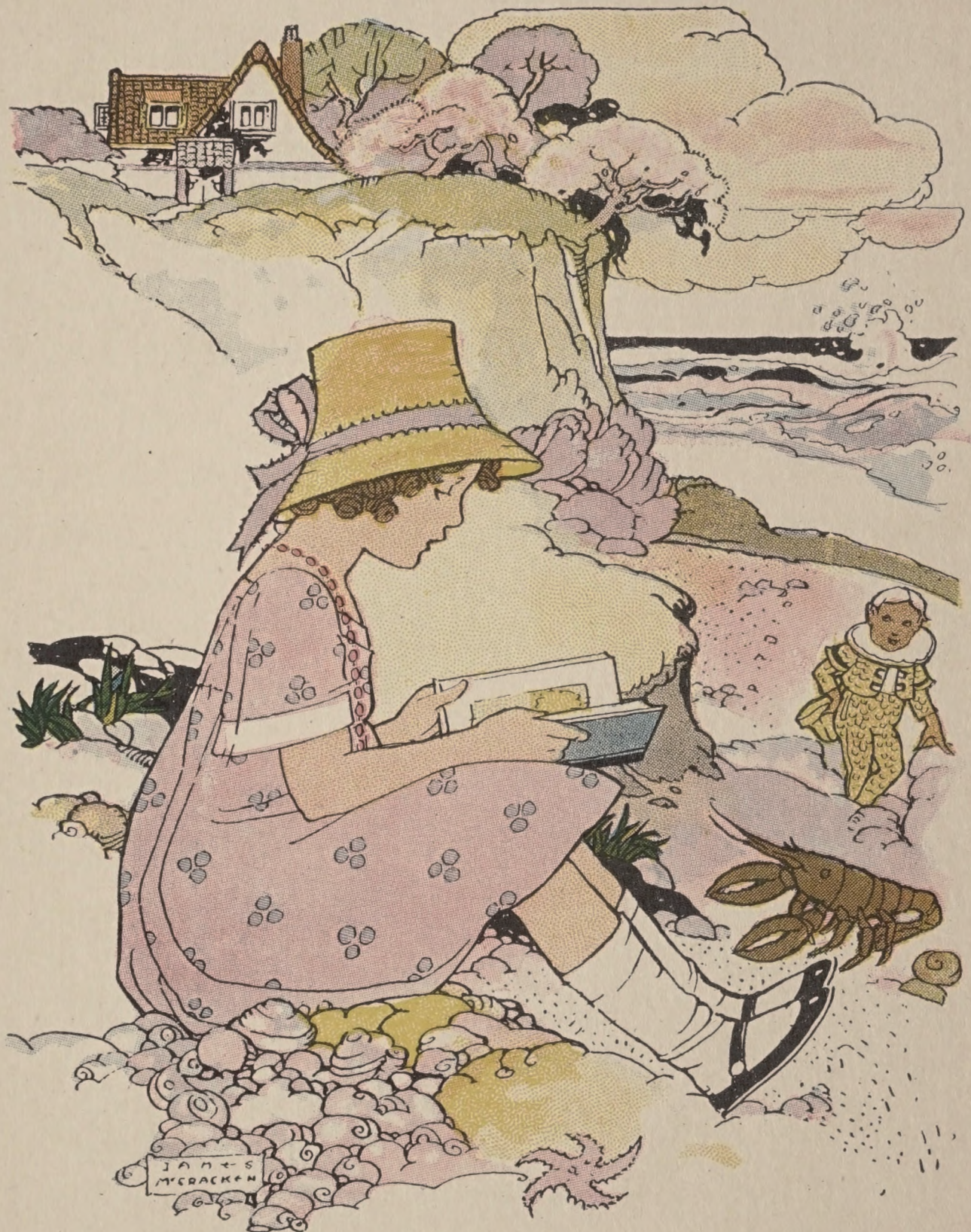
A funny little man was leaning against a pebble