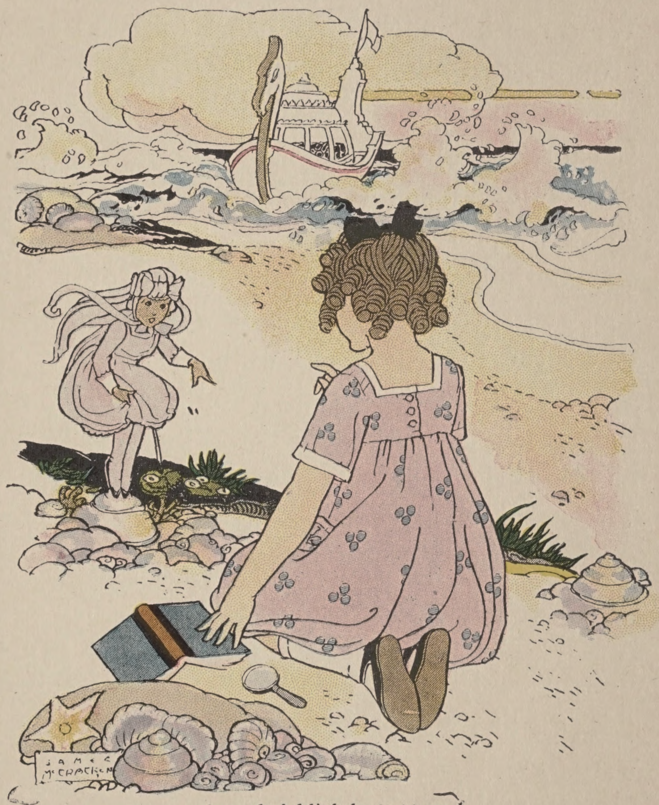
A wonderful little boat appeared