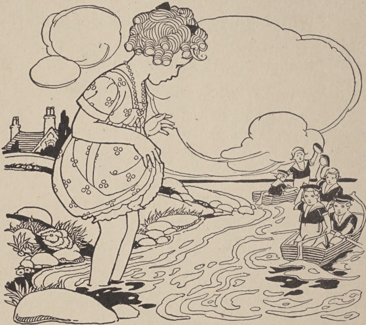
They all jumped into the little brown boats

“Well, what next?” said Daddy. “Do you think I am a walking encyclopedia?”