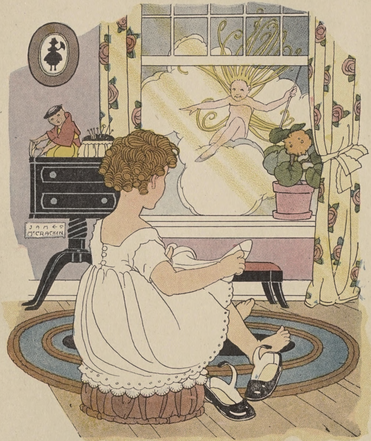
"I'll be dressed in a jiffy," said Loraine