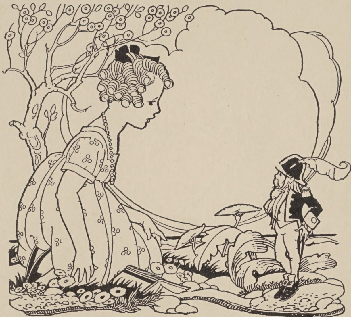
The Admiral stroked his long whiskers

“but from your tone I should think that it must be rather a bad place to go to.”