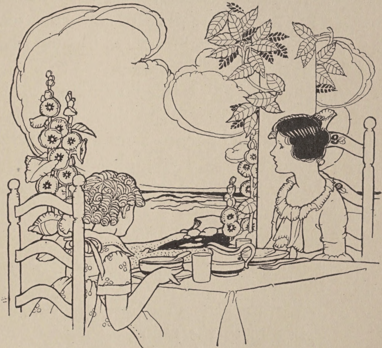
They were cozily seated at the breakfast table

“And happy, too, Mother dear,” said Loraine. “I think I’m just about the happiest little girl in the whole wide world.”