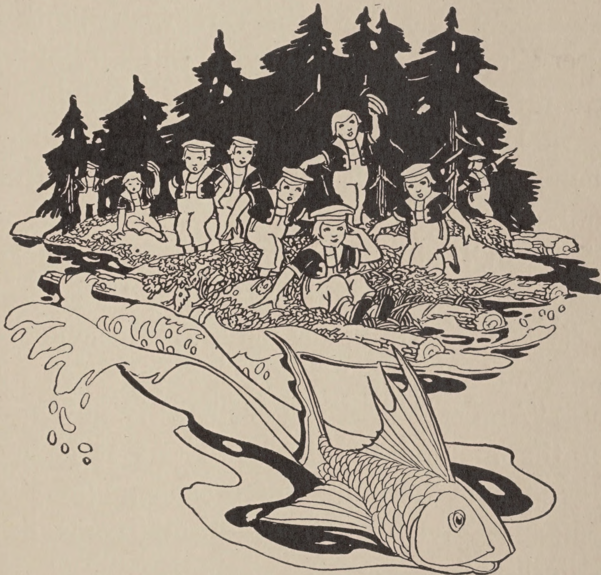
Around the point came a funny-looking raft

twice the size of the doormat, with seaweed all over it and funny-looking trees like scrub