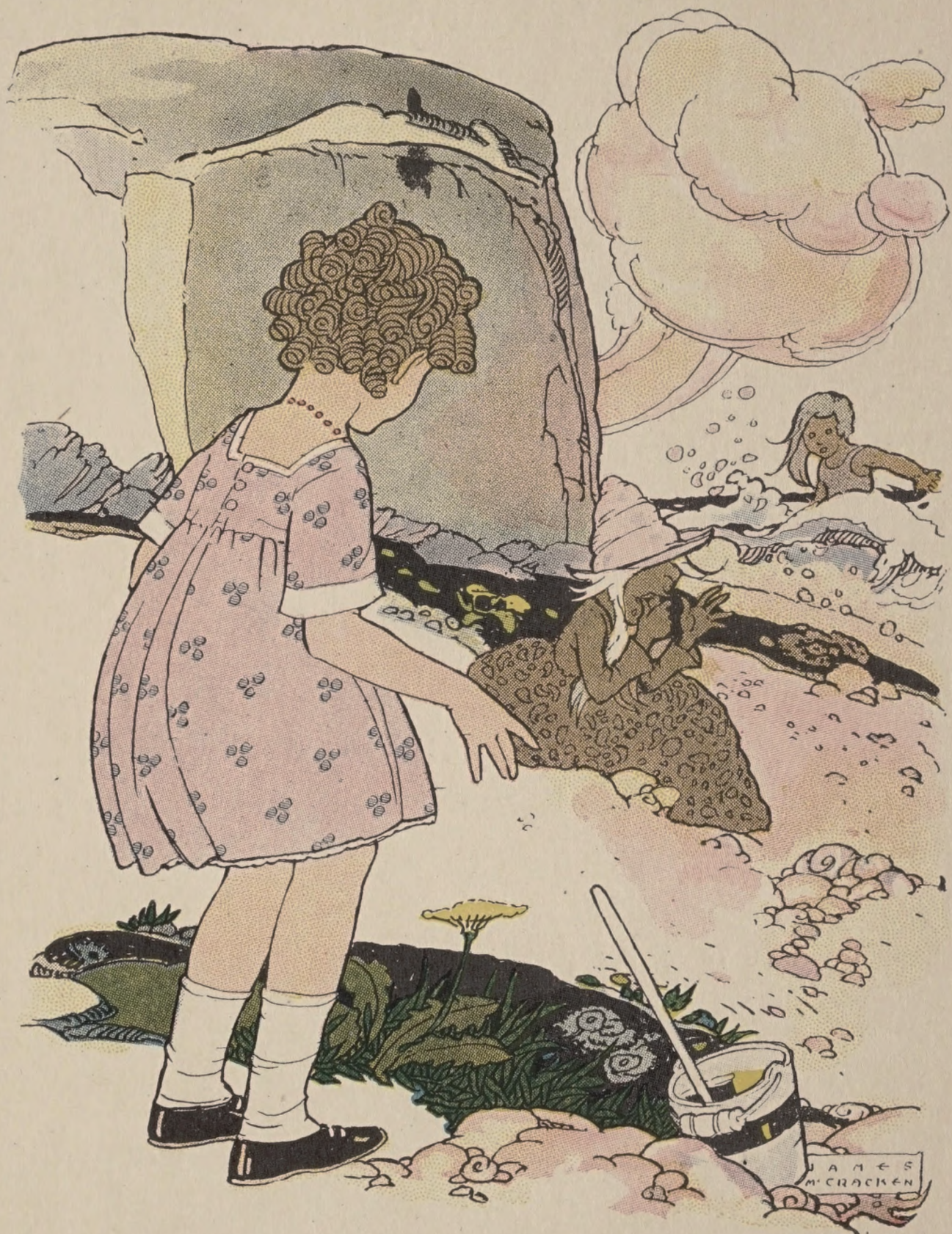
She found a whole flock of queer-looking Little People bobbing around on the water