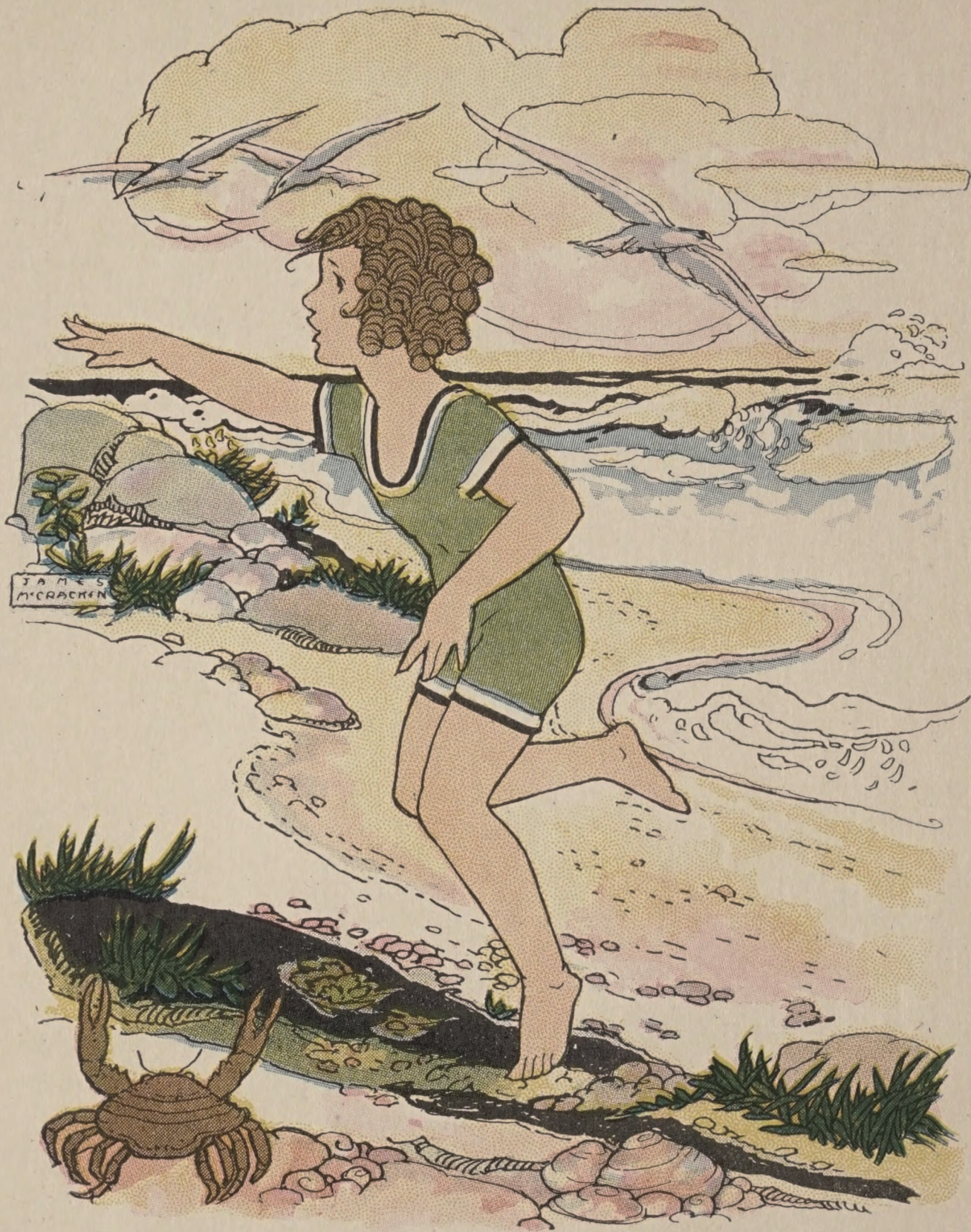
Lorraine ran lightly down over the sands