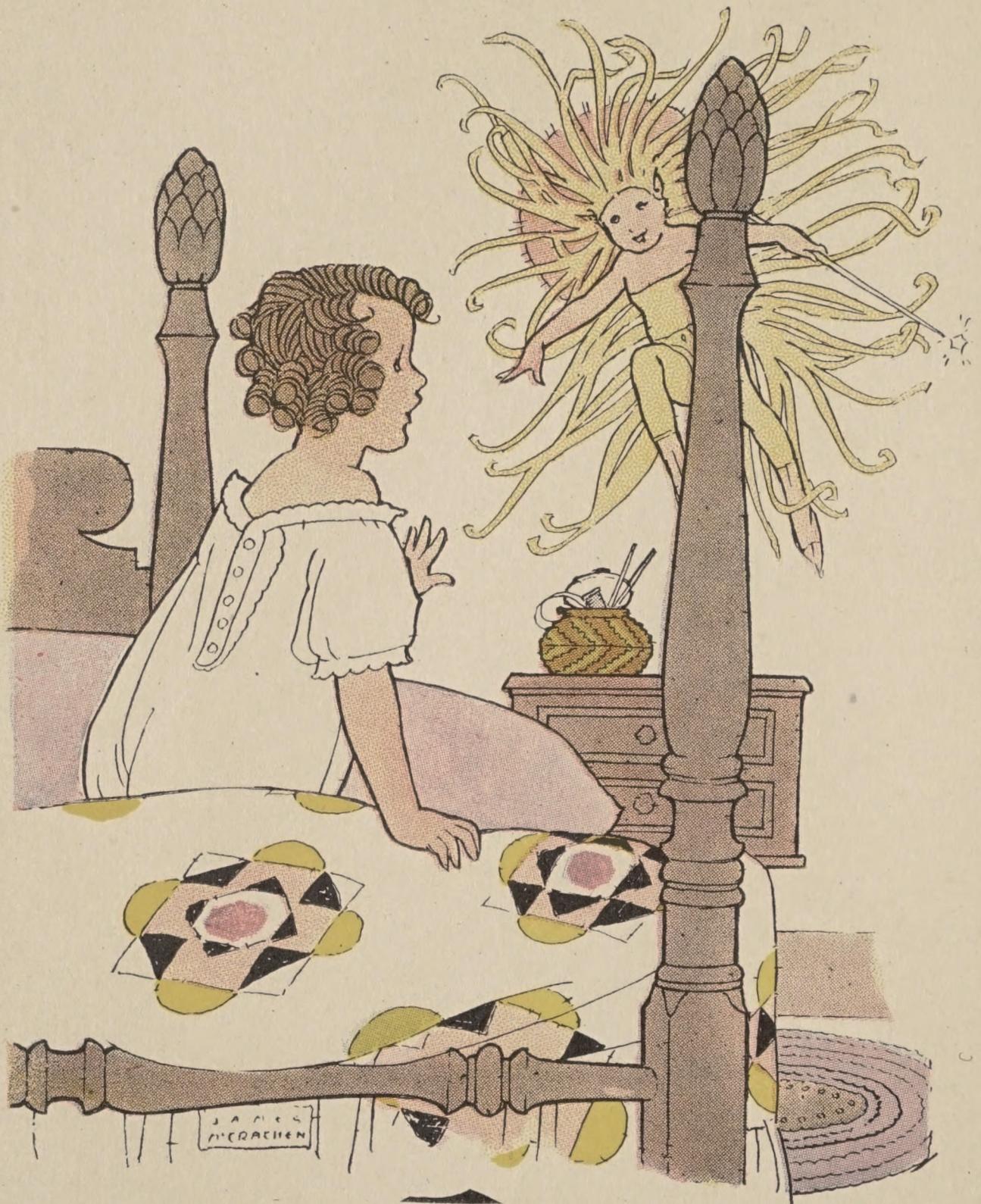
"Why, Sunbeam!" said Loraine, sitting up