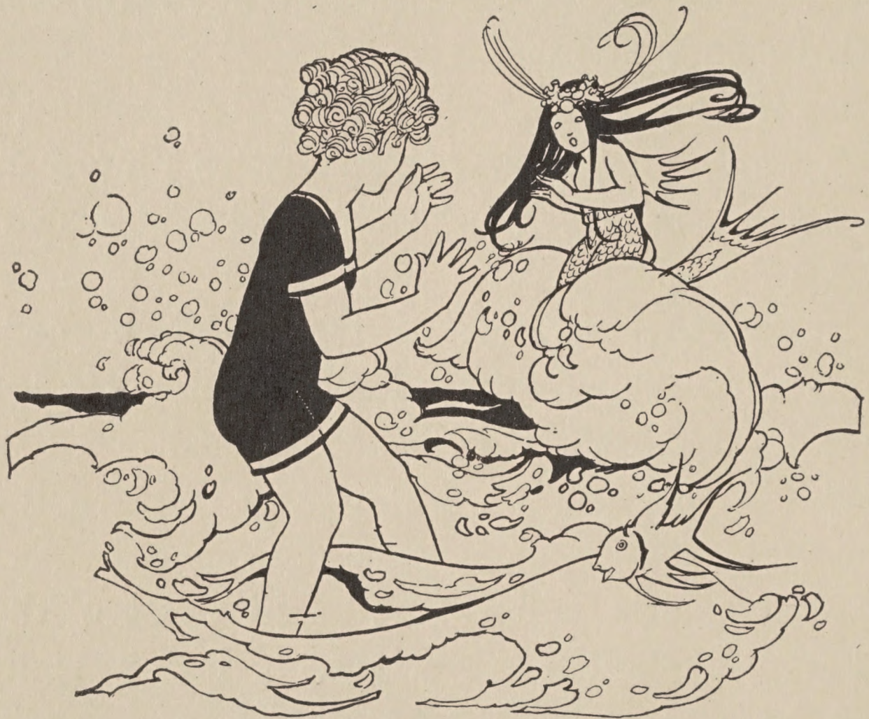
Crest o' the Wave clapped her tiny hands

my Little People to give you a demonstration. If you will watch them carefully, I am sure you will soon learn the strokes."