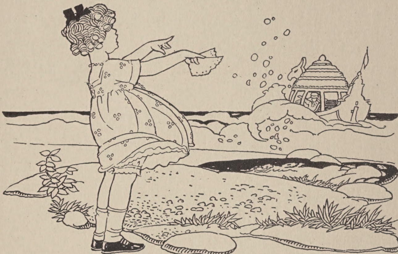
She waved her hand and was off like a flash

jumped aboard her little boat. "Good-by Loraine." She waved her hand and was off