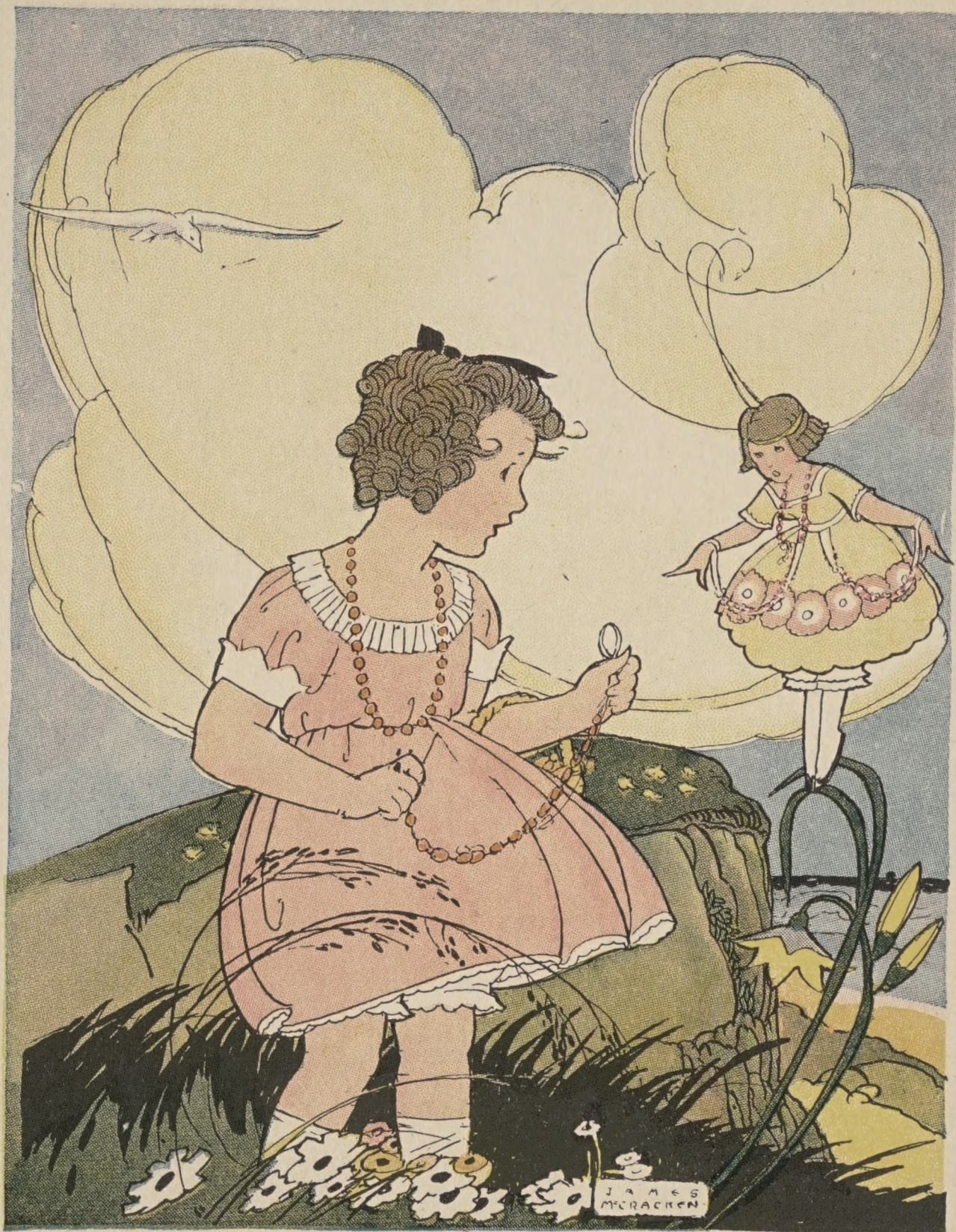
"Did you inherit your gown?" asked Loraine