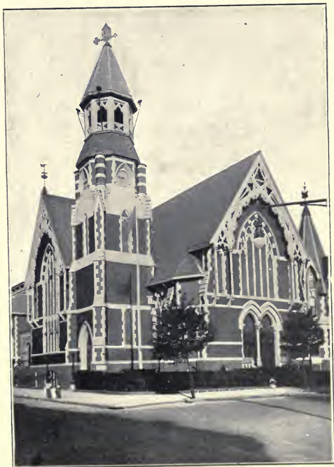
FIRST SPIRITUAL CHURCH AND PARSONAGE Brooklyn, N. Y.