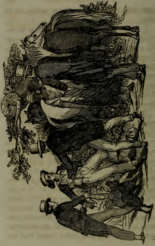
The author and his mother arrested and carried back into slavery.