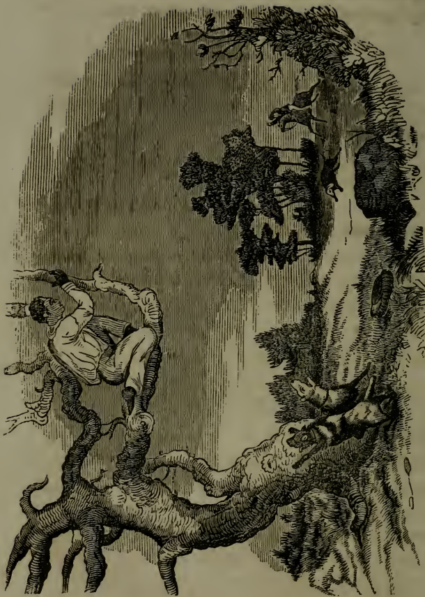
The author caught by the bloodhounds. (See p. 21.)