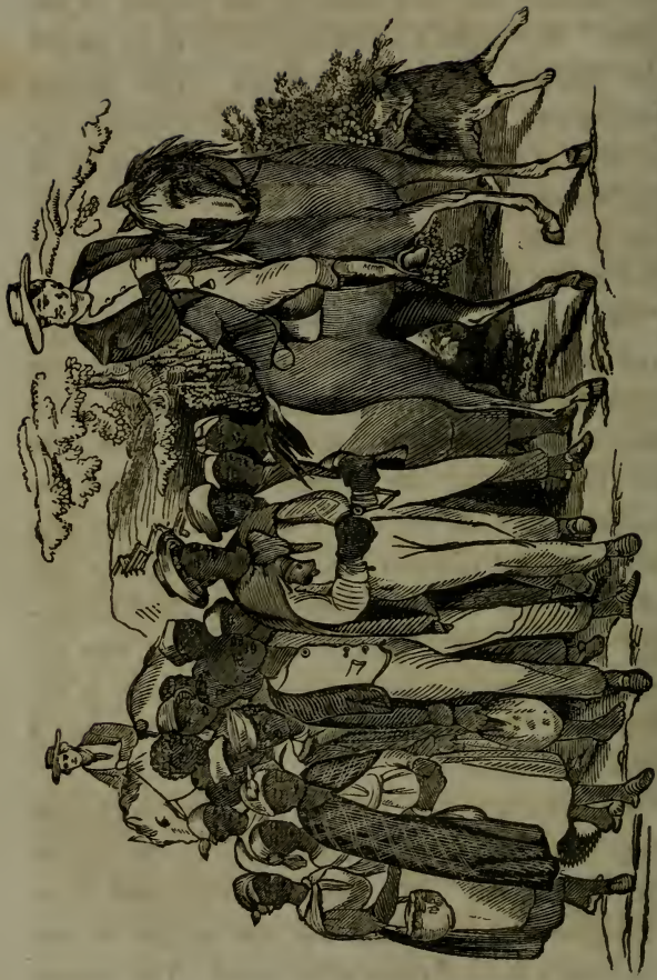
The slave-trader Walker and the author driving a gang of slaves to the southern market.