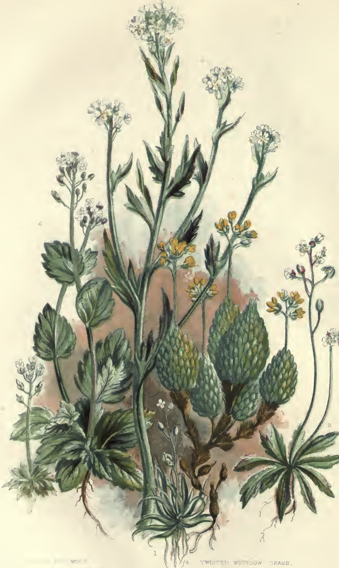
1. COMMON WHITLOW GRASS, Draba cuneata . 2. TWISTED WHITLOW GRASS, Draba inermis . 3. SPREAD-LEAVED WHITLOW GRASS, Draba nemoralis . 4. ROCK WHITLOW GRASS, Draba repens . 5. ... 6. ...