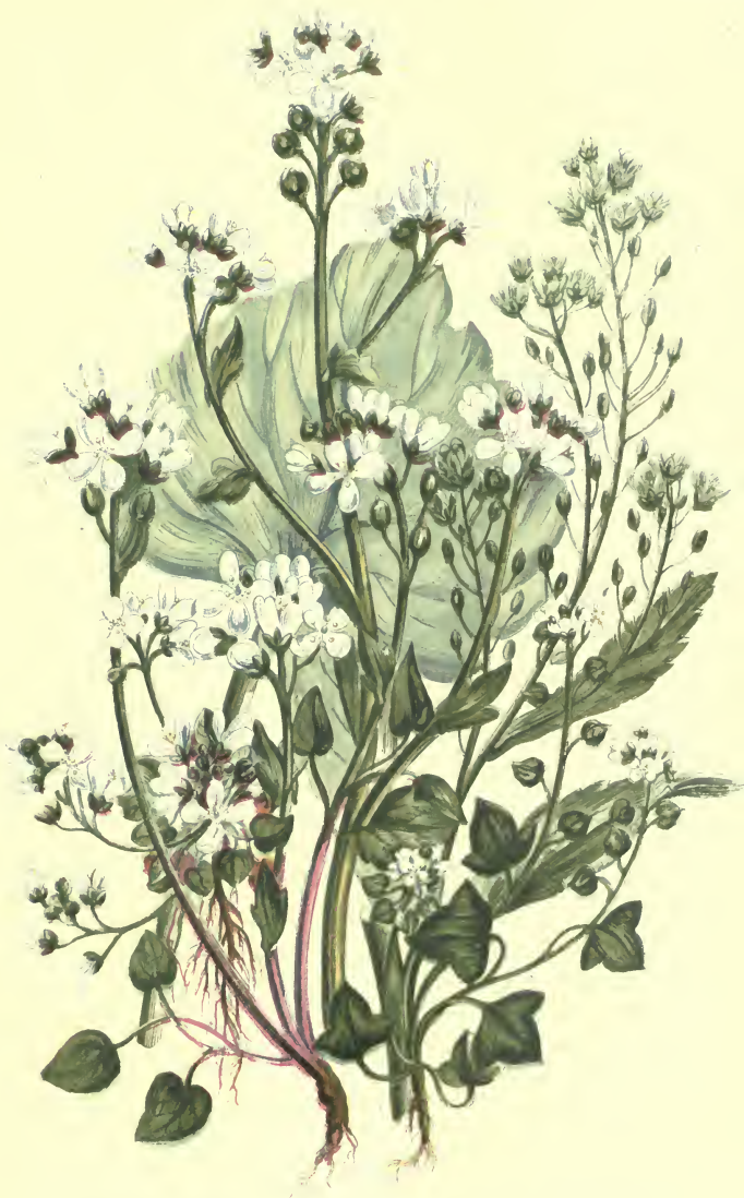
Primula veris L. Common Primrose Cultivated in the garden