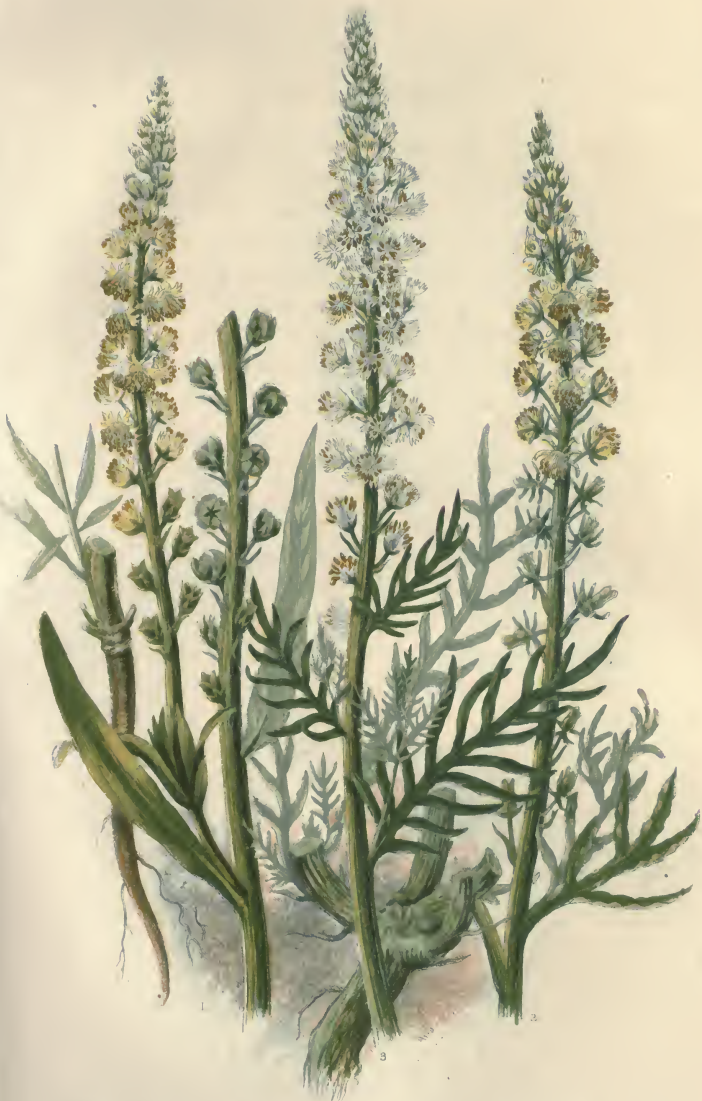
1. GARDEN ROCKET YELLOW WEED