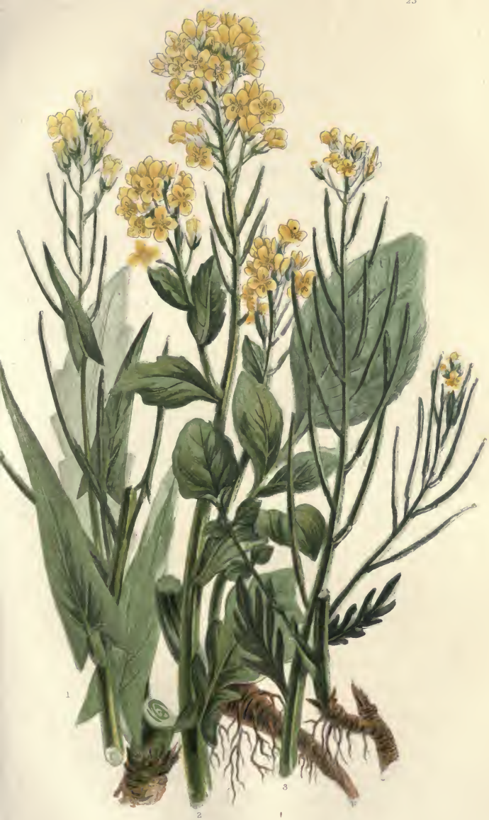
1 MIDDLE YELLOW MUSTARD,