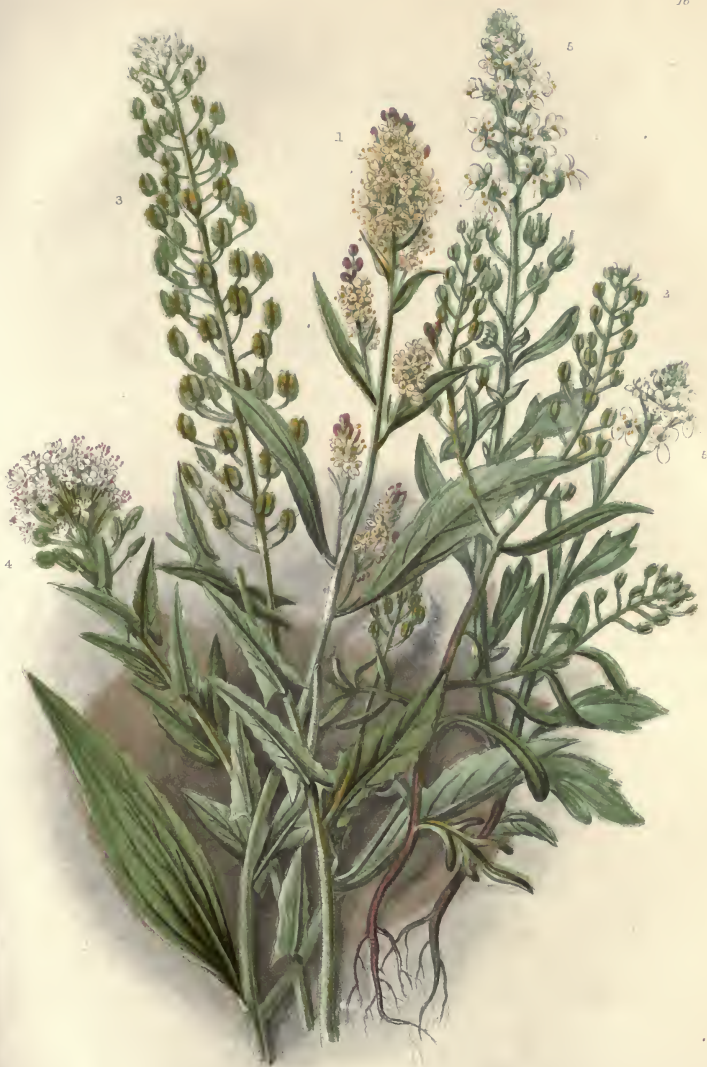
1. BROAD LEAVED PEPPER WORT.