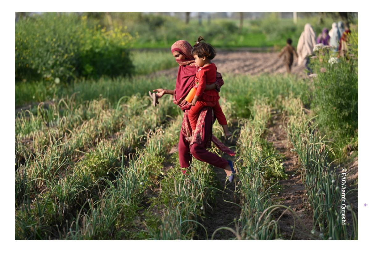
PAKISTAN – A woman holds her daughter as she arrives to work at a vegetable field.