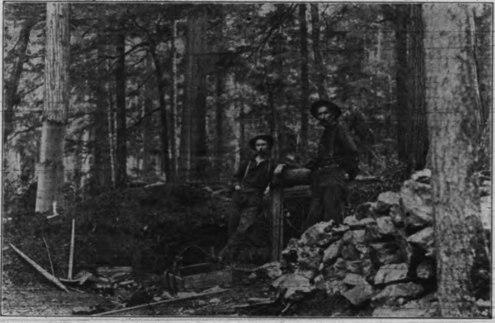
MARQUIS AND GILBERT'S CLAIM, POPLAR CREEK.

commercial benefits derived by local business men on account of the neighborhood of the sailors, but on account of the opportunity of witnessing what an important factor the fleet was for the protection of trade and commerce. The British navy was the bulwark of Britain's trade. Without the control of the sea the Empire would be impossible, Britain had a greater foreign trade than any two nations of the world. It was almost impossible to conceive of the vastness of her commerce. It should be remembered, however, it was only made possible through her supremacy on the sea. If the navy were defeated there would be a stupor of poverty in Great Britain and the colonies. It was therefore fitting to commemorate the name of the sailor who did most towards laying the foundation of this supremacy. Nelson in his victories at the Nile and at Trafalgar established Great Britain's right to be called "Queen of the Seas."