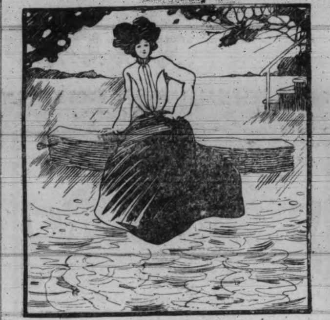
In yesterday's puzzle, by using the upper part of the picture as base, the alligator is found to the right, just below the branch of the tree. By using the upper left corner as base, the elephant is found in the upper corner.

WING ON PIONEER Intelligence Bureau. 24 COLIMORANT STREET. CONTRACTOR OF CHINESE LABOR.