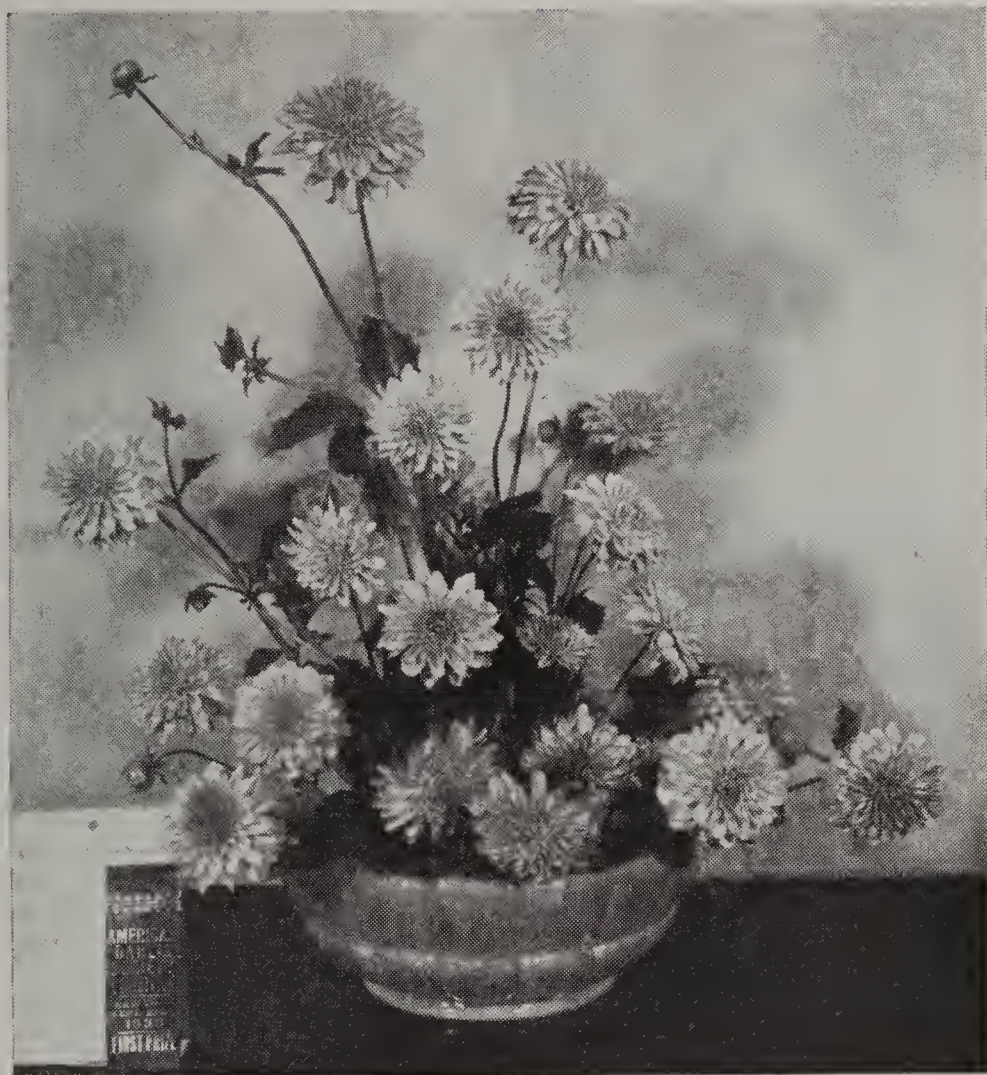
BABY FRANCIS Miniature Decorative

such abundance as to almost hide the bush. The color is amaranth with perhaps a suggestion of deep orchid. The demands for it have far exceeded our greatest expectations and we are now far sold out of roots for 1938. We will have only a limited number of plants.