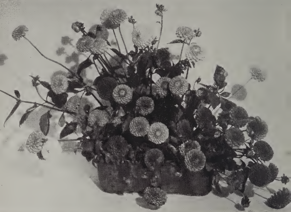
A prize winning show arrangement of Pompons