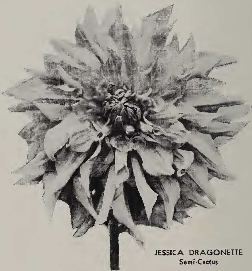
JESSICA DRAGONETTE Semi-Cactus

JESSICA DRAGONETTE (S. C.) Our 1935 introduction which has made good throughout the country. Named in honor of this most charming and petite radio star at the 1934 A. D. S. exhibition in New York. The christening was made over the air in opening the show. Miss Dragonette said in part: "I have always admired Dahlias, but never expected to have one named after me. And now to have one of such exquisite beauty named for me, is an honor I appreciate deeply."