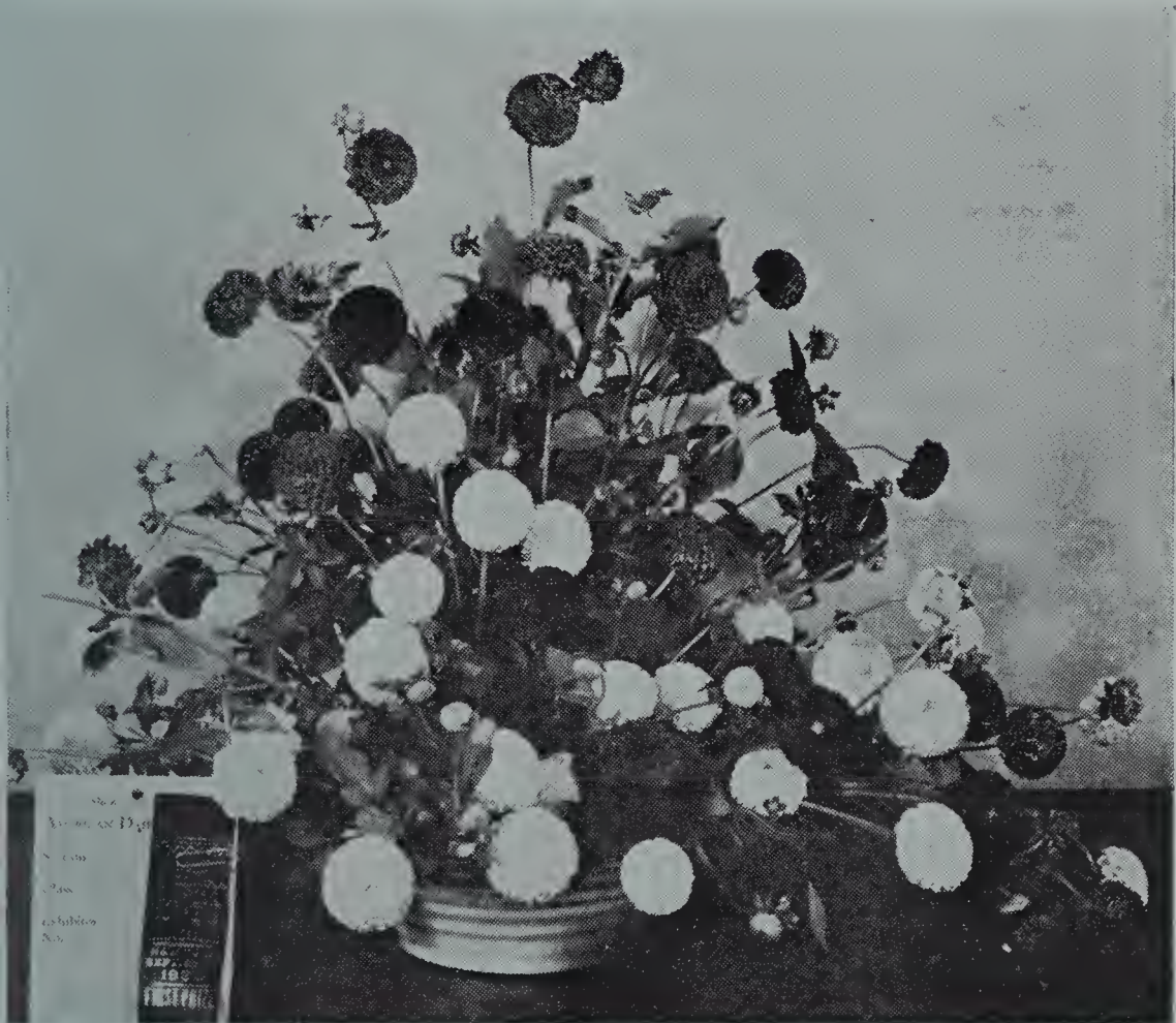
A prize winning arrangement of Pompons featuring SHERRY and SNOWCLAD