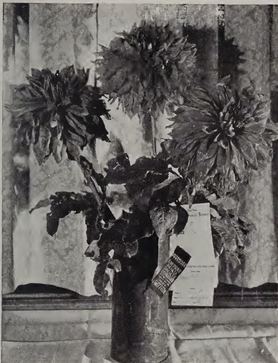
HUNT'S VELVET WONDER Informal Decorative

WATCHUNG GIANT (I. D.) This we consider the most outstanding of all the 1937 introductions. Its record as a prize winner is an enviable one. The color is light clear yellow with suffusions of rose. Despite its extreme size it has no appearance of coarseness.