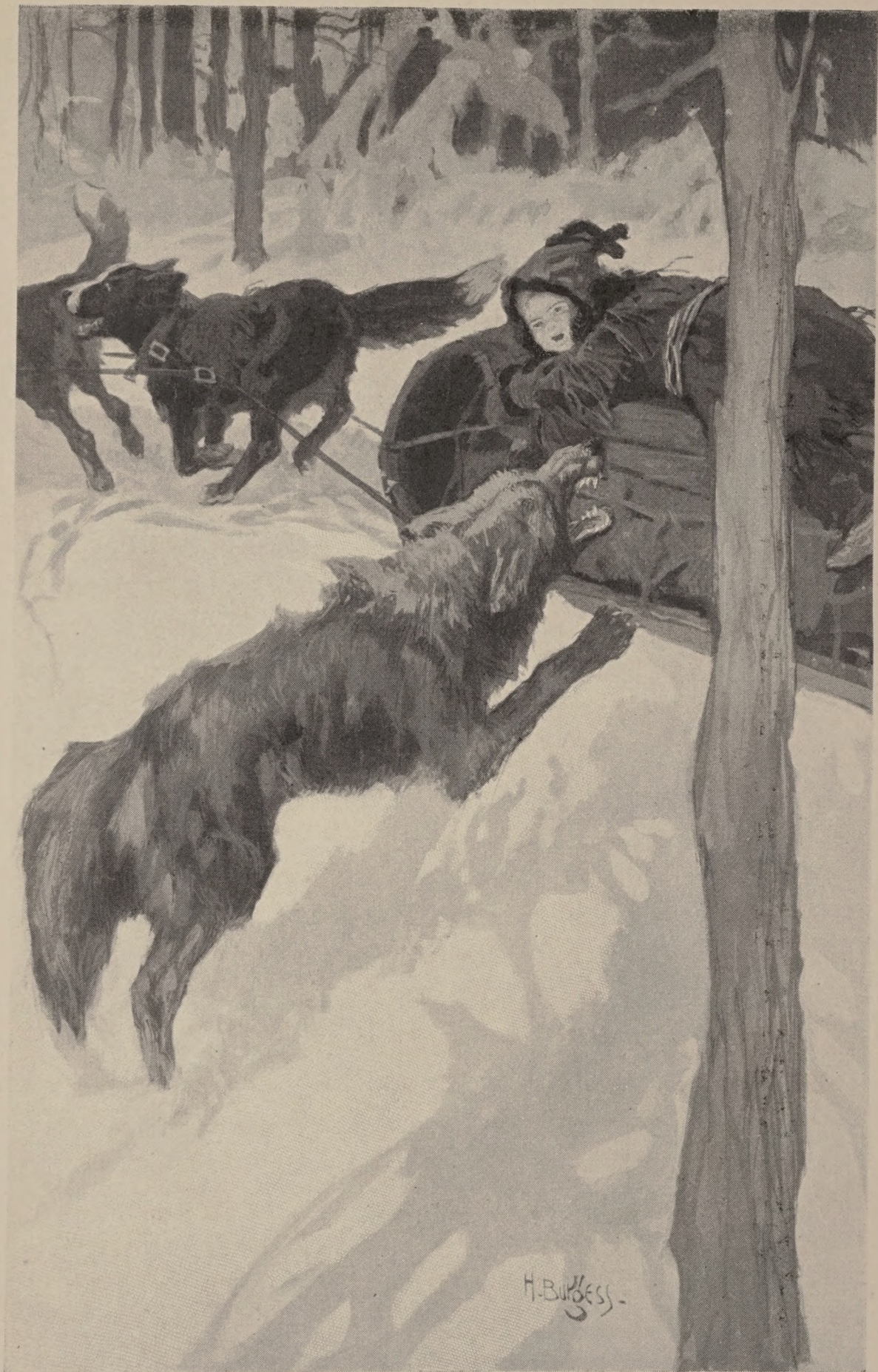
"THE LARGEST WOLF I EVER SAW . . . CAME JUMPING STRAIGHT FOR OUR LITTLE MASTER"