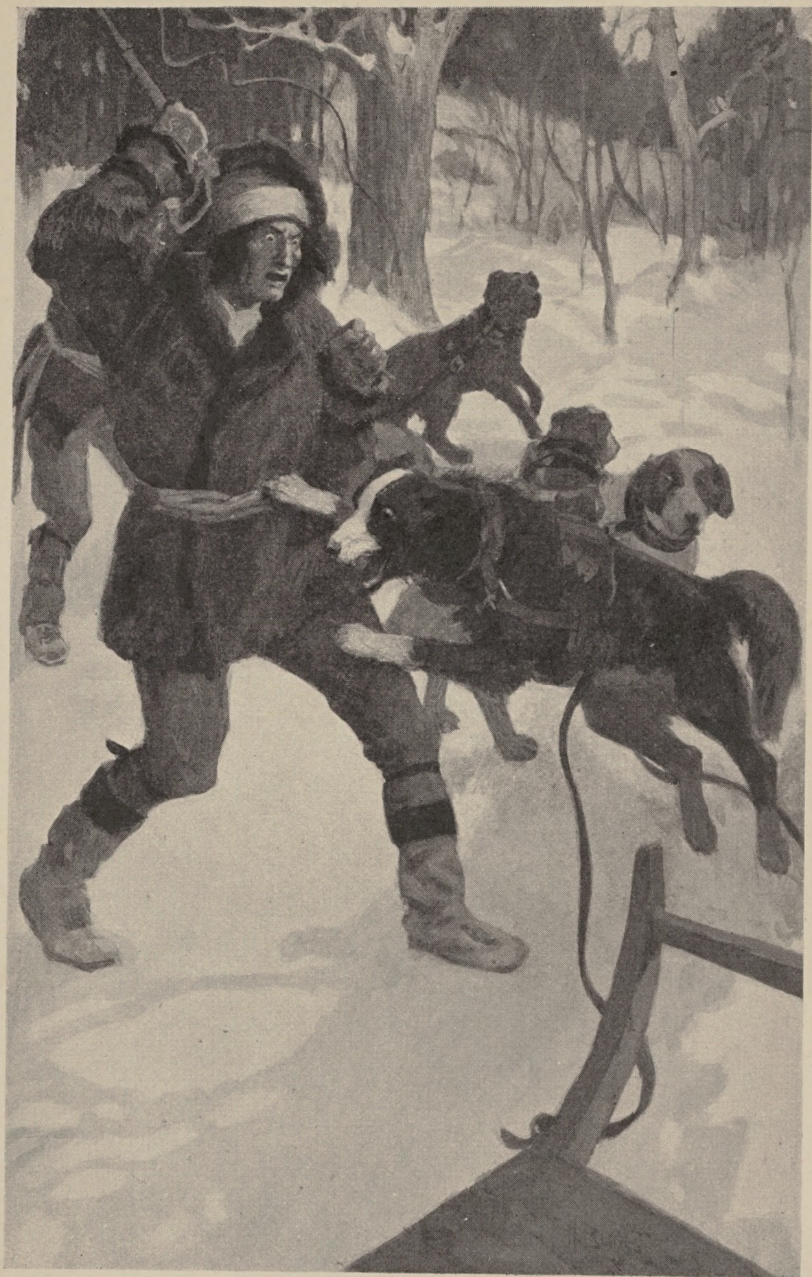
"HE SUDDENLY SPRANG AT HIM"