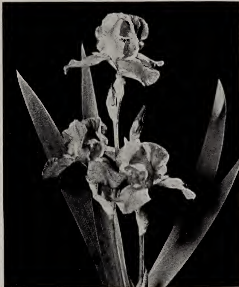
"Excellent Form" Tall Bearded Iris

CAMELIARD (Sturtevant). A very unusual and beautiful blend of yellow and wine color. The flowers are very large, seven inches, and are borne on well branched stems. One of the most distinct of recent introductions. It has been an outstanding favorite with the visitors to our gardens. 4 ft. .... 3 for $2.50; each $1.00