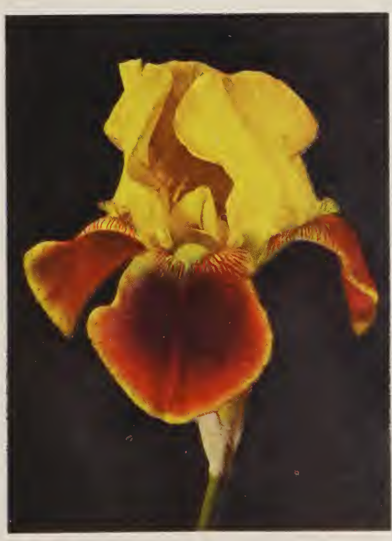
SEE PRIZE-WINNING COLLECTION