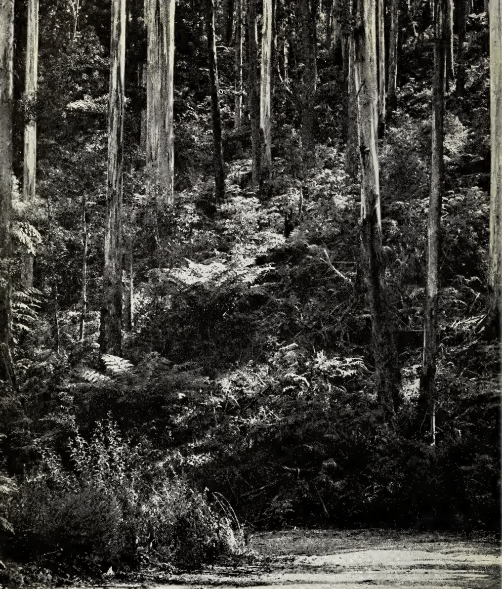
Stand of Messmate Stringybark and Manna Gum—Mt. Cole State Forest.