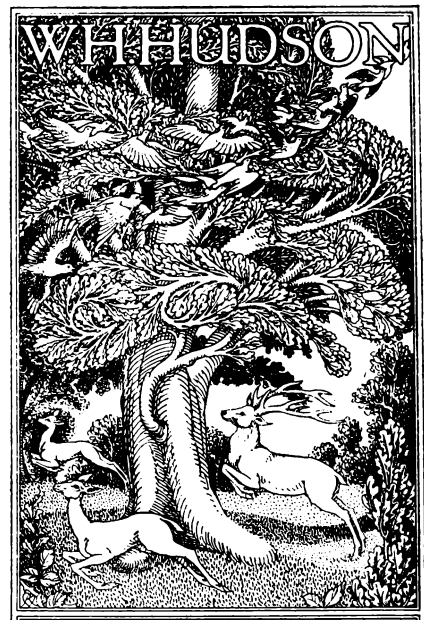
Born on the South American Pampas Natus Circa 1846 & Obiit London, 1922