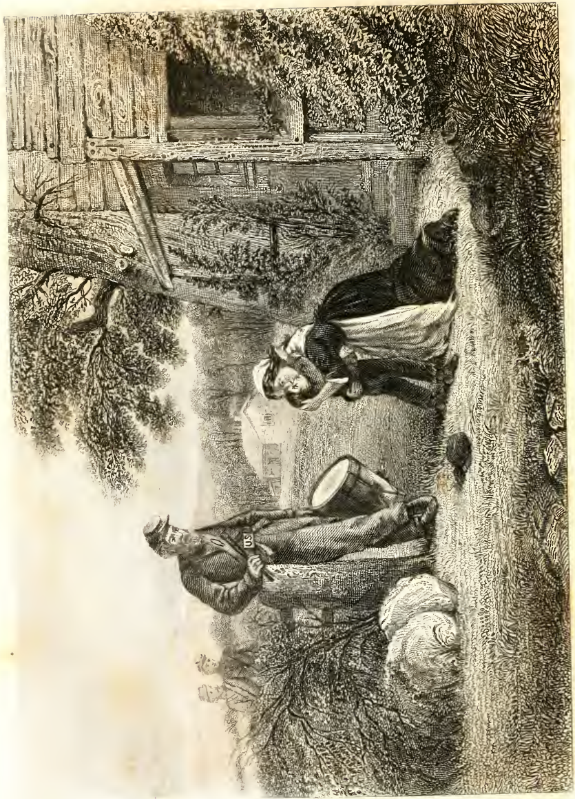
THE SOUTHERN SOLDIER