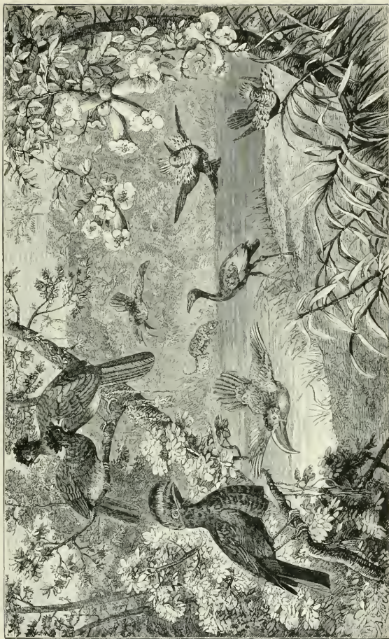
A FOREST SCENE ON THE UPPER AMAZON, WITH SOME CHARACTERISTIC BIRDS