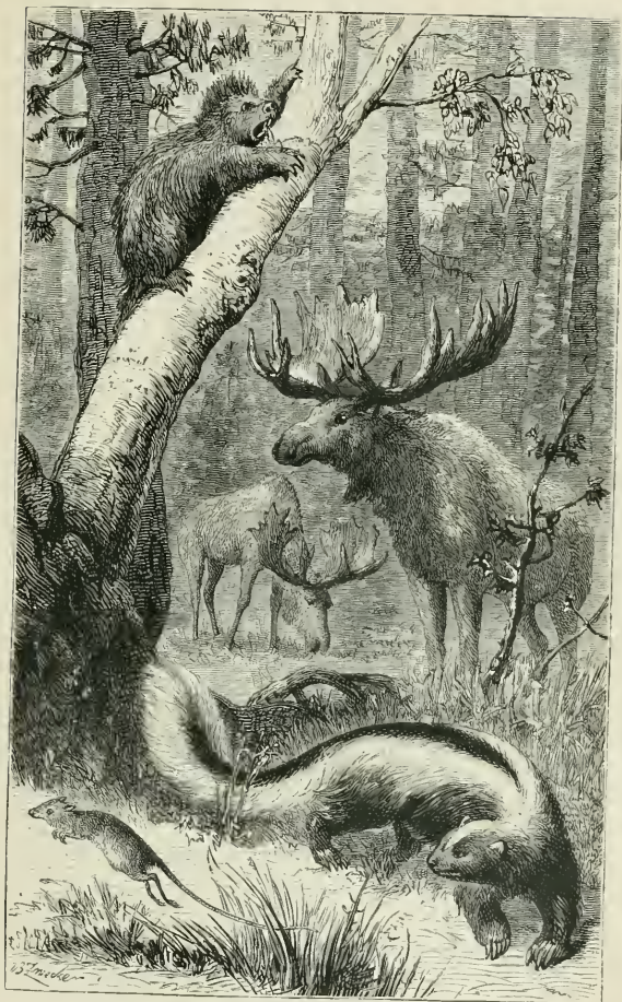
A CANADIAN FOREST, WITH CHARACTERISTIC MAMMALIA.