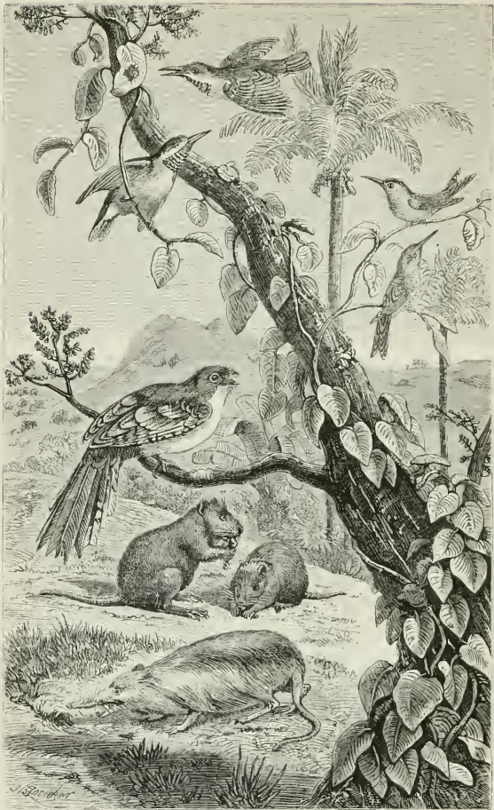
A SCENE IN CUBA, WITH CHARACTERISTIC ANIMALS