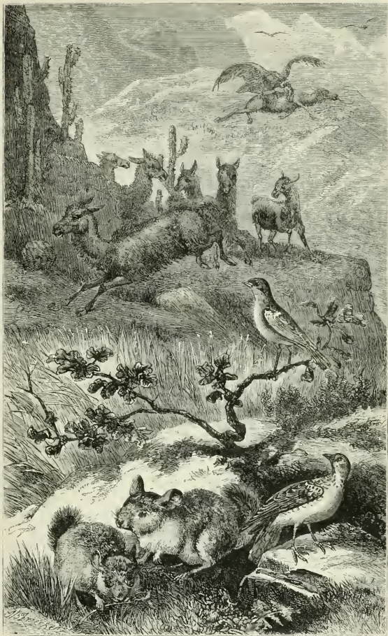
THE CHILIAN ANDES, WITH CHARACTERISTIC ANIMALS.