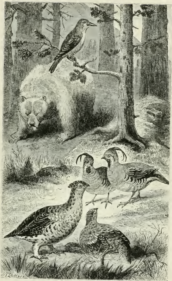
SCENE IN CALIFORNIA, WITH SOME CHARACTERISTIC BIRDS.