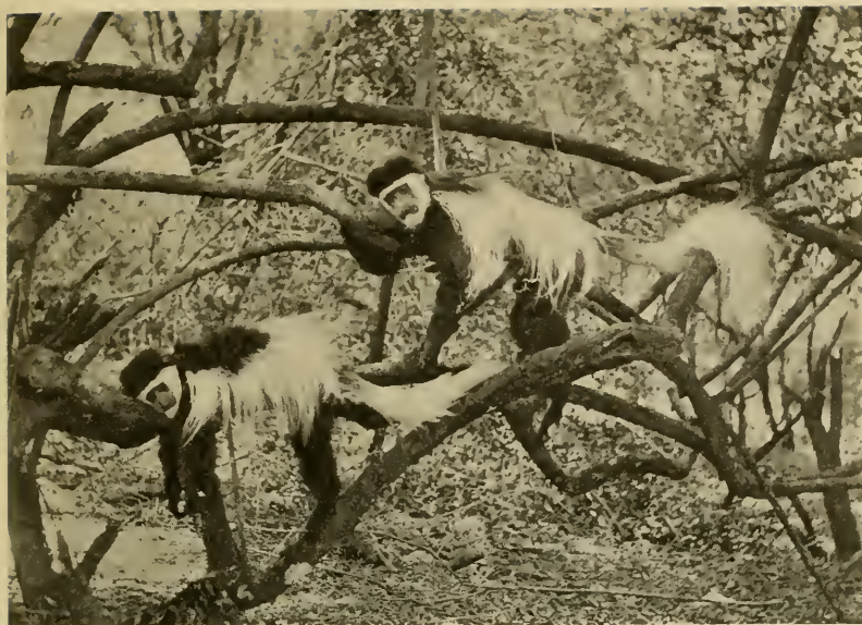
ORDINARY COLOBUS MONKEYS.