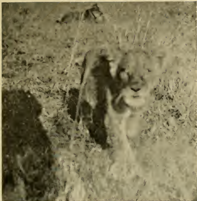
YOUNG LION WALKING TOWARD THE CAMERA.