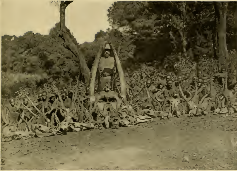
SOME OF THE AUTHOR'S TROPHIES AT KIJABE R. R. STATION IN 1906. Note the relative size of the elephant tusks.