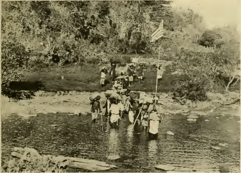
THE ADVANCE GUARD OF THE CARAVAN CROSSING A RIVER ON THE WAY TO SOTIK.