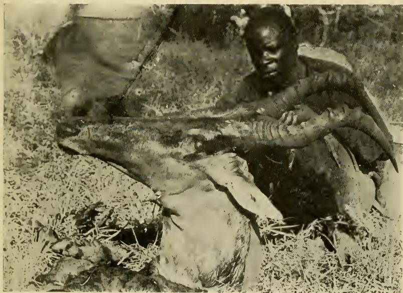
AN EXCEPTIONALLY FINE HEAD OF JACKSON'S HARTEBEEST, SHOT NEAR LAKE HANNINGTON.