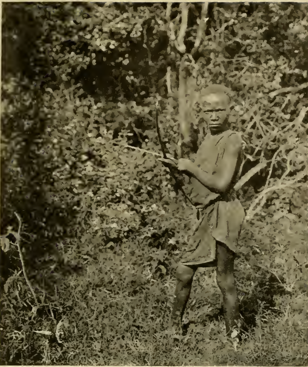
A YOUNG WANDEROBO, READY TO SHOOT HIS POISONED ARROW.