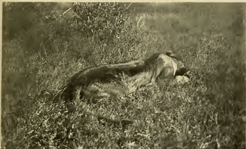
LIONESSE KILLED ON THE ATHI PLAINS.