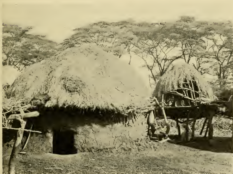
HUT OF THE NJAMUS-NASAI NEAR BARINGO.