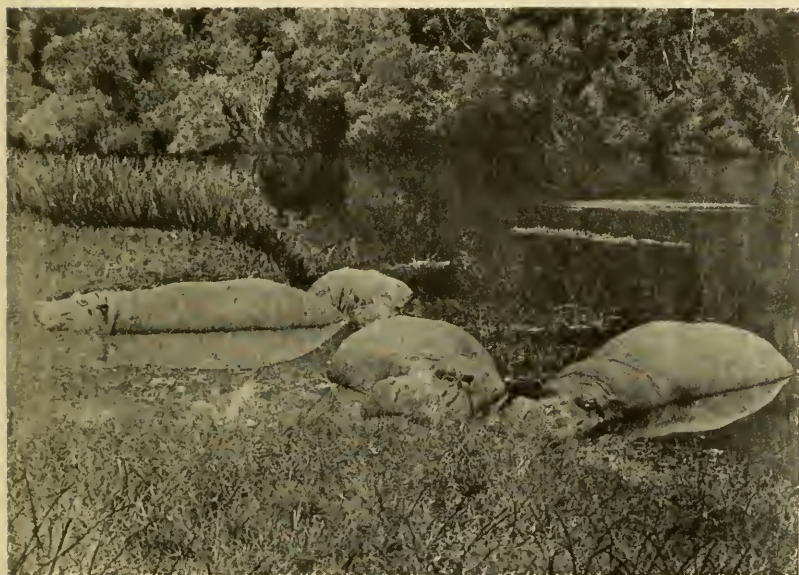
SLEEPING HIPPOS IN THE TANA RIVER NOT FAR FROM FORT HALL.