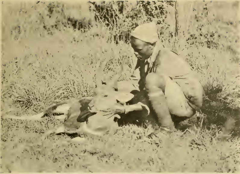
ORDINARY BUSH BUCK, SHOT ON ABERDARE MOUNTAINS.