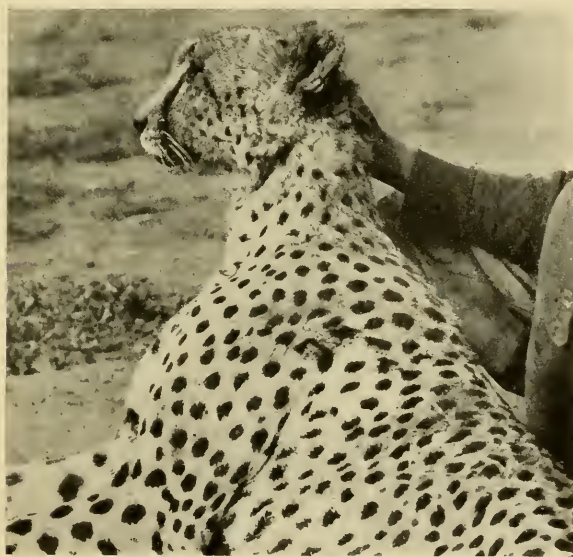
HUNTING LEOPARD, KILLED BY A SHOTGUN WITH NO. B. B.