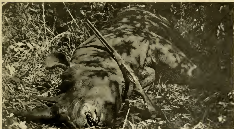
ANOTHER SPLENDID TROPHY.

The upper one represents the bush rhino, the lower one the rhino of the plains. Note the difference in the shape of the lips and relative position of the eyes. The little "extra horn" between the two horns of the upper rhino is, of course, unusual.