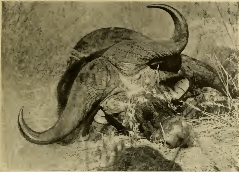
A MAGNIFICENT BULL BUFFALO, KILLED IN THE KEDONG VALLEY.