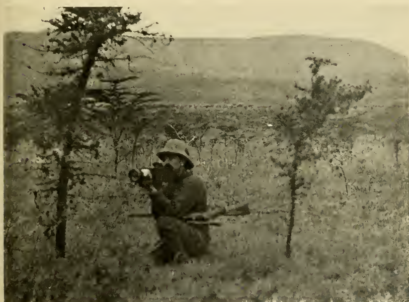
PHOTOGRAPHING A CHARGING ANIMAL.

They became so tame that the author could walk up to them within a few yards before they would stroll away, as seen in this picture.