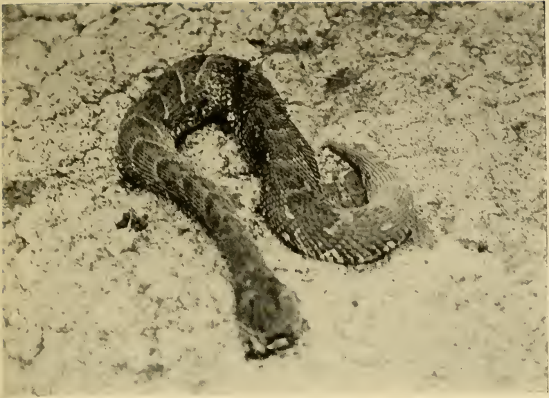
THE DEADLY PUFF ADDER.