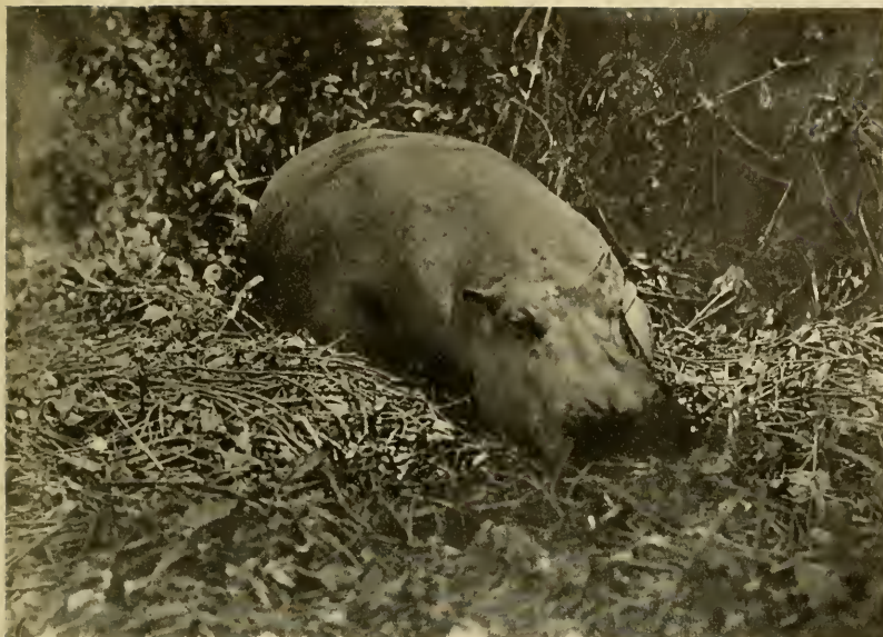
SLEEPING HIPPO, PHOTOGRAPHED CLOSE TO THE SONDO RIVER, 1909.