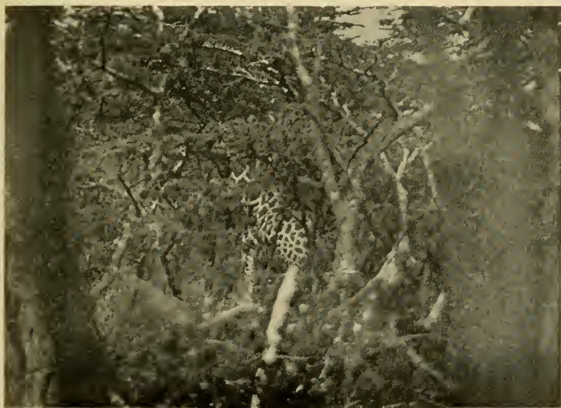
BULL GIRAFFE IN THE MIMOSA JUNGLE ON LAIKIPIA.

Note how his bright coloring blends perfectly with the sunlight and shadow in the landscape.