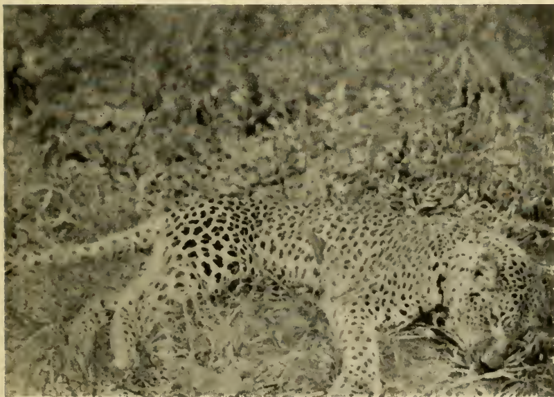
YOUNG MALE LEOPARD.