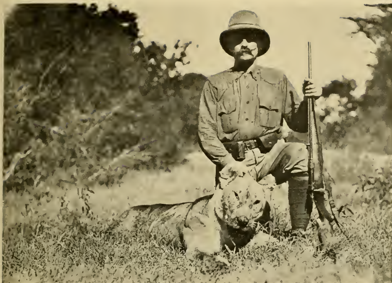
THE LIONESSE WHICH ALMOST KILLED THE AUTHOR. Shot on the Sotik, 1909.