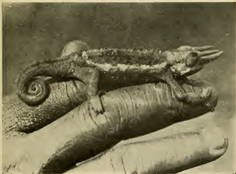
A THREE-HORNED, SMALL, TREE LIZARD.