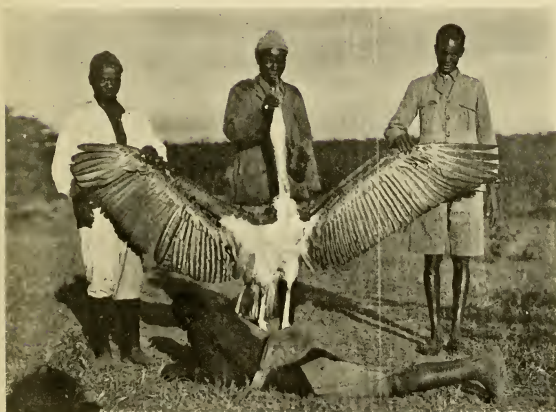
HUGE MARABOU STORK.

Compare the size of the large porter on the ground with that of the bird.