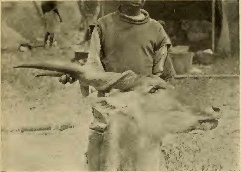
HEAD OF A LARGE BULL ELAND.