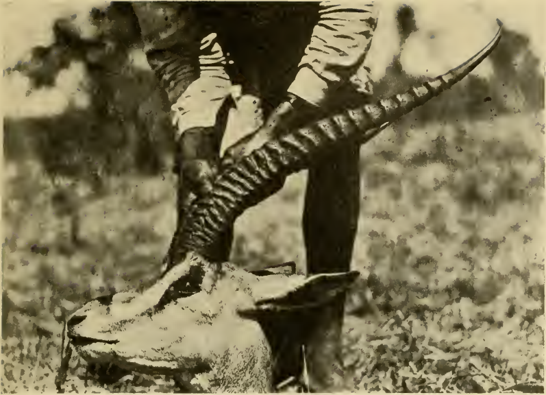
FINE HEAD OF THE GRACEFUL GRANT'S GAZELLE.