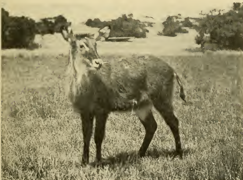
SEMI-TAME FEMALE WATER BUCK NEAR THE SOTIK PLAINS.

Found to be a new subspecies of the defassa family and subsequently called " Cobus defassa tjaderi ."