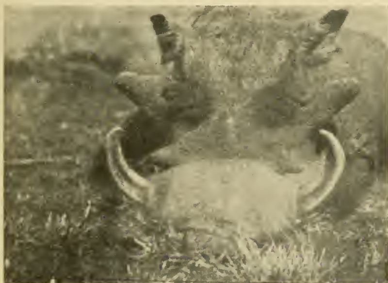
LARGE WART HOG, SHOT IN THE KEDONG VALLEY.