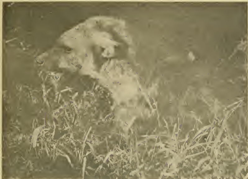
HYENA AT BAY.