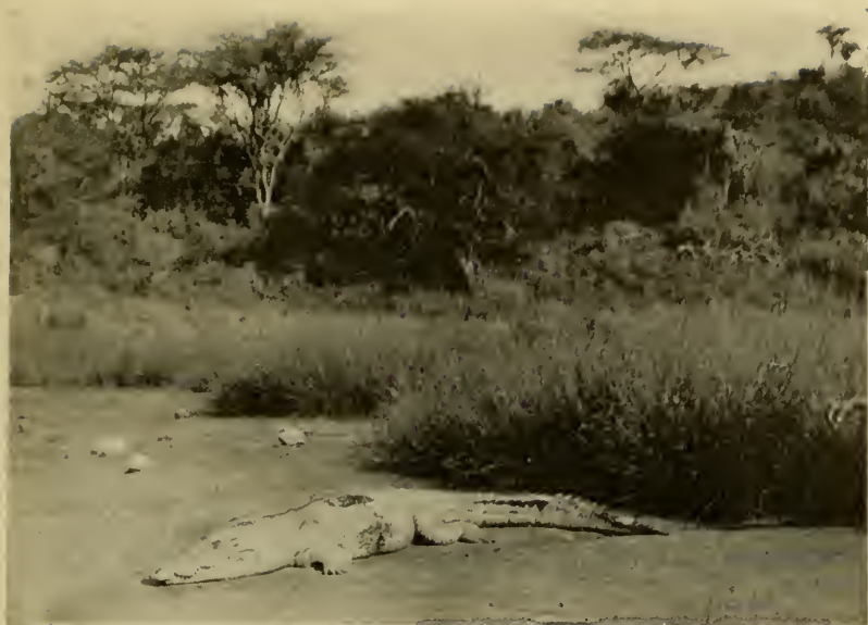
CROCODILE, SHOT AT LAKE HANNINGTON. It had just devoured two pink flamingoes.