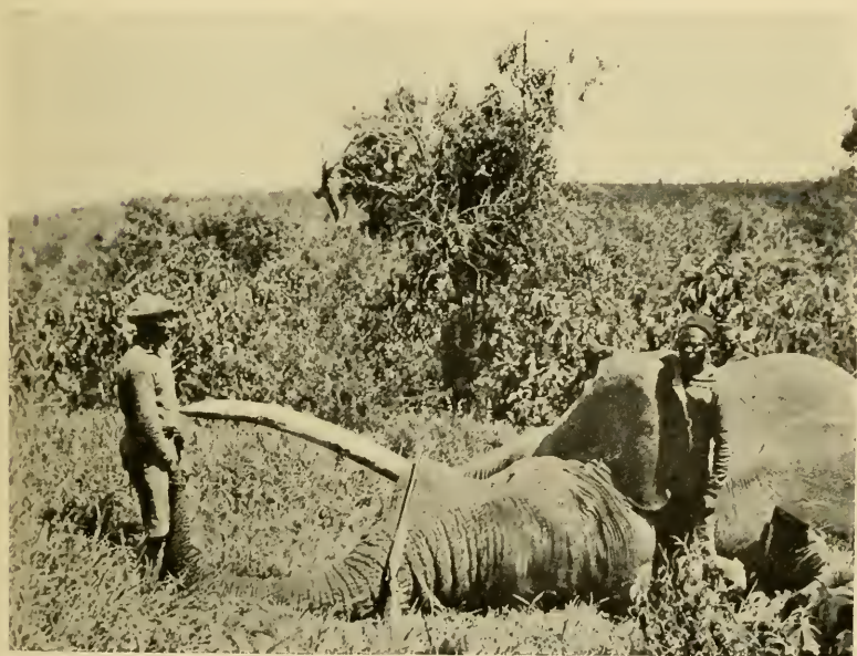
A SPLENDID TROPHY: A BIG BULL ELEPHANT KILLED NEAR THE GAJITO MOUNTAINS, 1906.

The head is now in the New York Zoölogical Park. It is said to be the largest mounted elephant head on record and weighs 1,750 pounds.