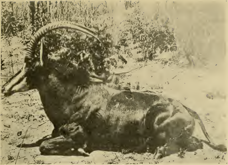
WOUNDED SABLE ANTELOPE.