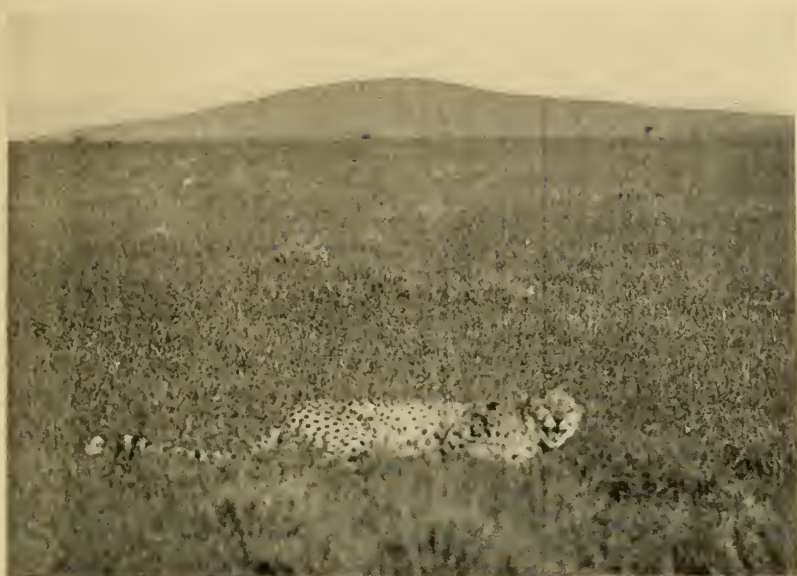
WOUNDED LEOPARD ON THE SOTIK PLAINS.