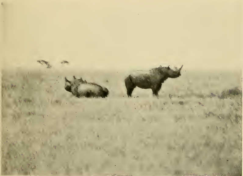
THE SAME ANIMALS. Note the tick birds on the backs of the beasts.