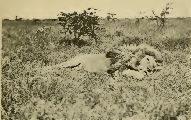
LARGE, BLACK-MANED LION KILLED ON THE SOTIK PLAINS, MAY, 1909.