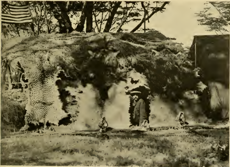
AUTHOR'S "LION CAMP" ON THE SOTIK.