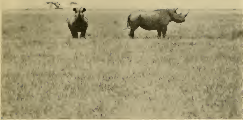
THE SAME ANIMALS.

The one facing the camera is about to charge at full speed.