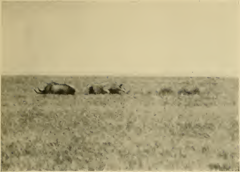
TWO RHINOS ASLEEP ON THE PLAINS TO THE NORTHWEST OF GUASO NAROK, DISTANCE ABOUT FORTY YARDS.