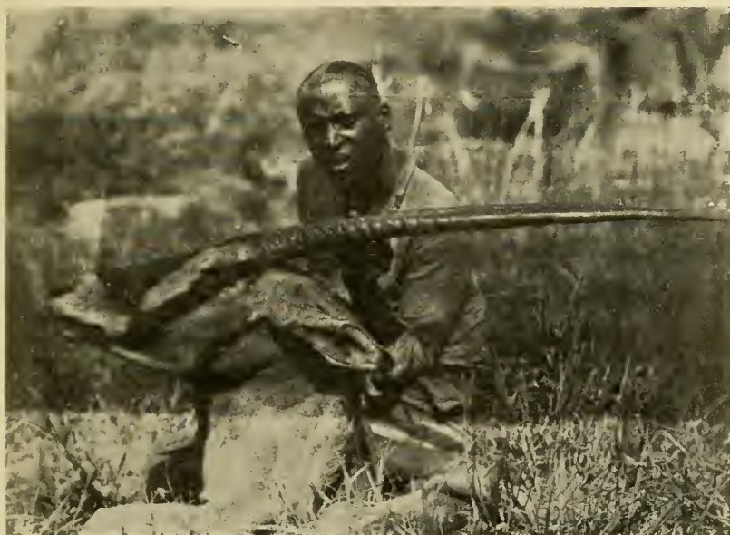
HEAD OF LARGE BULL ORYX.