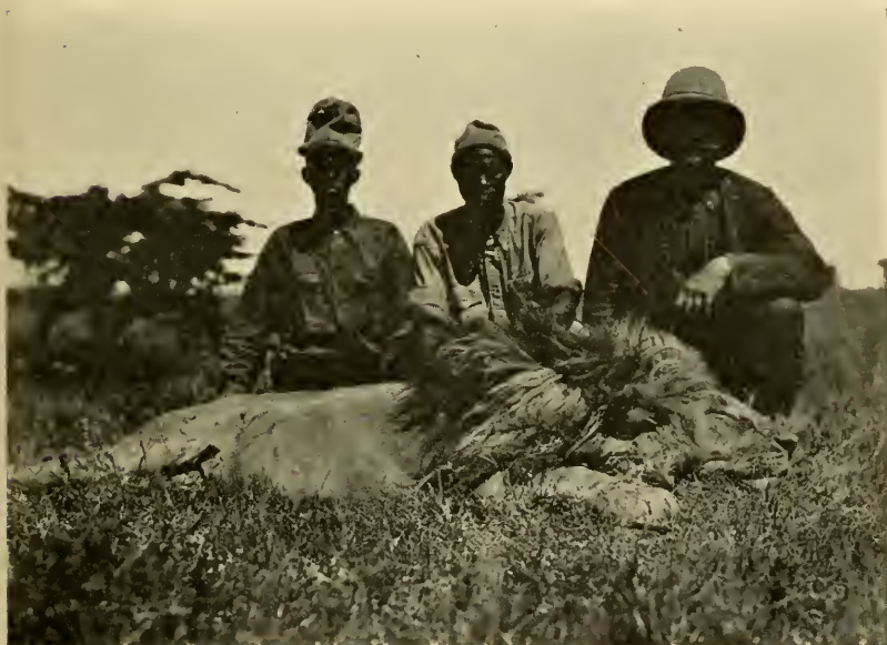
SAME AS ABOVE.

Note the enormous size of the mane, the longest hairs of which measure seventeen inches.