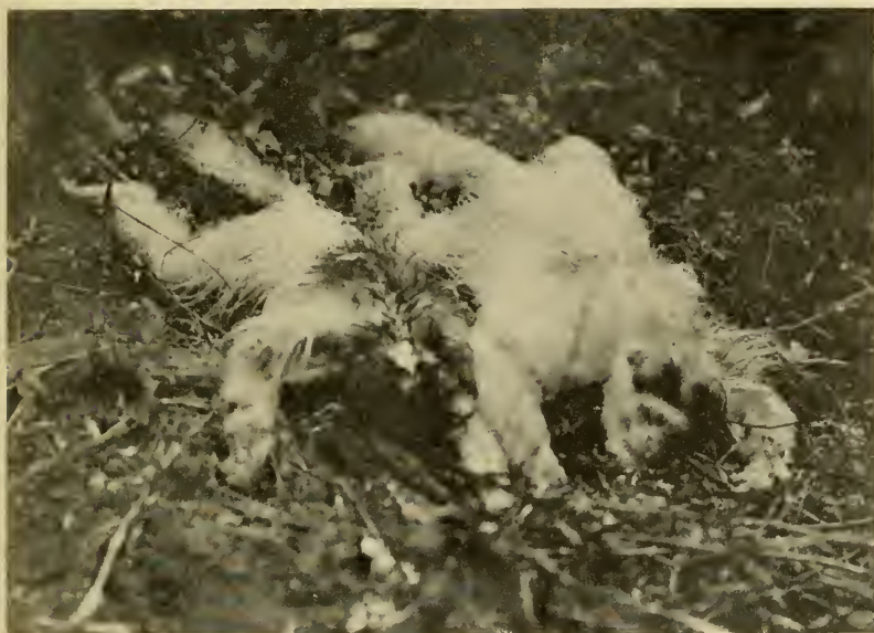
TWO WHITE COLOBUS MONKEYS.

The right-hand one is a large female without a black spot on its body skin. Both secured on Kenia.