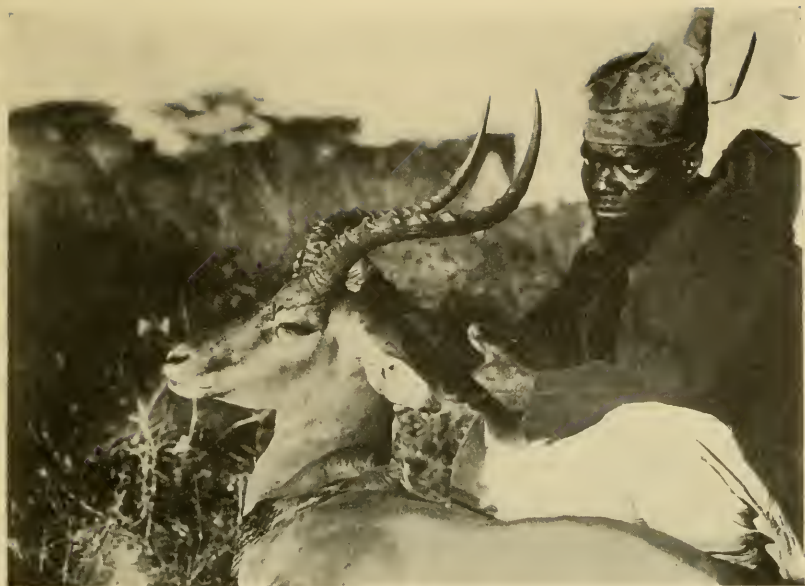
SPLendid IMPALA FROM LAIKIPIA.