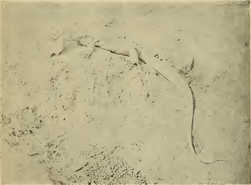
IGUANA, THE LARGEST OF AFRICAN LIZARDS.