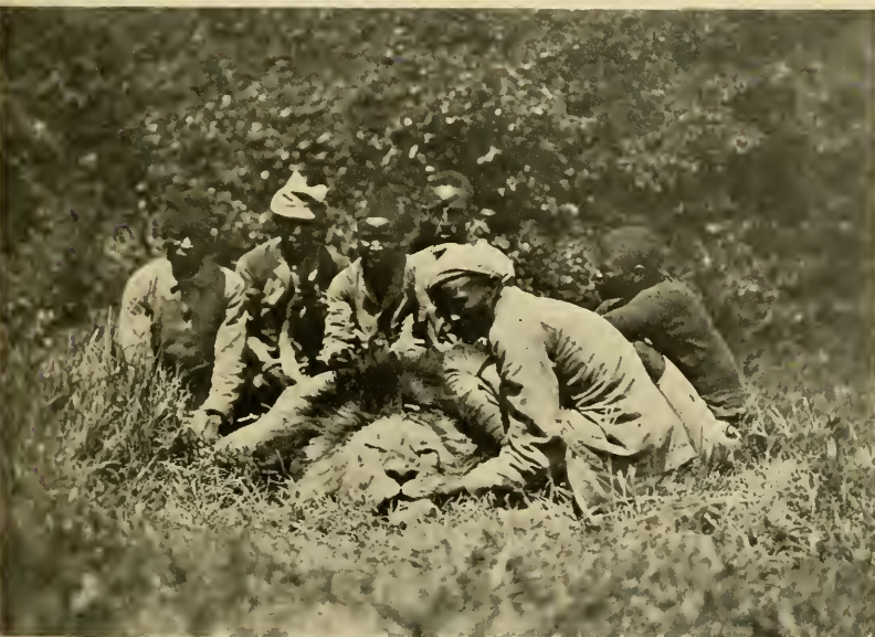
A FINE SPECIMEN.