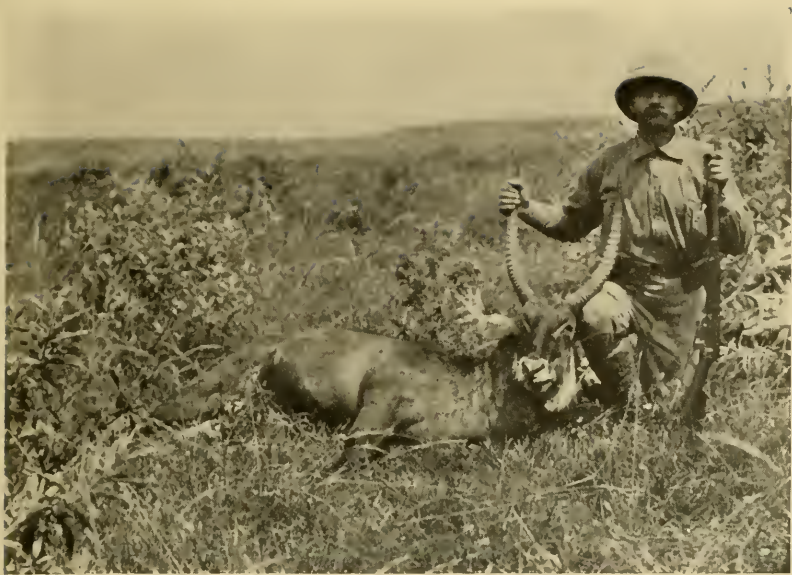
SMALL WATER BUCK, KILLED ON LAIKIPIA.

Found to be a new subspecies of the defassa family and subsequently called " Cobus defassa tjaderi ."