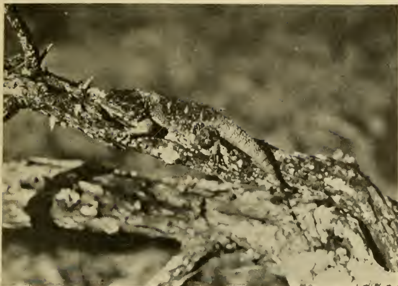
CHAMELEON, WHICH CERTAINLY POSSESSES PROTECTIVE COLORATION.