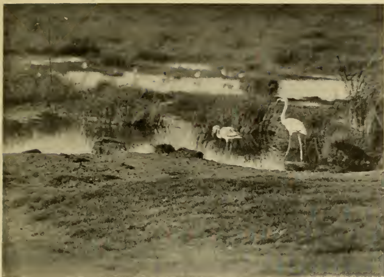
A PAIR OF FLAMINGOES.

They became so tame that the author could walk up to them within a few yards before they would stroll away, as seen in this picture.