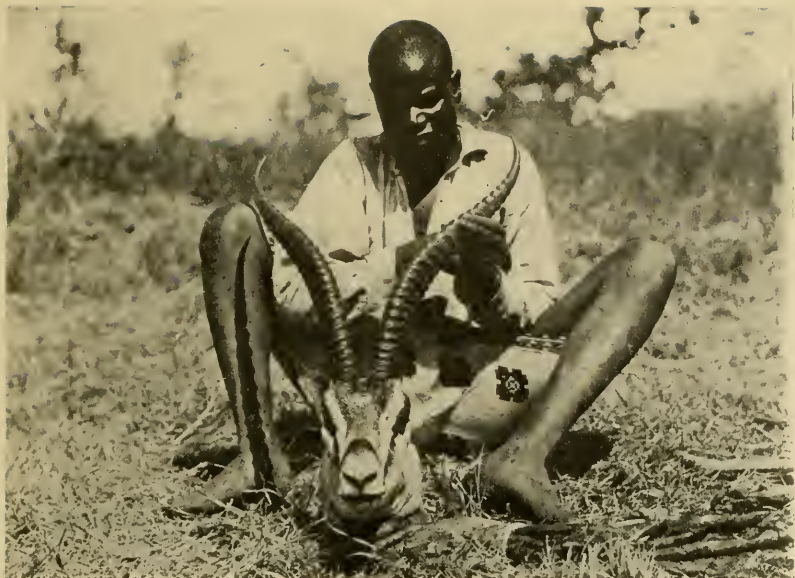
BEAUTIFUL HEAD OF THE GRANT'S GAZELLE.