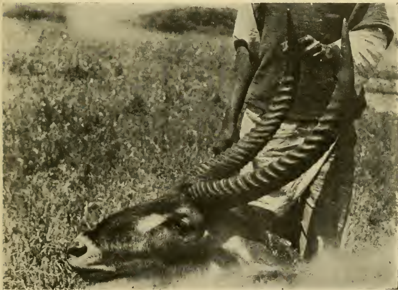
LARGE HEAD OF THE ORDINARY WATER BUCK ( Cobus defassa ).