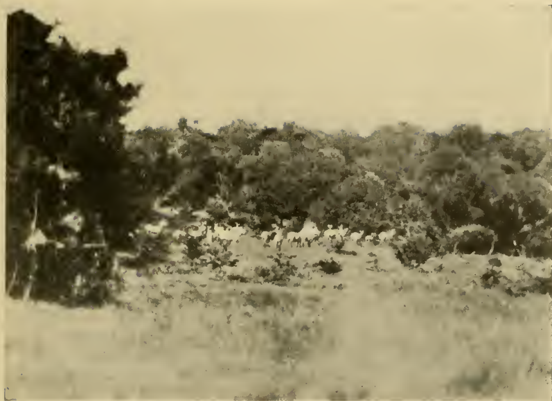
HERD OF ZEBRA, JUST ENTERING A FOREST ON KENIA.