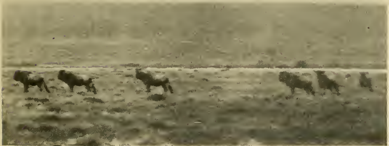
SMALL HERD OF WILDEBEESTS, THE WHITE BEARDED GNU, SOTIK, 1909.