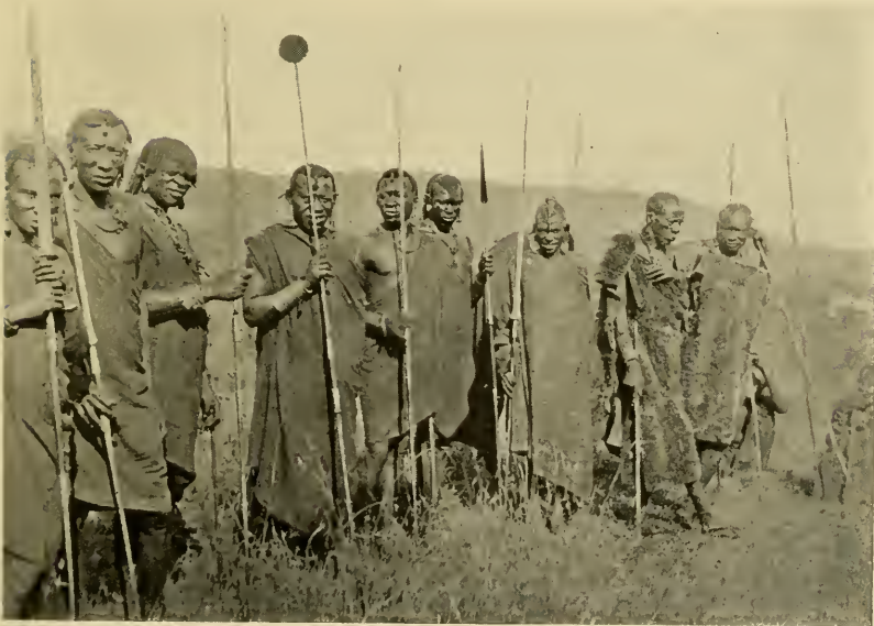
MASAI EL-MORAN WARRIORS. Two old chiefs are standing on the right.