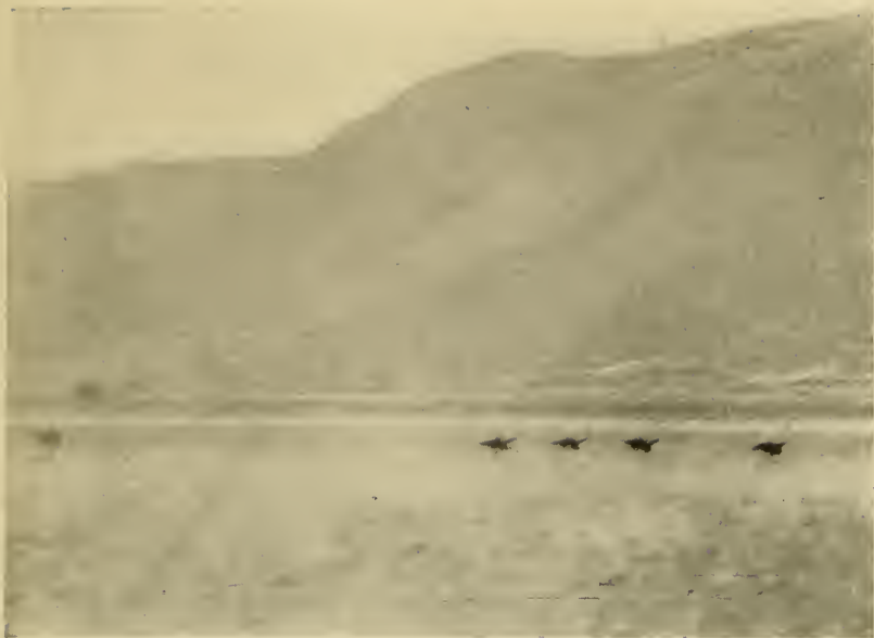
FIVE OSTRICHES RUNNING AWAY AT HIGH SPEED AT SOME 300 YARDS.