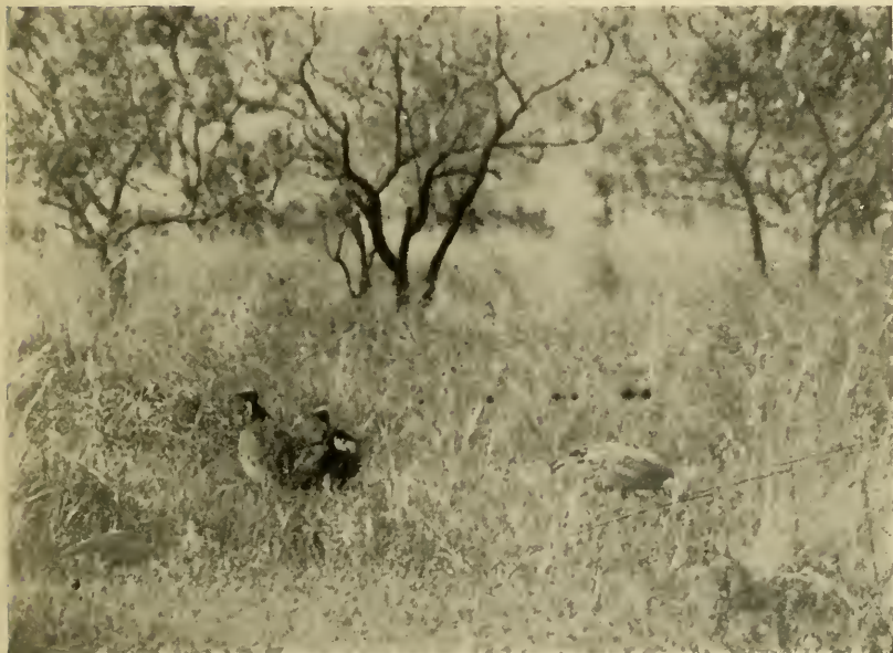
BUZZARDS IN THE ACT OF GETTING ON THE REMAINS OF A HARTEBEEST.