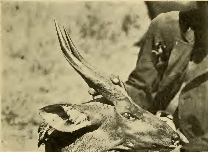
HEAD OF A NEW VARIETY OF BUSH BUCK CALLED " Tragelaphus tjaderi ." Compare this with the photograph above and note the difference in the markings and shape of head.