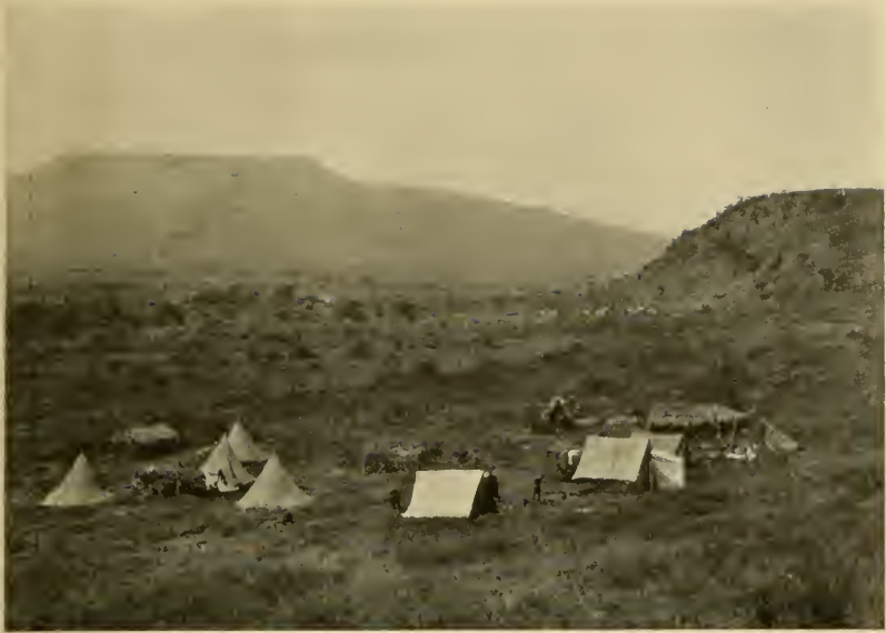
CAMP OF THE TJADER EAST AFRICAN EXPEDITION, 1906, AT SOLAI, B. E. A.