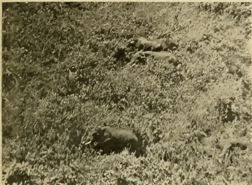
ELEPHANTS COMING THROUGH HIGH BUSH AND ELEPHANT GRASS, KISILI, 1909.