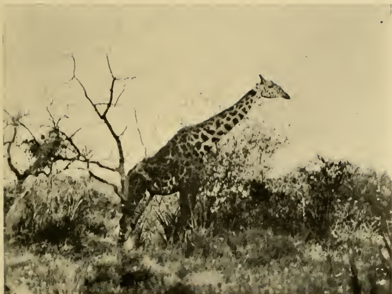
LARGE BULL GIRAFFE; SHOT THROUGH THE HEART NEAR MAUNGU R. R. STATION.