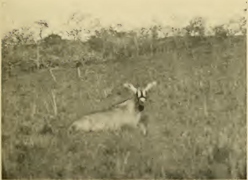
WOUNDED ROAN ANTELOPE, JUST BEFORE THE LAST CHARGE. Shot near Muhoroni R. R. Station.