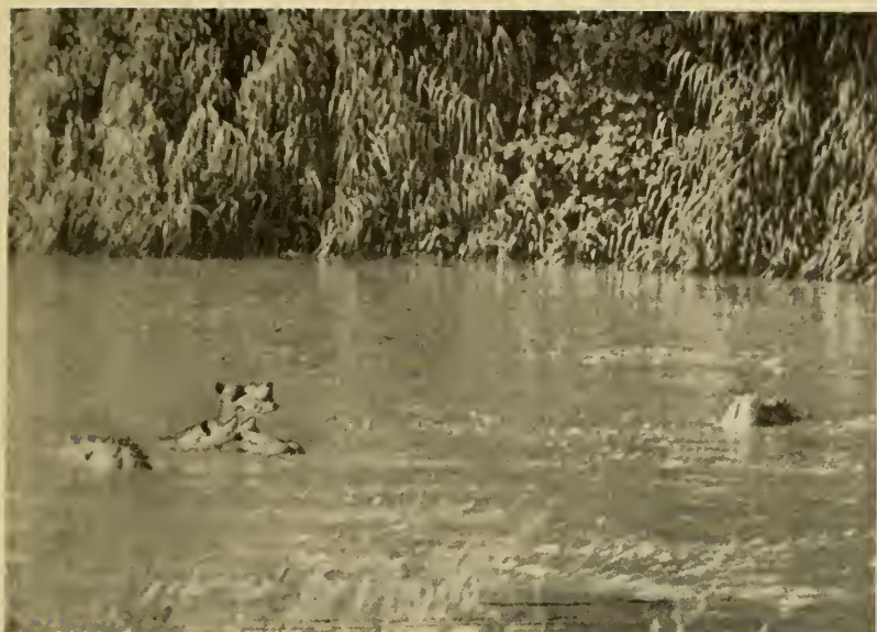
HIPPO HEADS SHOWING ABOVE THE SURFACE OF THE WATER IN THE SONDO RIVER.