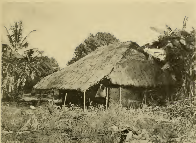
TYPICAL SWAHILI HOUSE ON THE COAST.