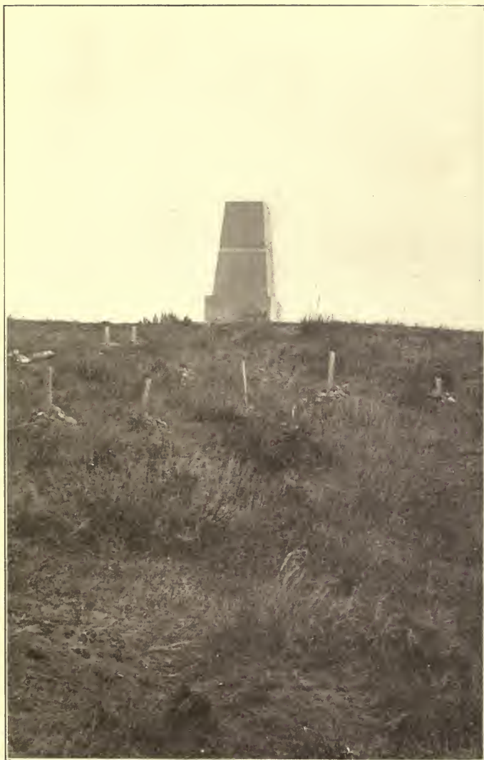
THE BATTLE-FIELD OF THE LITTLE BIG HORN.