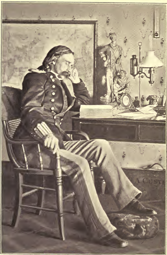
GENERAL CUSTER IN HIS STUDY.