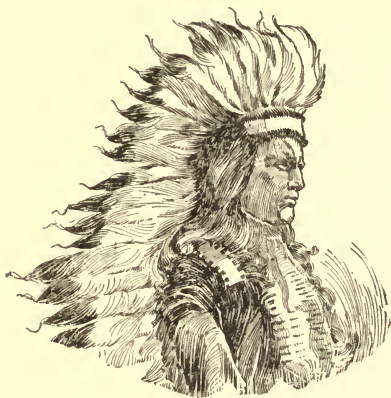
INDIAN IN WAR-BONNET.

came forth with almost a sob from every throat. At that very hour the fears that our tortured minds had portrayed in imagination, were realities, and the souls of those we thought upon were ascending to meet their Maker.