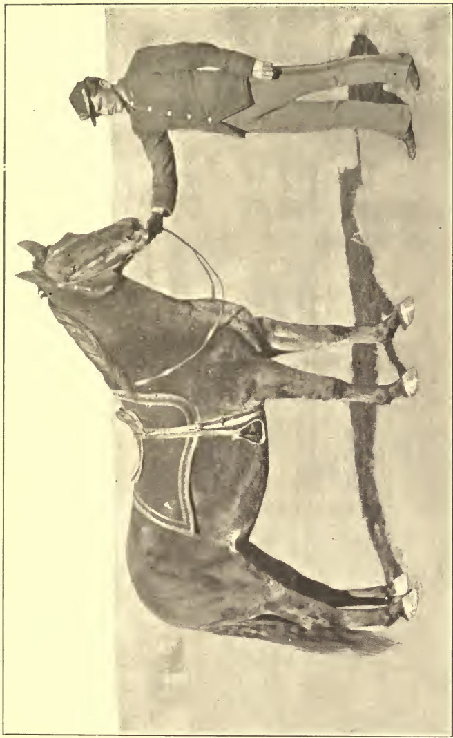
COMANCHE, CAPTAIN KEOUGH'S HORSE.

The only thing found alive on the Custer battle-field.