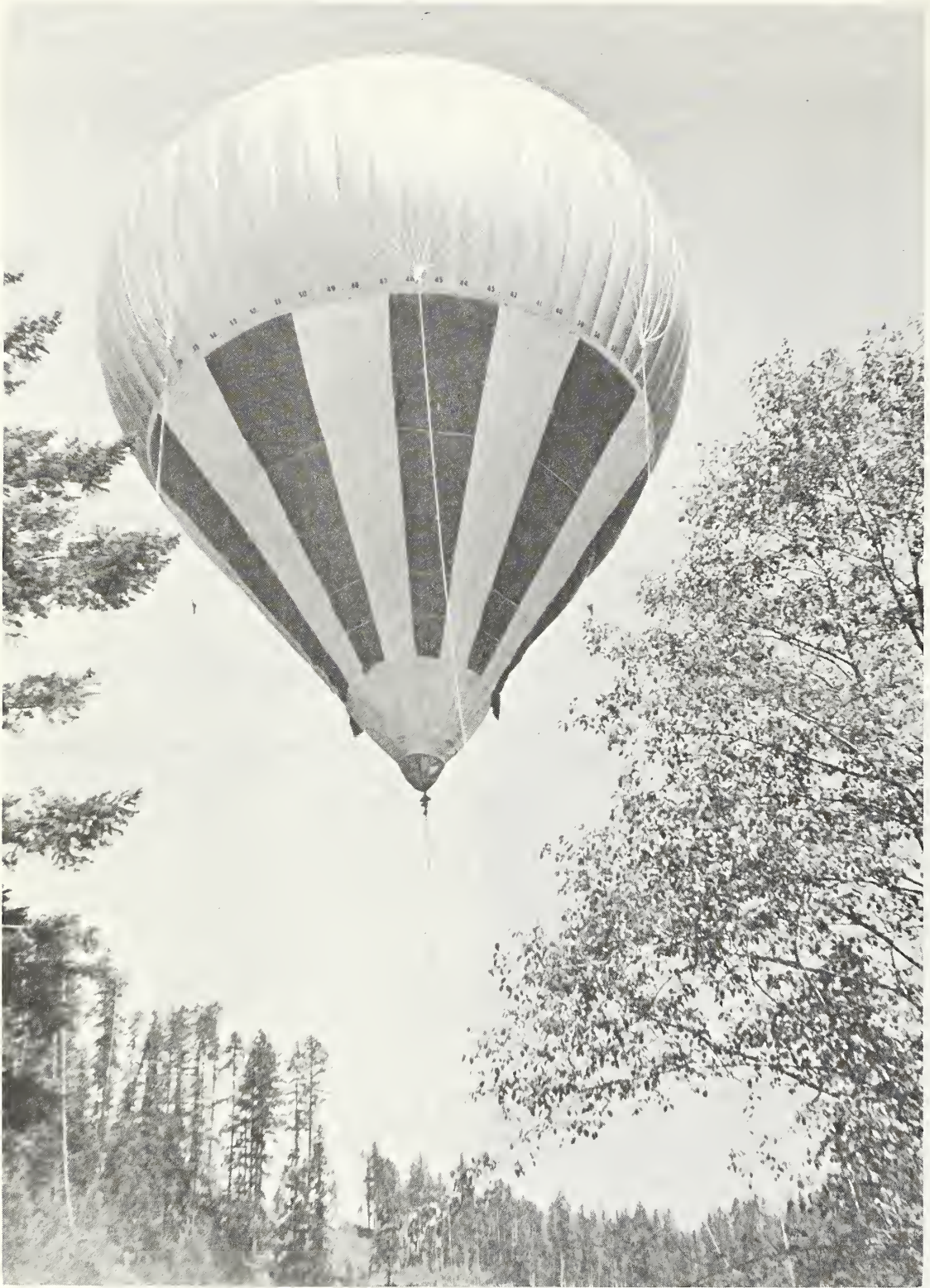
Figure 1.--Raven Industries, Inc., natural-shaped balloon.