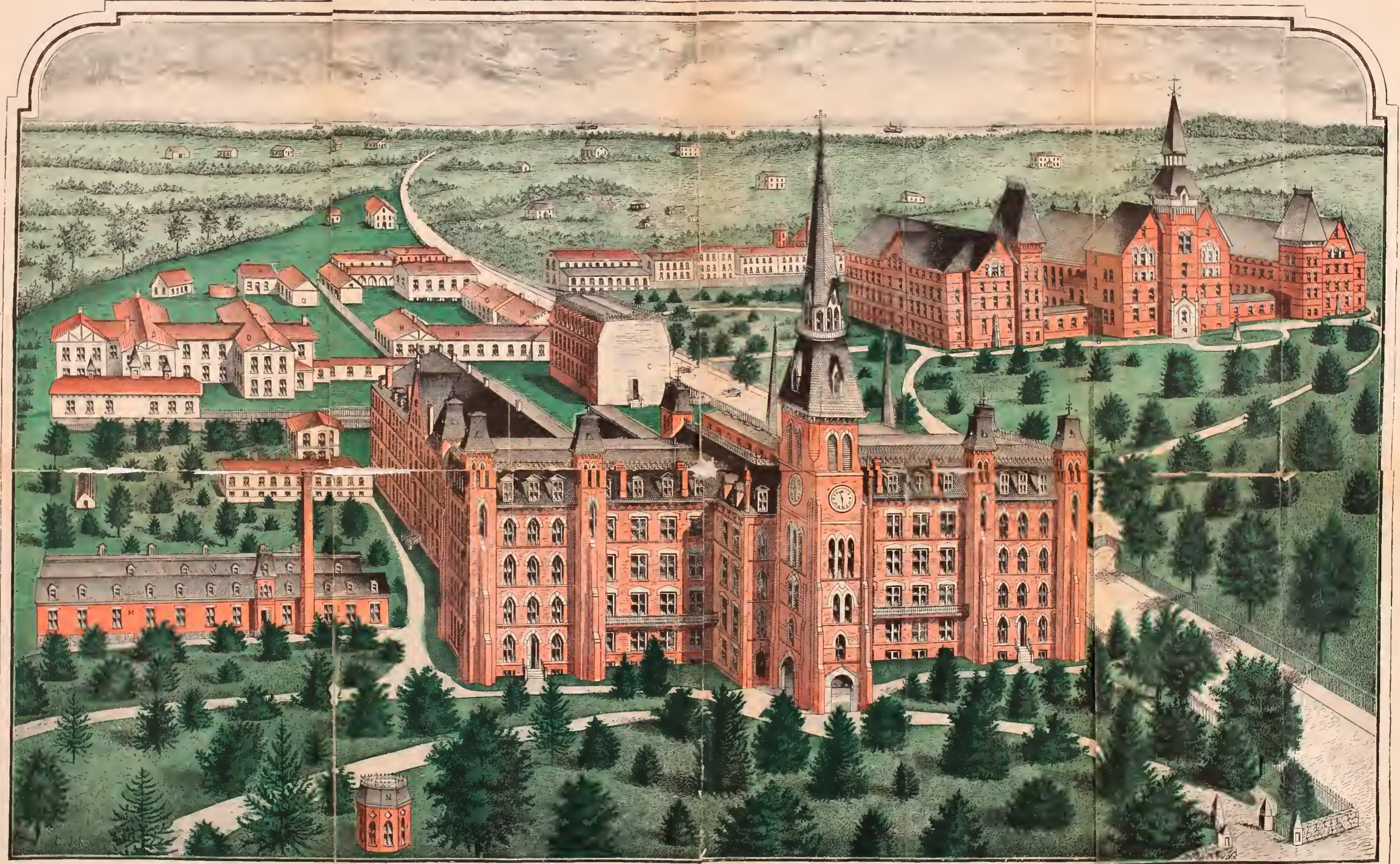
NEW YORK CATHOLIC PROTECTORY PRINT.