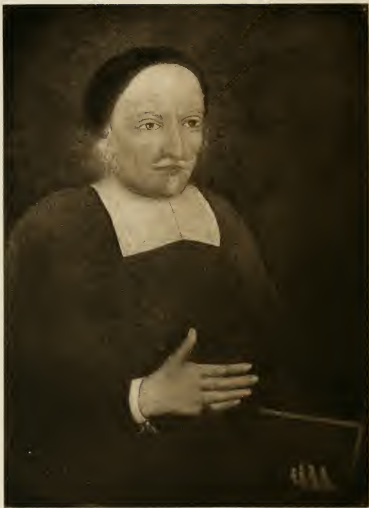
Reverend. Francis Higginson